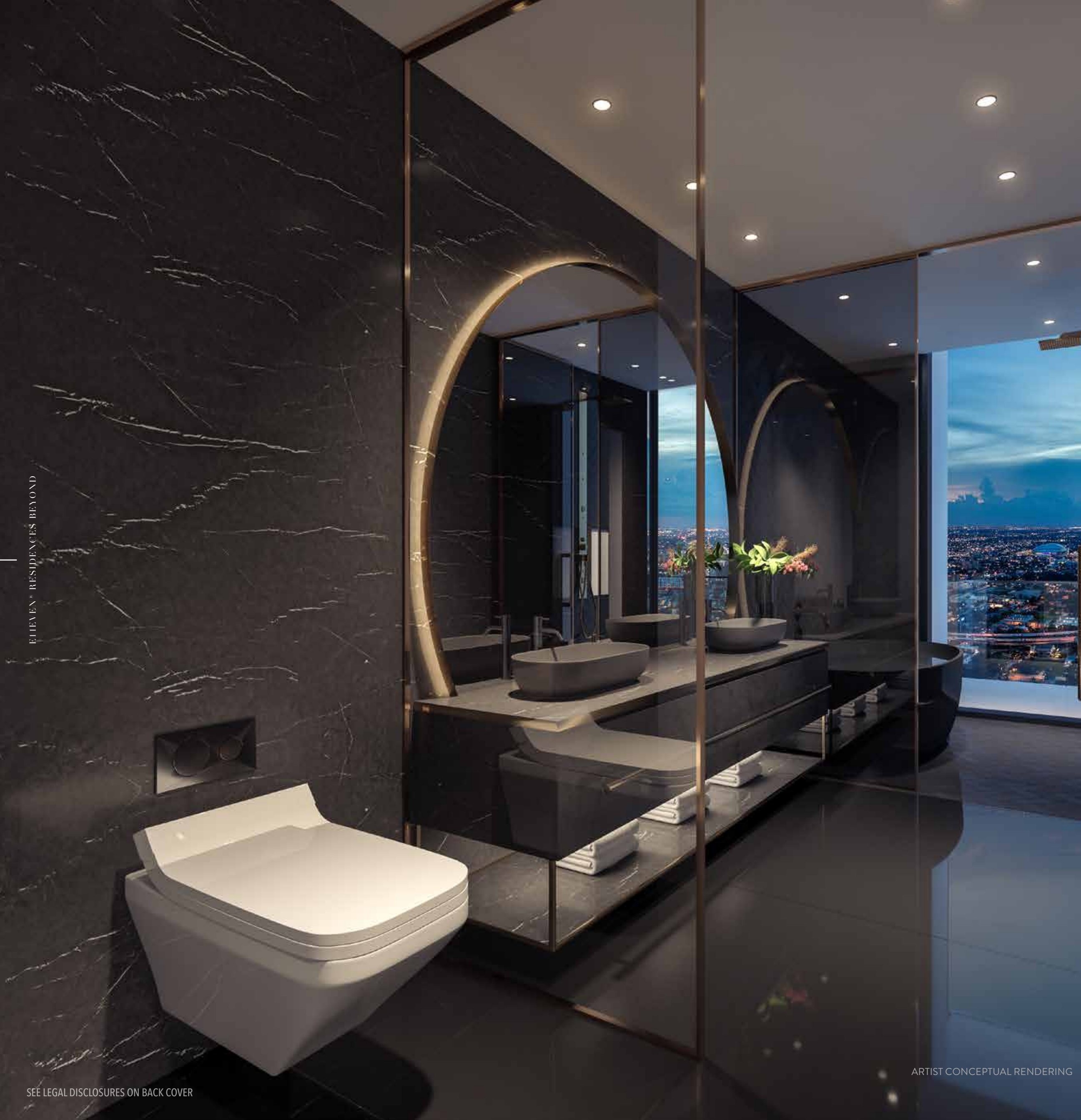
ARTIST CONCEPTUAL RENDERING