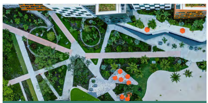
UNIVERSITY OF MIAMI LAKESIDE VILLAGE