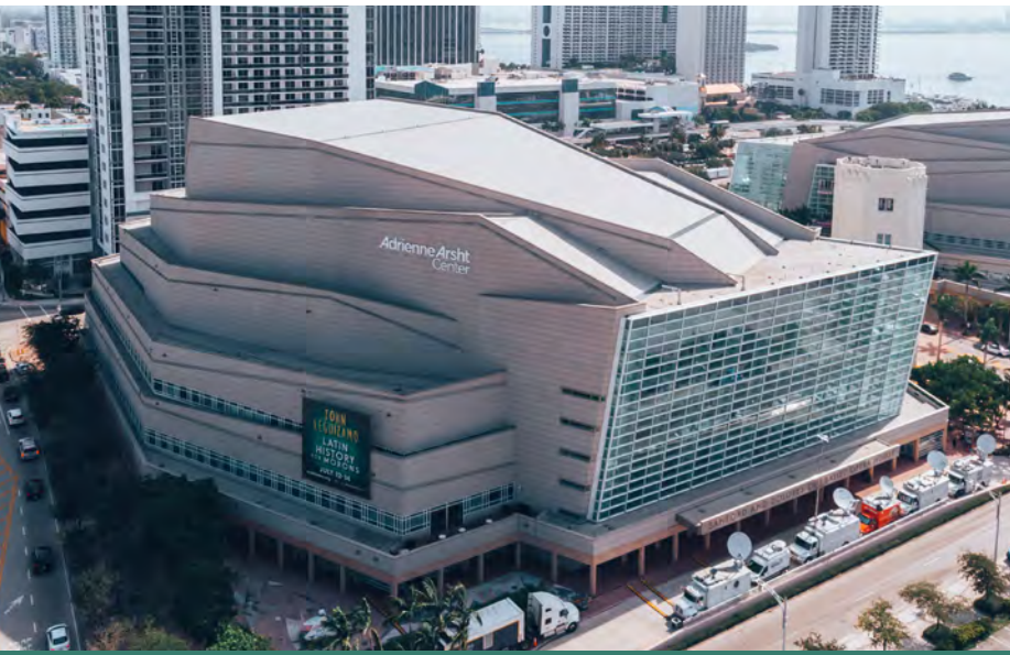
ADRIENNE ARSHT CENTER FOR THE PERFORMING ARTS OF MIAMI

A pair of glass towers with flowing design profiles rises high above Miami's chic Edgewater neighborhood. Directly on the shores of Biscayne Bay and surrounded the bustling Downtown and Brickell city centers, Design District, Wynwood, Midtown, and Miami Beach. Aria Reserve is immediately recognizable, yet feels like a private estate hidden away from the rest of the world.