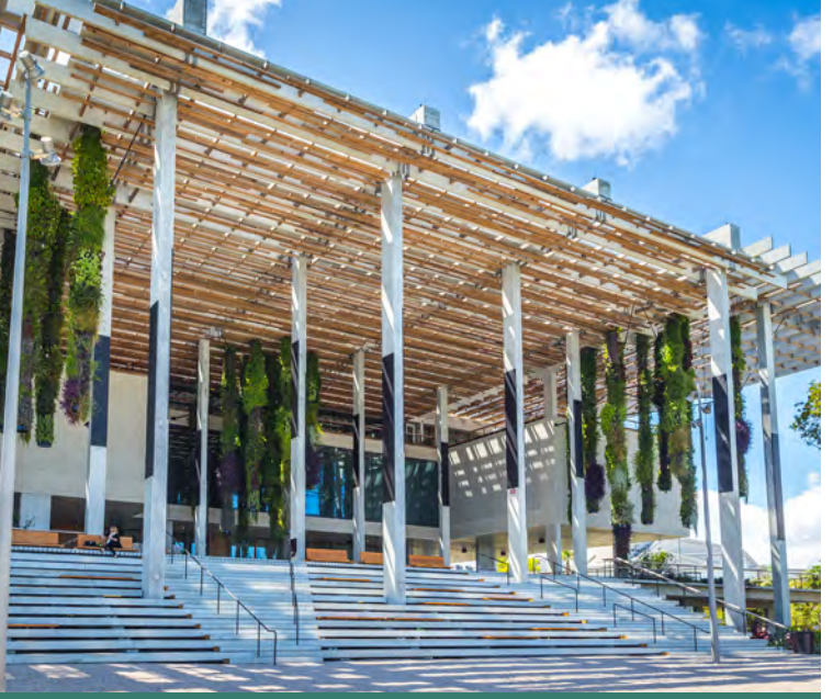
PÉREZ ART MUSEUM MIAMI