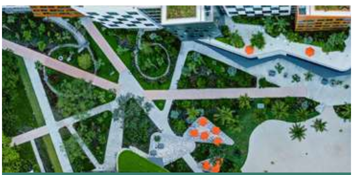
UNIVERSITY OF MIAMI LAKESIDE VILLAGE