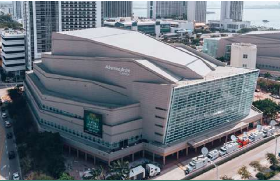
ADRIENNE ARSHT CENTER FOR THE PERFORMING ARTS OF MIAMI

A pair of glass towers with flowing design profiles rises high above Miami's chic Edgewater neighborhood. Directly on the shores of Biscayne Bay and surrounded the bustling Downtown and Brickell city centers, Design District, Wynwood, Midtown, and Miami Beach. Aria Reserve is immediately recognizable, yet feels like a private estate hidden away from the rest of the world.