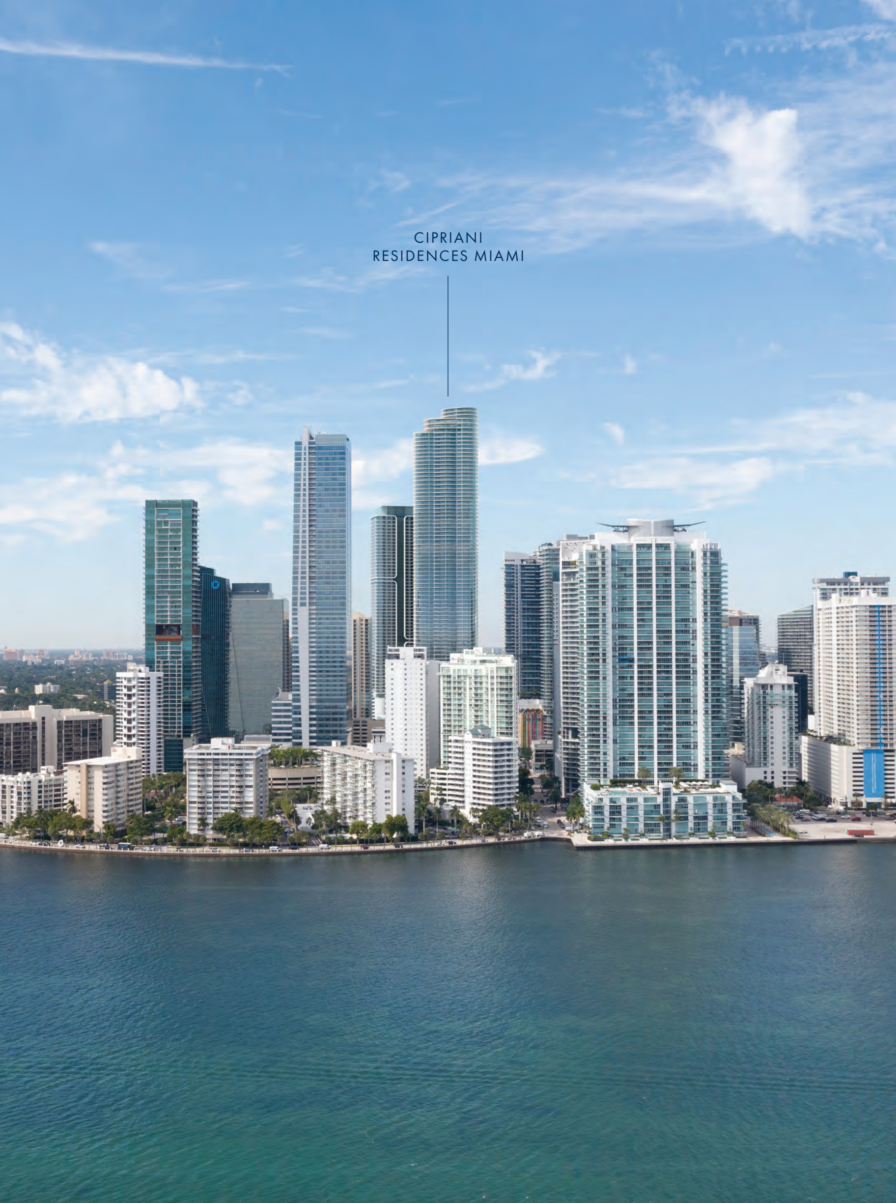
CIPRIANI RESIDENCES MIAMI