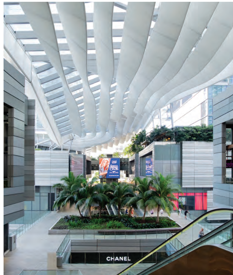
Left Page: Brickell City Centre