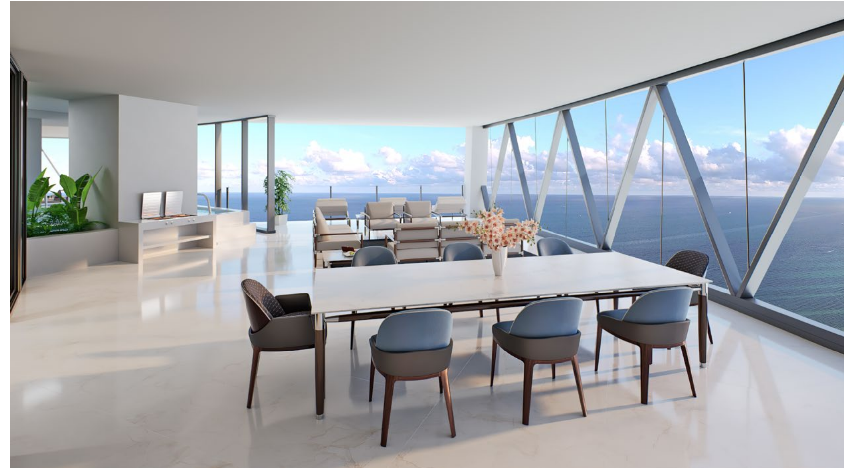
Residence Azure Florida Room