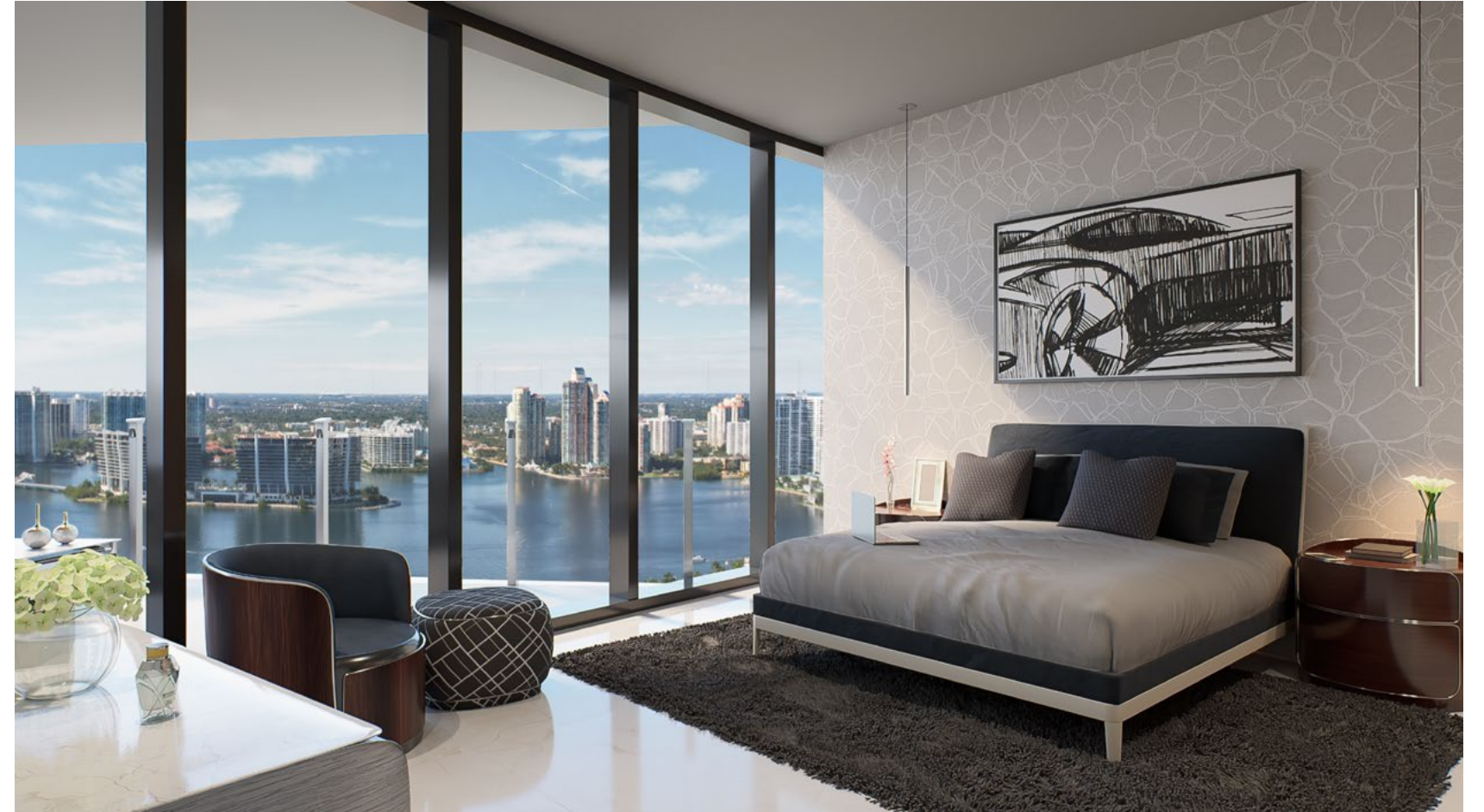
Residence Bentayga Master Bedroom