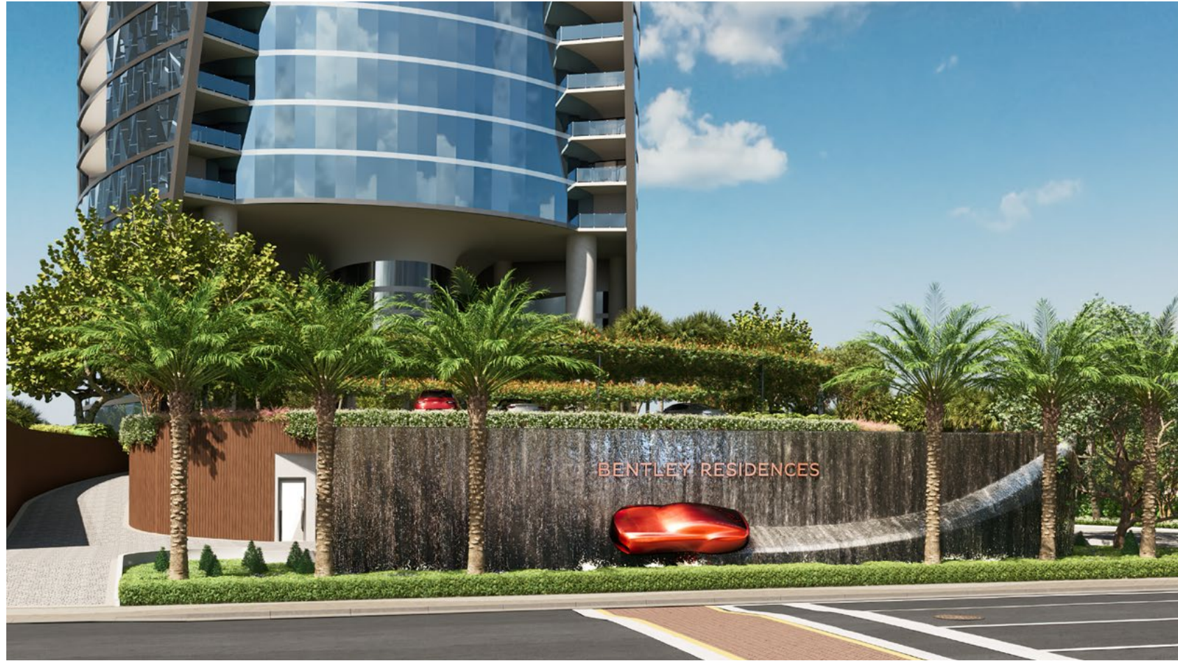
Collins Avenue Entrance