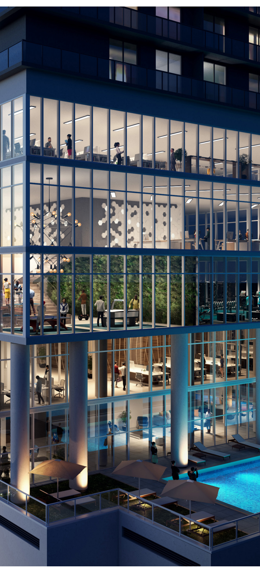
ARTIST CONCEPTUAL RENDERING