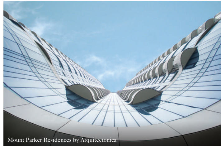
Mount Parker Residences by Arquitectonica