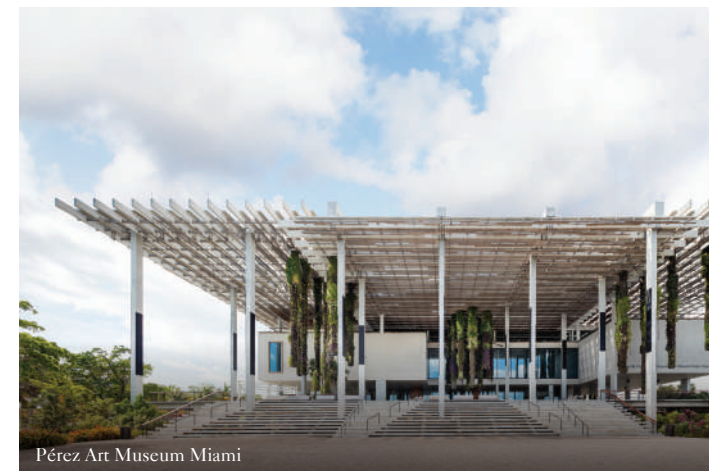
Pérez Art Museum Miami