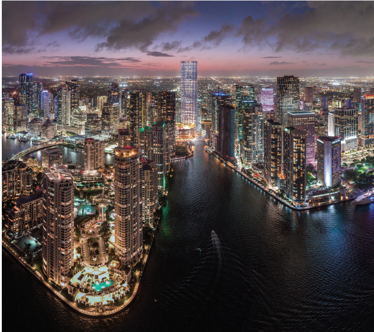
Above: Artist's Conceptual Rendering