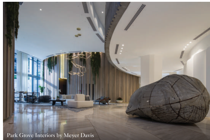
Park Grove Interiors by Meyer Davis