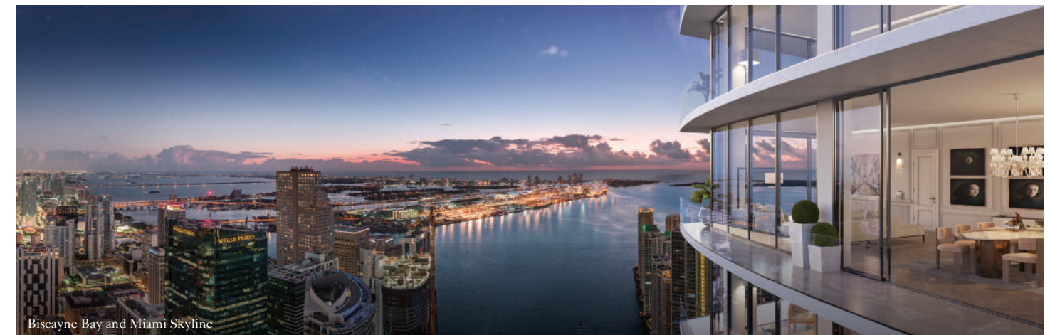
Biscayne Bay and Miami Skyline