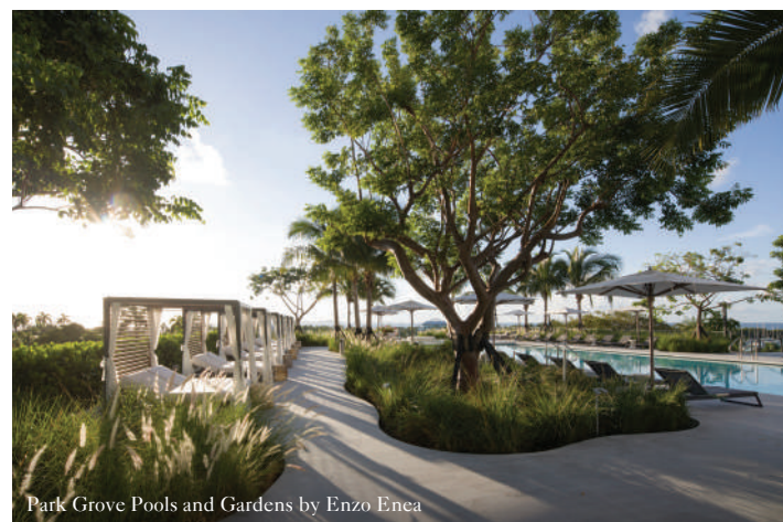
Park Grove Pools and Gardens by Enzo Enea