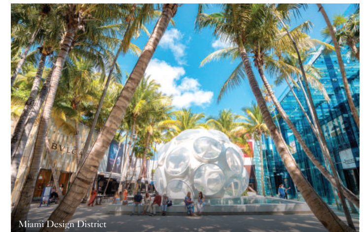
Miami Design District