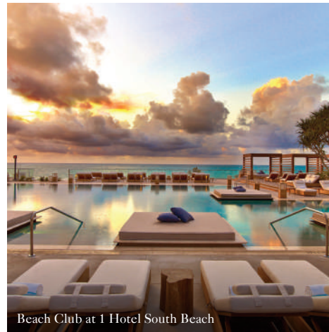
Beach Club at 1 Hotel South Beach

The private marina, planned riverside restaurant and lushly landscaped river promenade invite residents to spend hours and days luxuriating in the infinite energy and organic sparkle of life by the water. Watch the superyachts come and go, take a sunset stroll towards the bay, or head to a number of chic waterside restaurants courtesy of our private water taxi service. Residents can enjoy private membership and exclusive access to the Beach Club at 1 Hotel South Beach, SH Hotels & Resorts sister property. With loungers, beach towel services, cabanas, and seaside snack and beverage services, this waterfront community will cater to leisurely hours under the sun. Take a break from the hustle and bustle of the city and unwind with a cool drink in hand and the sand between your toes.