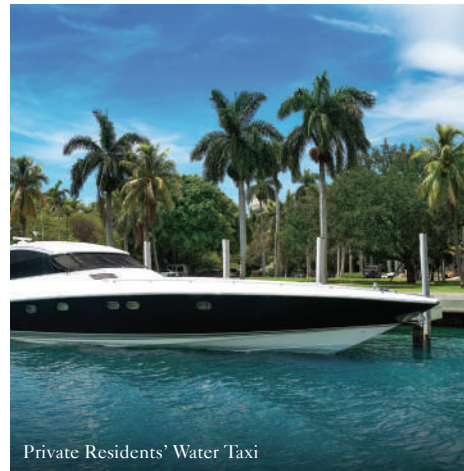
Private Residents' Water Taxi