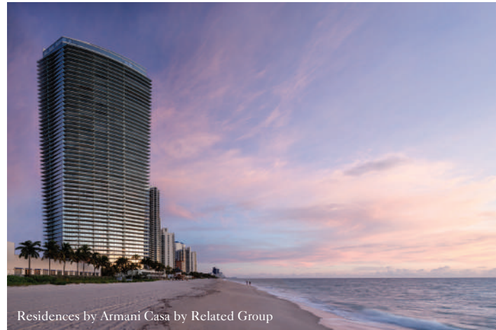
Residences by Armani Casa by Related Group

Renowned Swiss landscape architect Enzo Enea of Zurich-based Enea Garden, is one of the leading landscape architects in the world. A hallmark of Enzo Enea's work is the fusion of indoor and outdoor spaces, the creative intertwining of the soul of the residence with its surroundings.