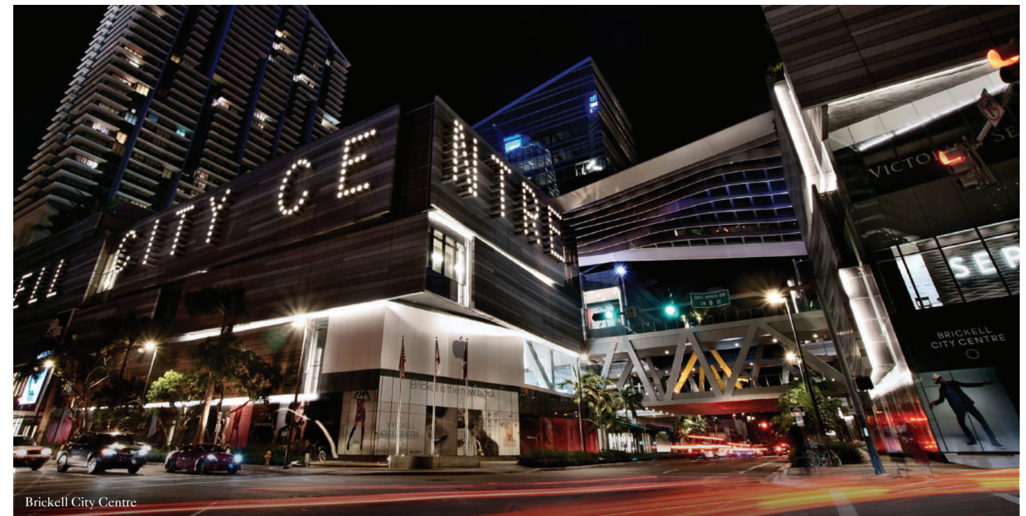
Brickell City Centre

Perfectly positioned at the entrance of Brickell Avenue, where the Miami River meets the beautiful blue waters of Biscayne Bay, and the bustling financial district blends with high-end shopping, top restaurants, cultural hot spots and exciting nightlife—this iconic neighborhood is an all-day all-night lifestyle destination, aptly named the Manhattan of the South.