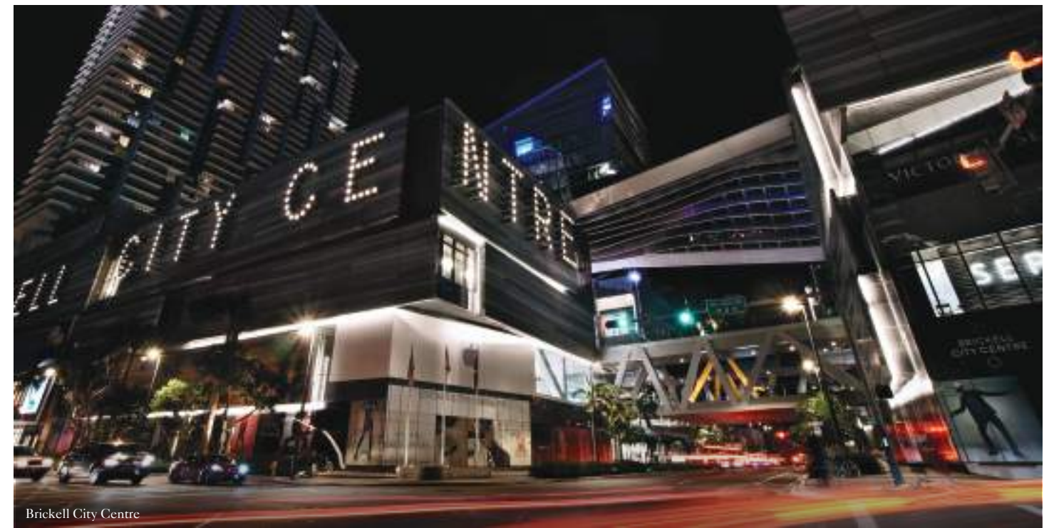
Brickell City Centre

Perfectly positioned at the entrance of Brickell Avenue, where the Miami River meets the beautiful blue waters of Biscayne Bay, and the bustling financial district blends with high-end shopping, top restaurants, cultural hot spots and exciting nightlife—this iconic neighborhood is an all-day all-night lifestyle destination, aptly named the Manhattan of the South.