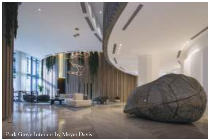
Park Grove Interiors by Meyer Davis