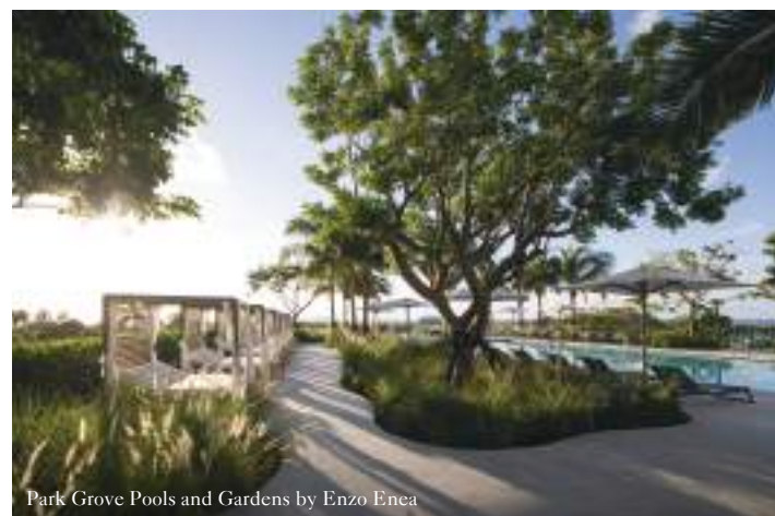
Park Grove Pools and Gardens by Enzo Enea