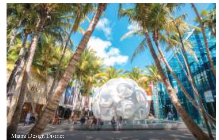
Miami Design District