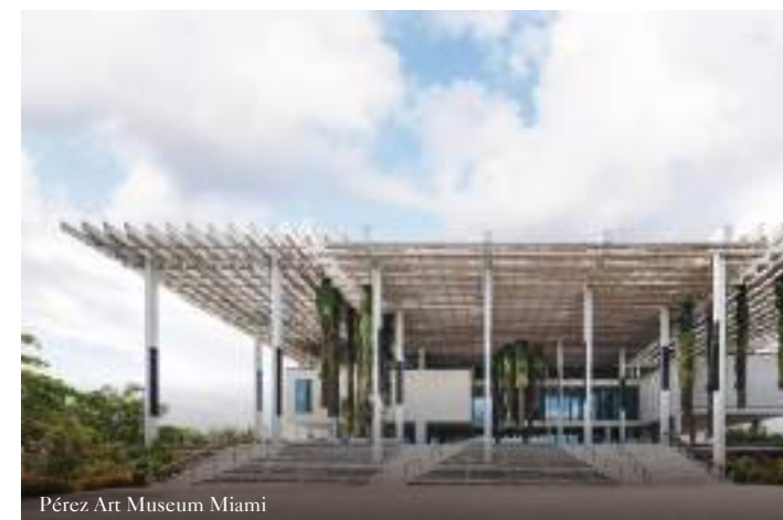
Pérez Art Museum Miami