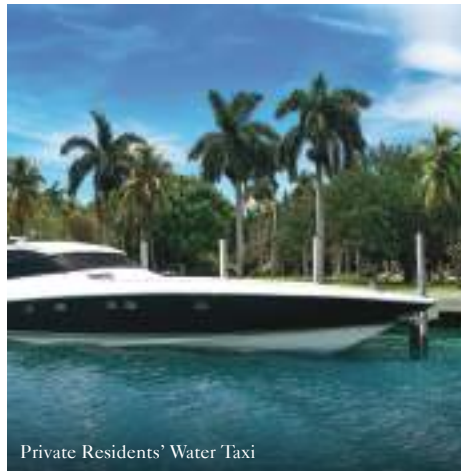
Private Residents' Water Taxi