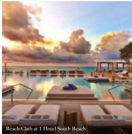
Beach Club at 1 Hotel South Beach

The private marina, planned riverside restaurant and lushly landscaped river promenade invite residents to spend hours and days luxuriating in the infinite energy and organic sparkle of life by the water. Watch the superyachts come and go, take a sunset stroll towards the bay, or head to a number of chic waterside restaurants courtesy of our private water taxi service. Residents can enjoy private membership and exclusive access to the Beach Club at 1 Hotel South Beach, SH Hotels & Resorts sister property. With loungers, beach towel services, cabanas, and seaside snack and beverage services, this waterfront community will cater to leisurely hours under the sun. Take a break from the hustle and bustle of the city and unwind with a cool drink in hand and the sand between your toes.