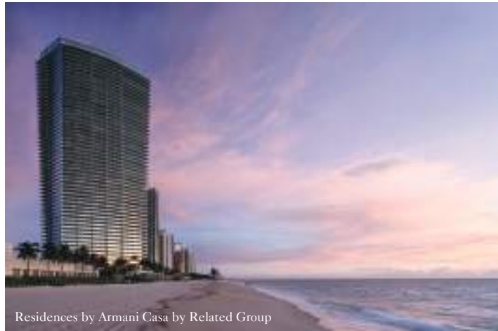
Residences by Armani Casa by Related Group

Renowned Swiss landscape architect Enzo Enea of Zurich-based Enea Garden, is one of the leading landscape architects in the world. A hallmark of Enzo Enea's work is the fusion of indoor and outdoor spaces, the creative intertwining of the soul of the residence with its surroundings.