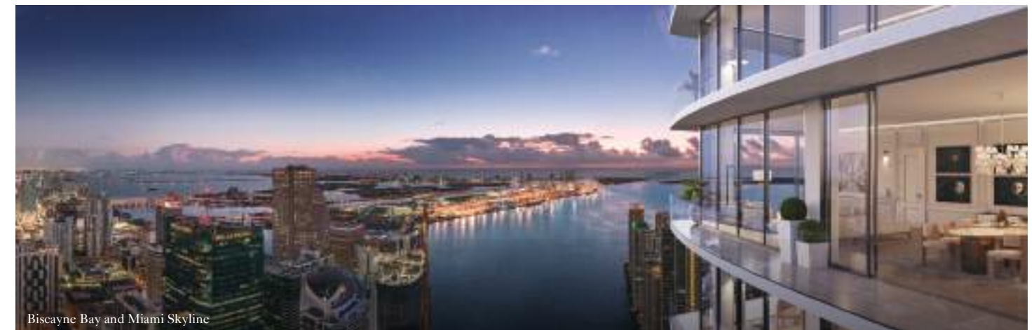
Biscayne Bay and Miami Skyline