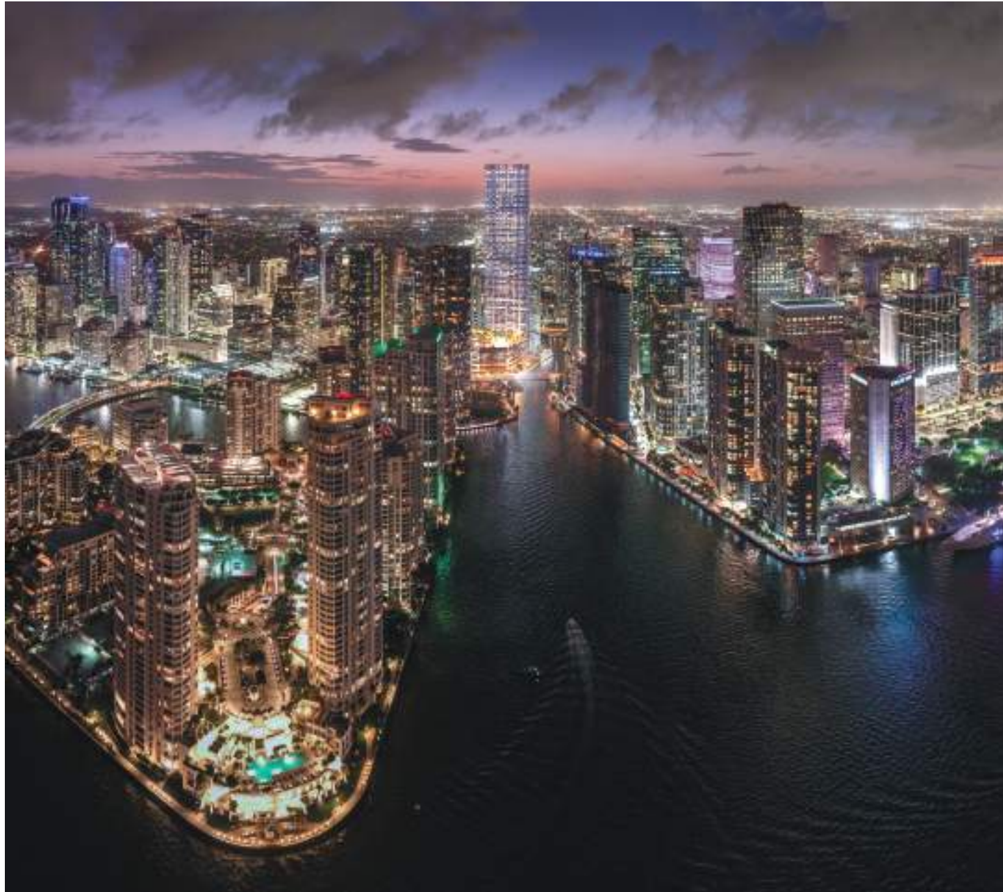
Above: Artist's Conceptual Rendering