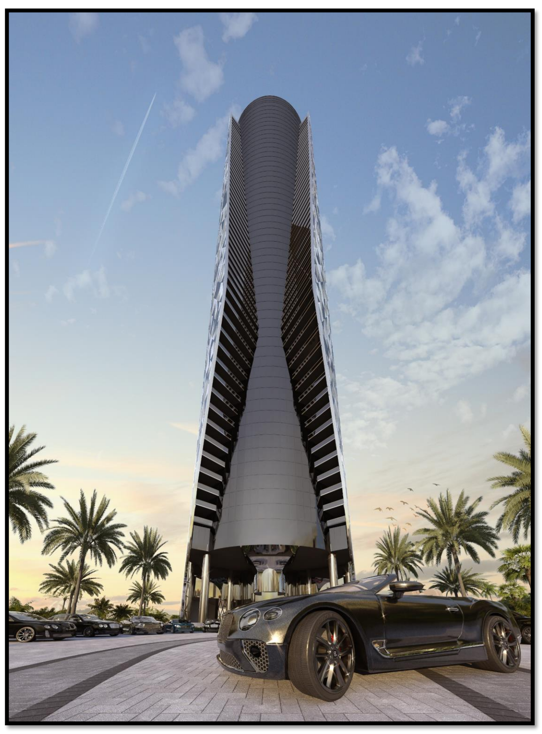
Sunny Isles Beach, FL