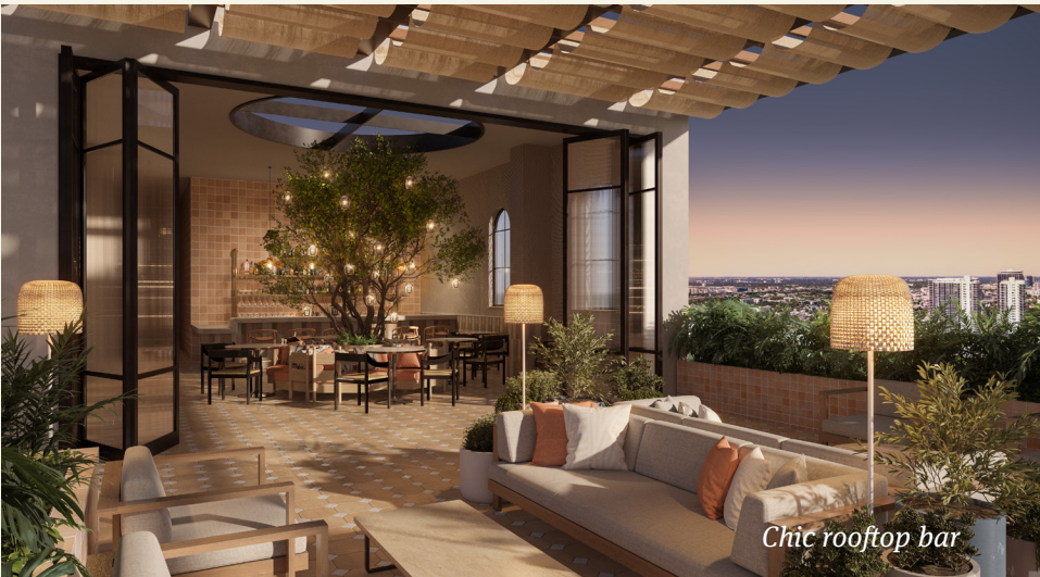
Chic rooftop bar

5% Reservation 15% Contract 10% Groundbreaking 10% Top-off 60% Closing