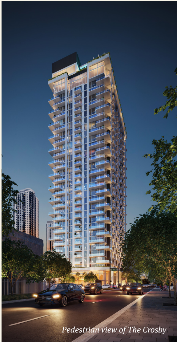
Pedestrian view of The Crosby