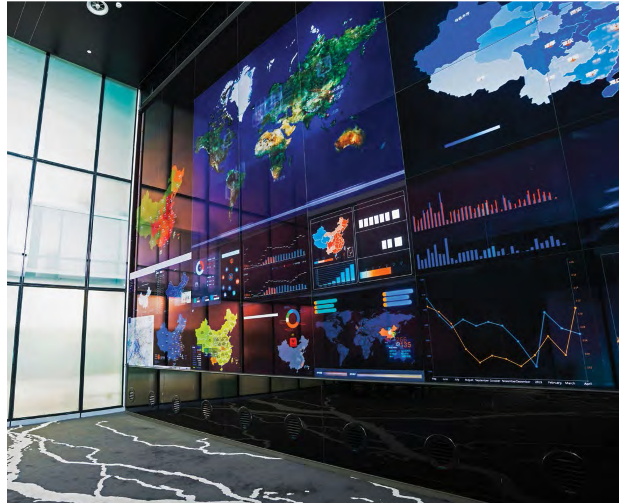
The WALL STREET TRADING ROOM, where you can buy, sell and trade