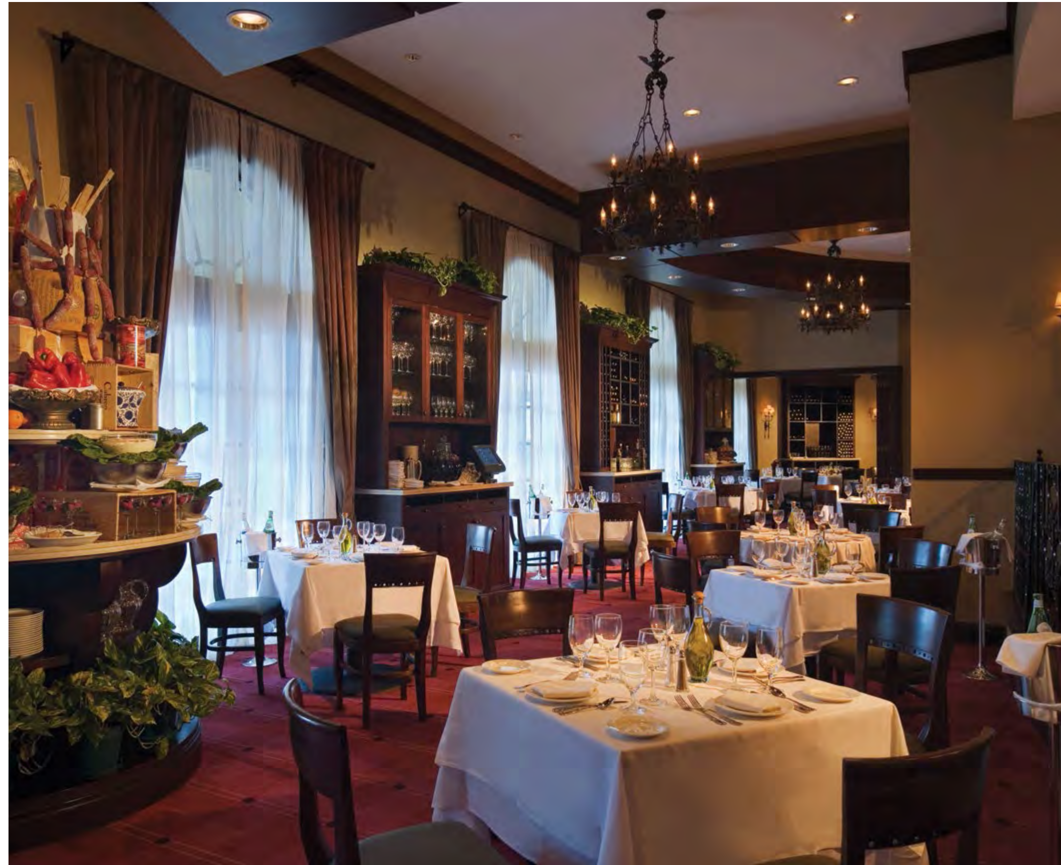
IL MULINO NEW YORK RESTAURANT