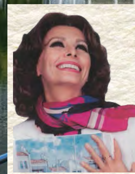
SOPHIA LOREN, spokesperson for WILLIAMS ISLAND