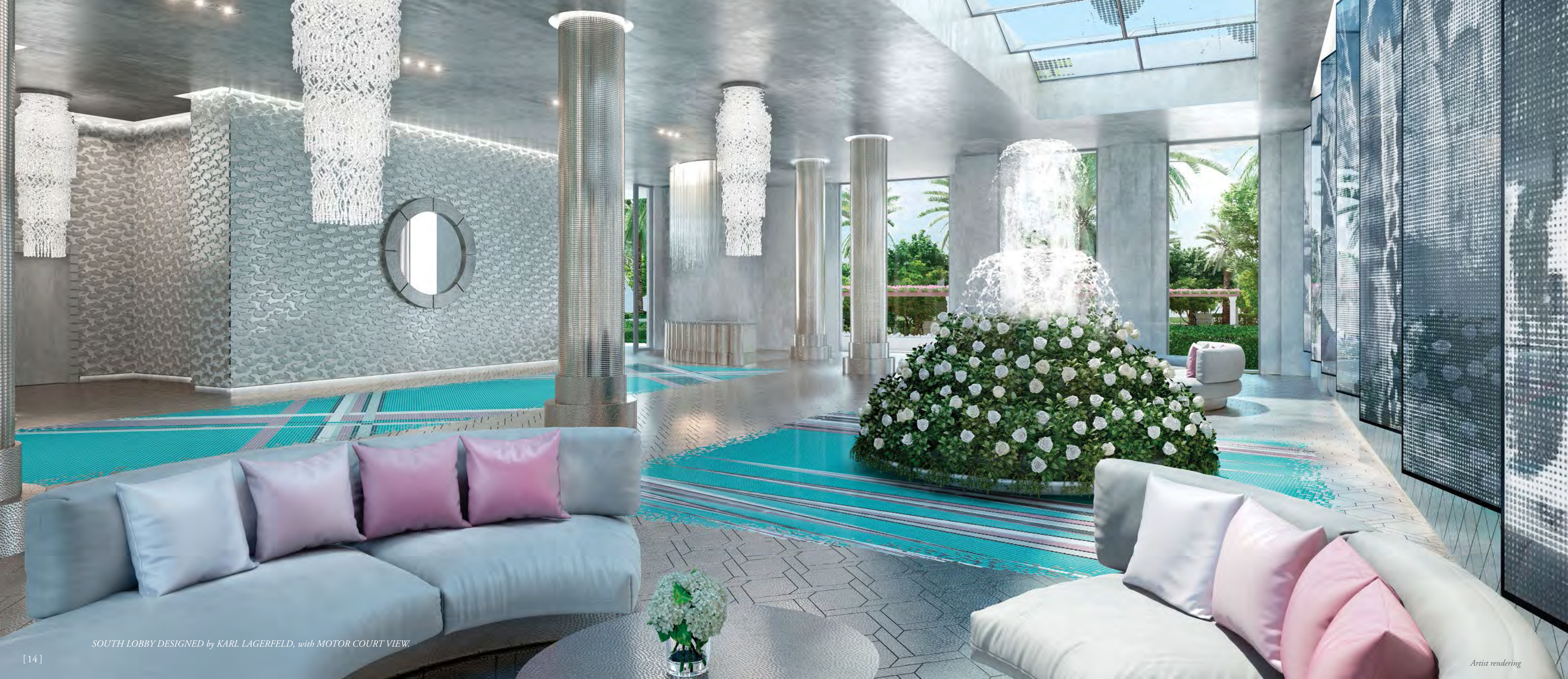
SOUTH LOBBY DESIGNED by KARL LAGERFELD, with MOTOR COURT VIEW.