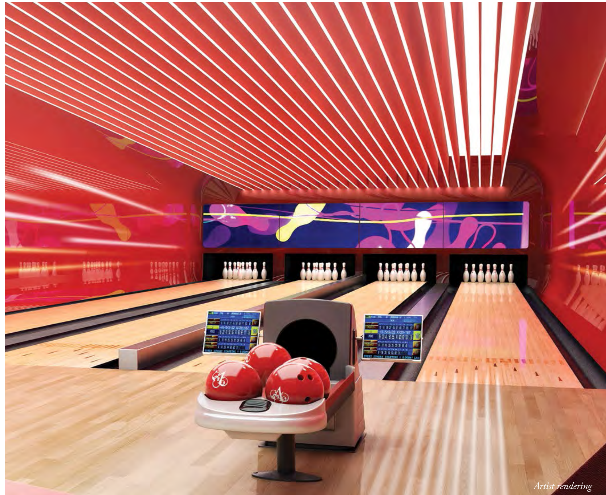
VILLA ACQUALINA features FOUR BOWLING LANES