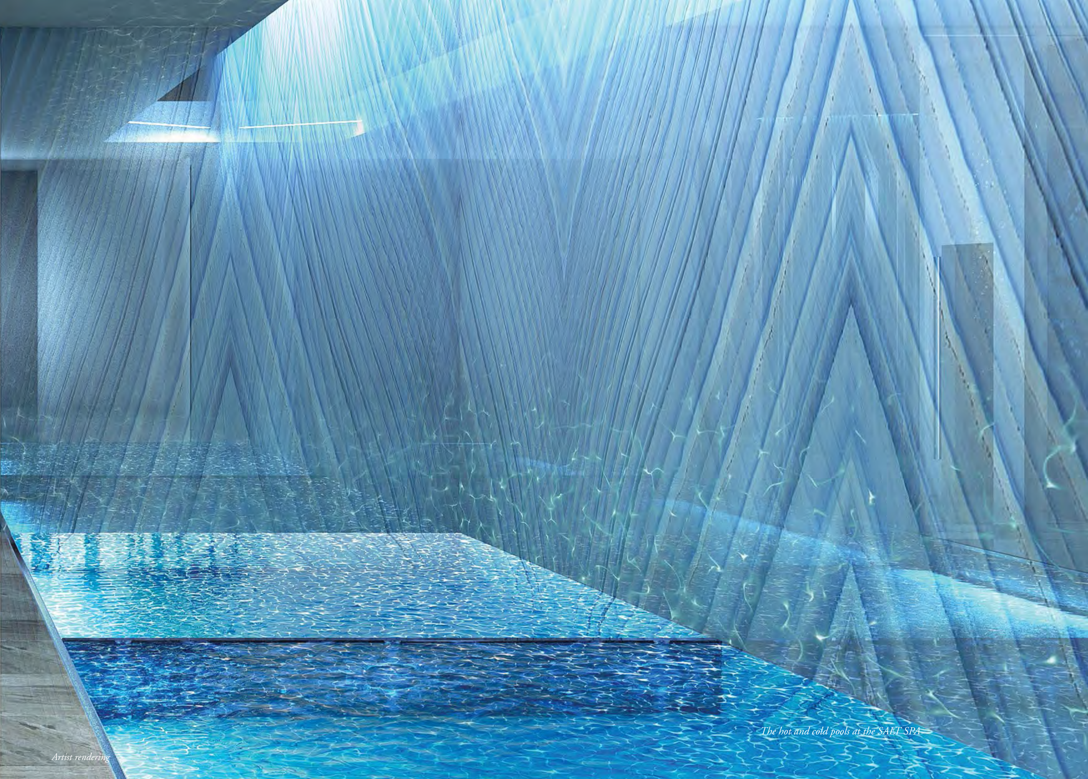
The hot and cold pools at the SALT SPA