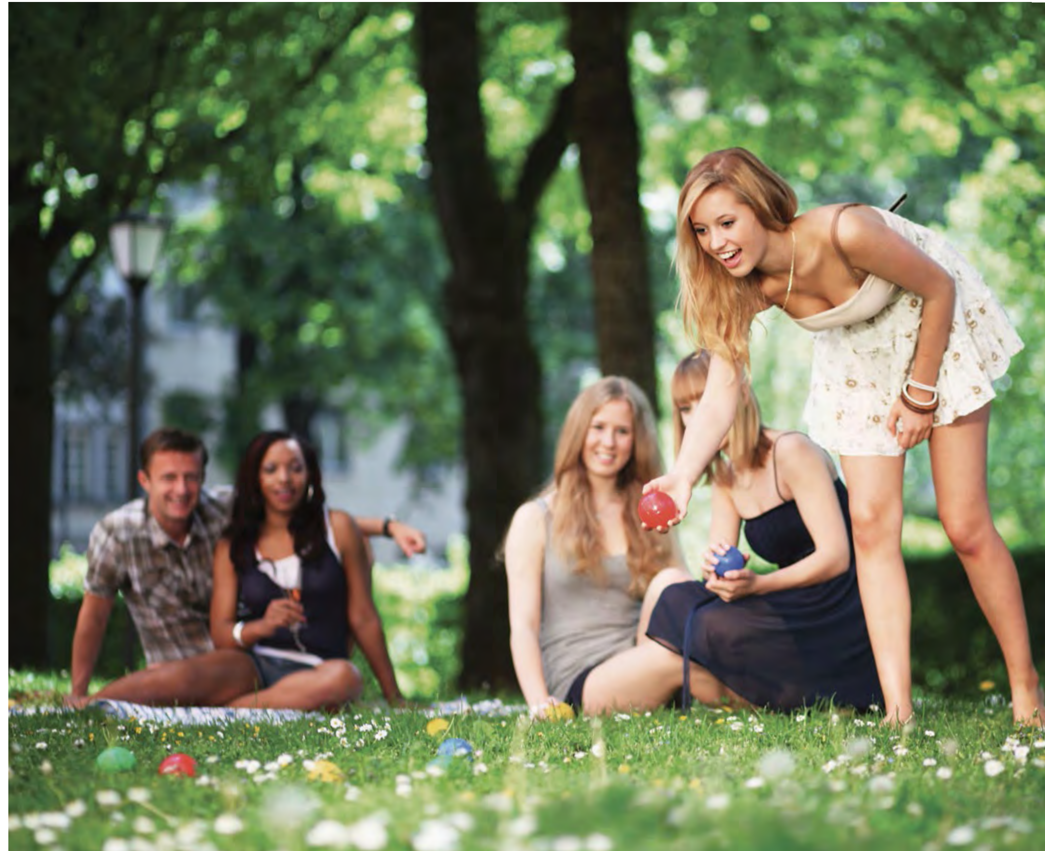
The BOCCE LAWN