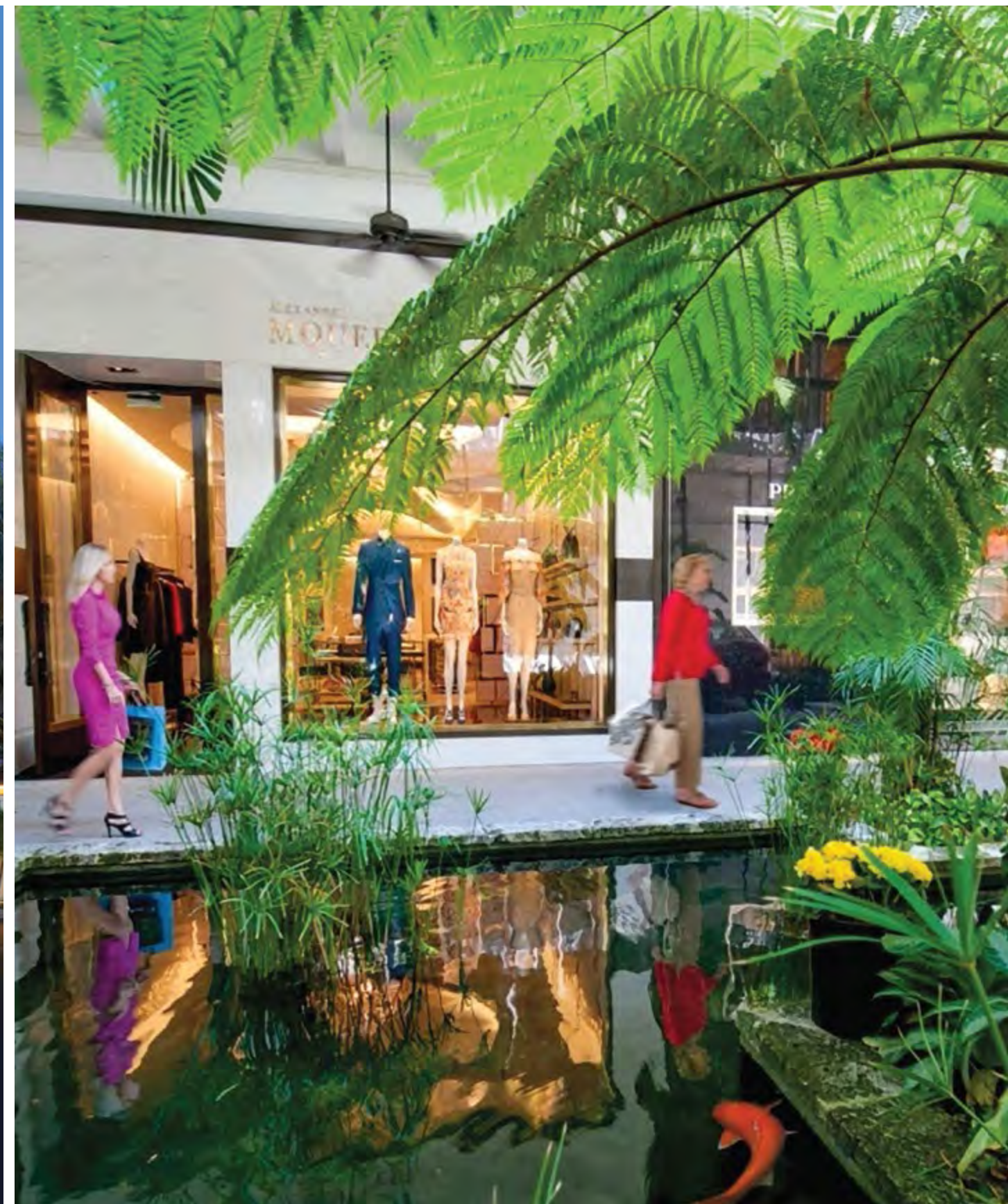
BAL HARBOUR Shops