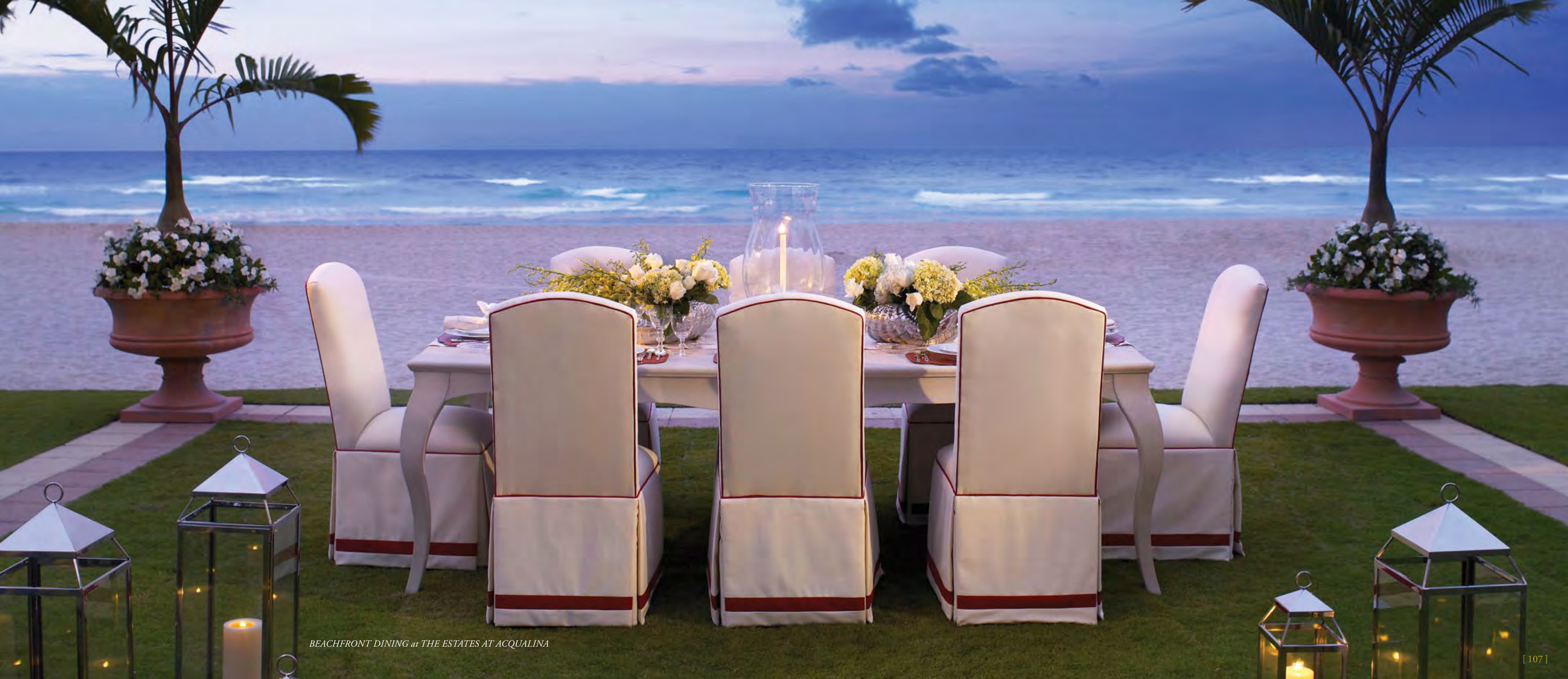
BEACHFRONT DINING at THE ESTATES AT ACQUALINA