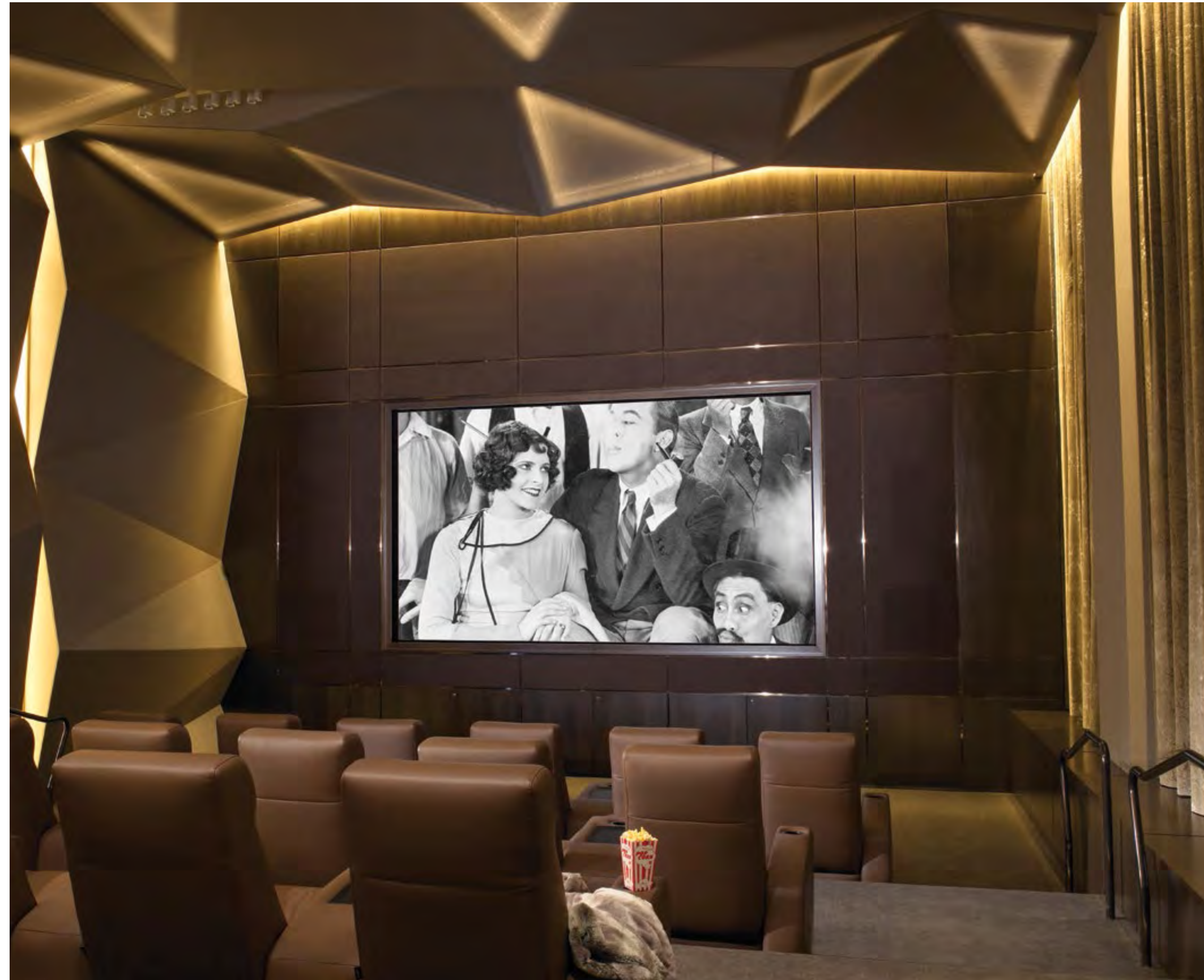
The ON-SITE MOVIE-SCREENING room