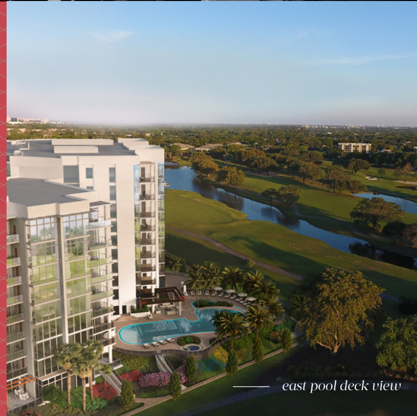
resort style pool & deck