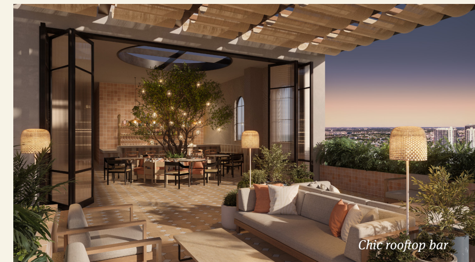
Chic rooftop bar

5% Reservation 15% Contract 10% Groundbreaking 10% Top-off 60% Closing