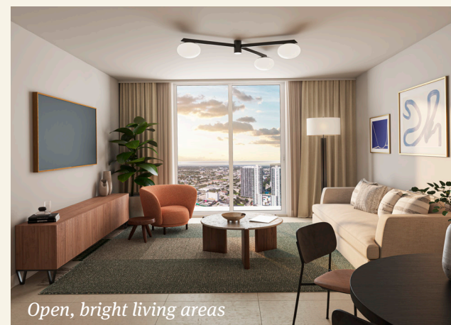
Open, bright living areas