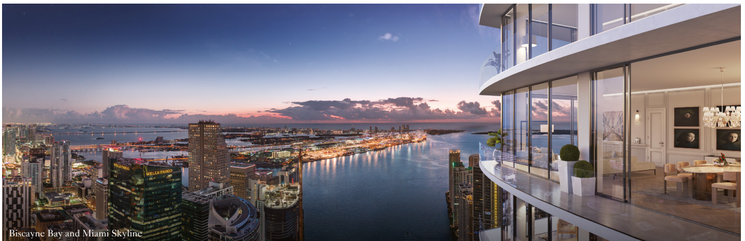
Biscayne Bay and Miami Skyline