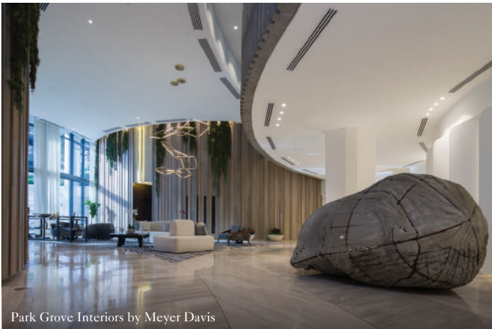
Park Grove Interiors by Meyer Davis