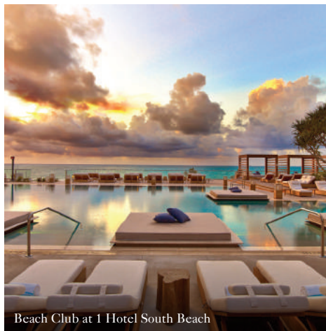
Beach Club at 1 Hotel South Beach

The private marina, planned riverside restaurant and lushly landscaped river promenade invite residents to spend hours and days luxuriating in the infinite energy and organic sparkle of life by the water. Watch the superyachts come and go, take a sunset stroll towards the bay, or head to a number of chic waterside restaurants courtesy of our private water taxi service. Residents can enjoy private membership and exclusive access to the Beach Club at 1 Hotel South Beach, SH Hotels & Resorts sister property. With loungers, beach towel services, cabanas, and seaside snack and beverage services, this waterfront community will cater to leisurely hours under the sun. Take a break from the hustle and bustle of the city and unwind with a cool drink in hand and the sand between your toes.