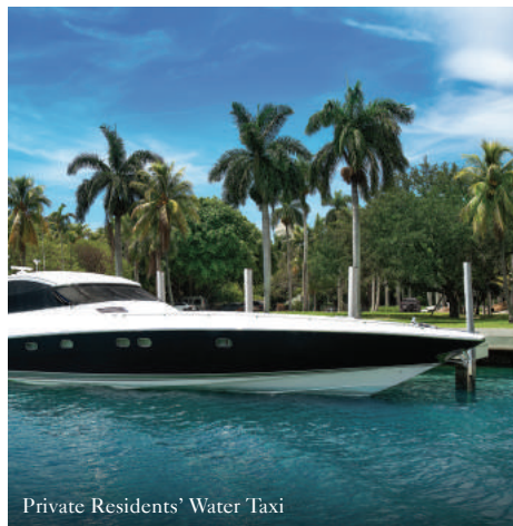
Private Residents' Water Taxi