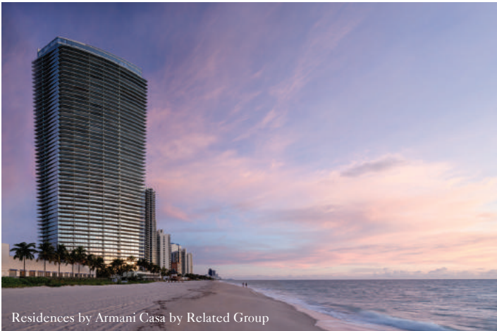
Residences by Armani Casa by Related Group

Renowned Swiss landscape architect Enzo Enea of Zurich-based Enea Garden, is one of the leading landscape architects in the world. A hallmark of Enzo Enea's work is the fusion of indoor and outdoor spaces, the creative intertwining of the soul of the residence with its surroundings.