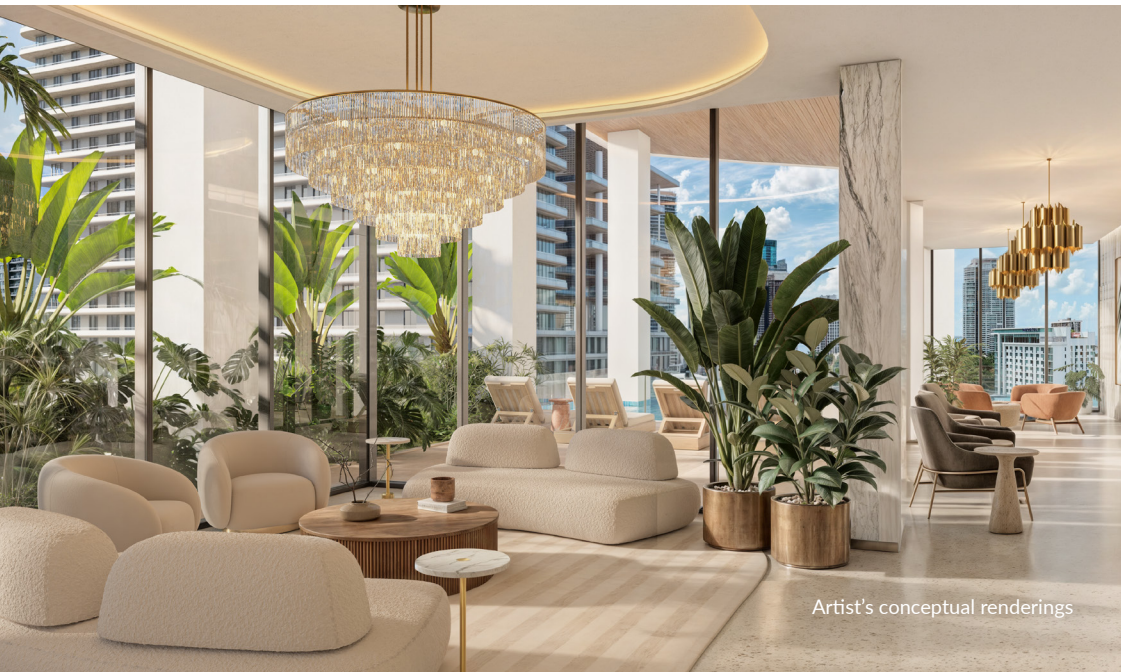
Artist's conceptual renderings