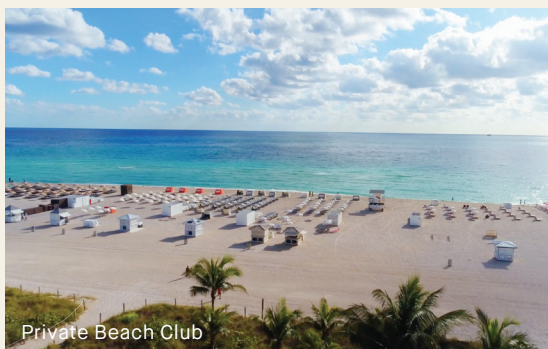
Private Beach Club

Restaurants, cafés, bars, parks, and more can be found by bike or stroll through the palm tree-lined streets.