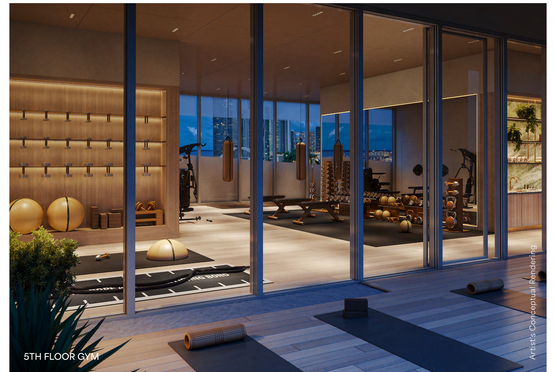
5TH FLOOR GYM