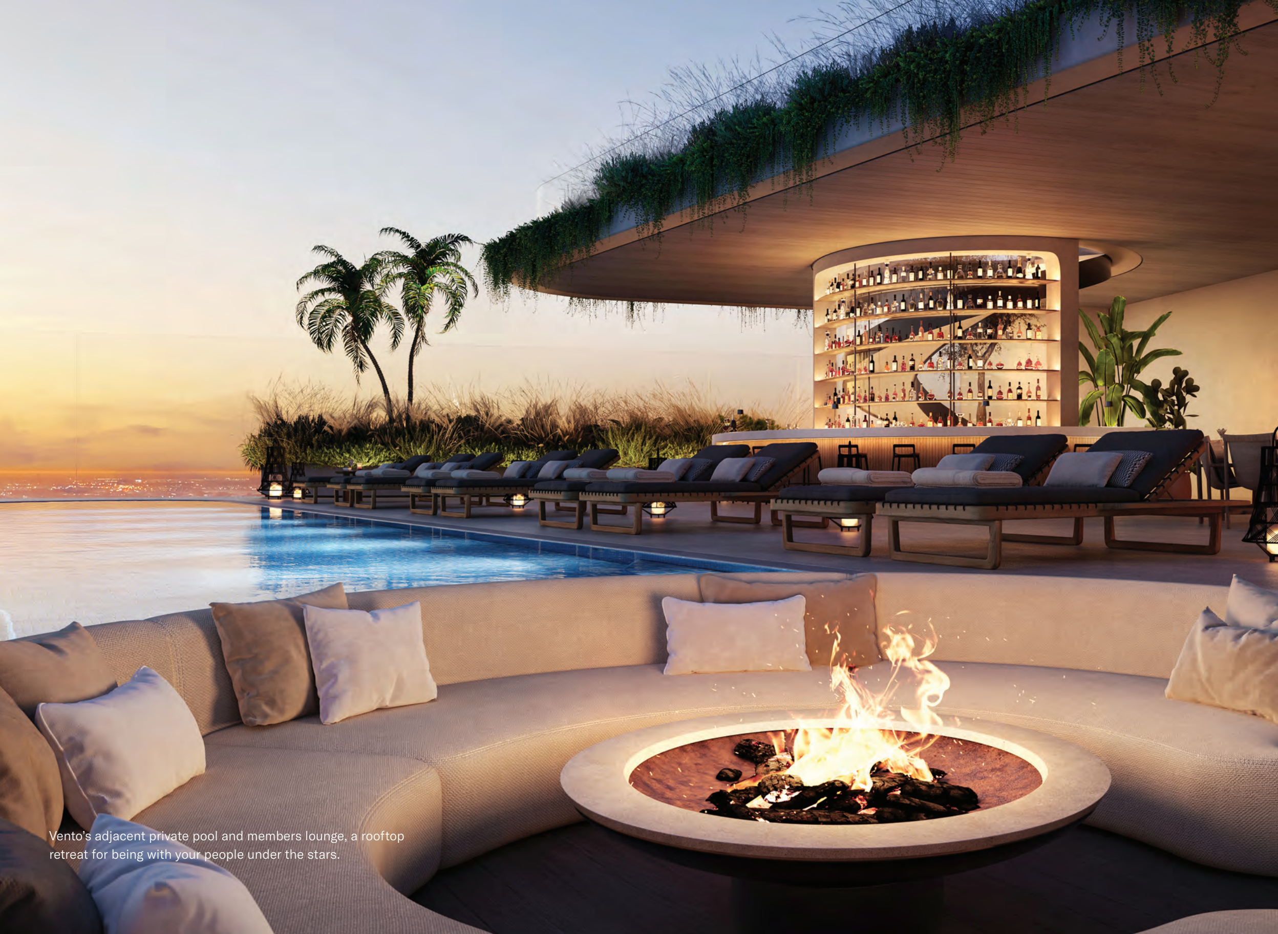
Vento's adjacent private pool and members lounge, a rooftop retreat for being with your people under the stars.