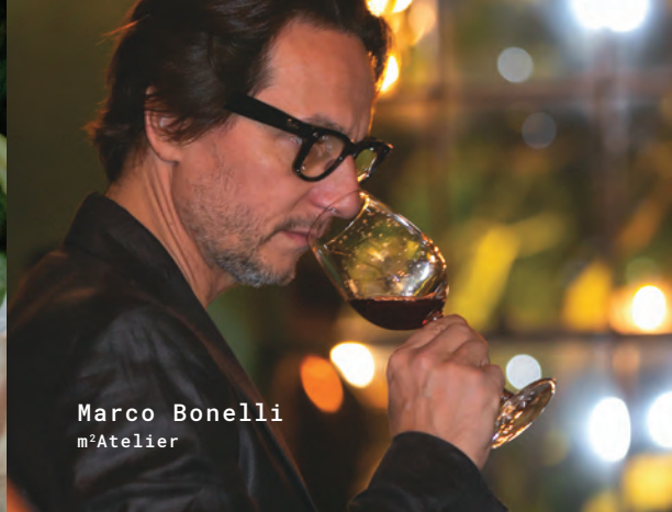
Marco Bonelli m²Atelier

The soul of a place is in the nature that surrounds it — and the people who share it