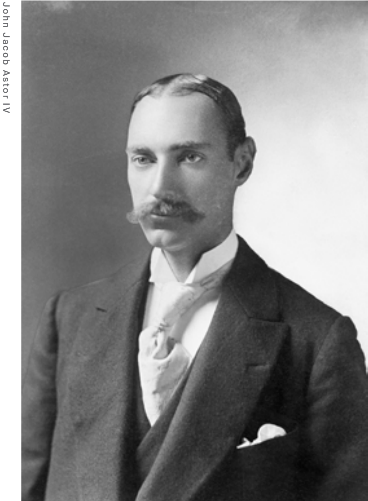
St. Regis, A Name Synonymous with Superlative Experiences.

With roots around the globe, from the first hotel opening in Manhattan, the St. Regis brand is renowned for its tradition of innovation and impeccable service since 1904.