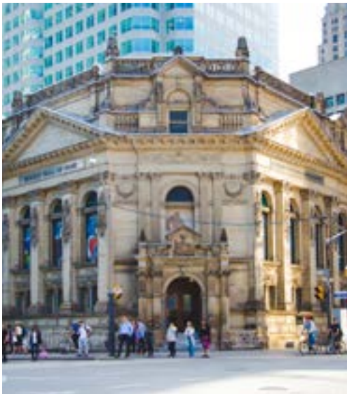
CN TOWER • ROGERS CENTRE • BCE PLACE • DUNDAS SQUARE • AIR CANADA CENTRE • CITY HALL GOODERHAM BUILDING • THE CATHEDRAL CHURCH OF ST. JAMES • HOCKEY HALL OF FAME