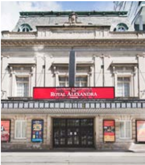
ROYAL ONTARIO MUSEUM • ART GALLERY OF ONTARIO • GARDINER MUSEUM • MASSEY HALL • FOUR SEASONS CENTRE ED MIRVISH THEATRE • TIFF BELL LIGHTBOX • SONY CENTRE FOR THE PERFORMING ARTS • ROYAL ALEXANDRA THEATRE