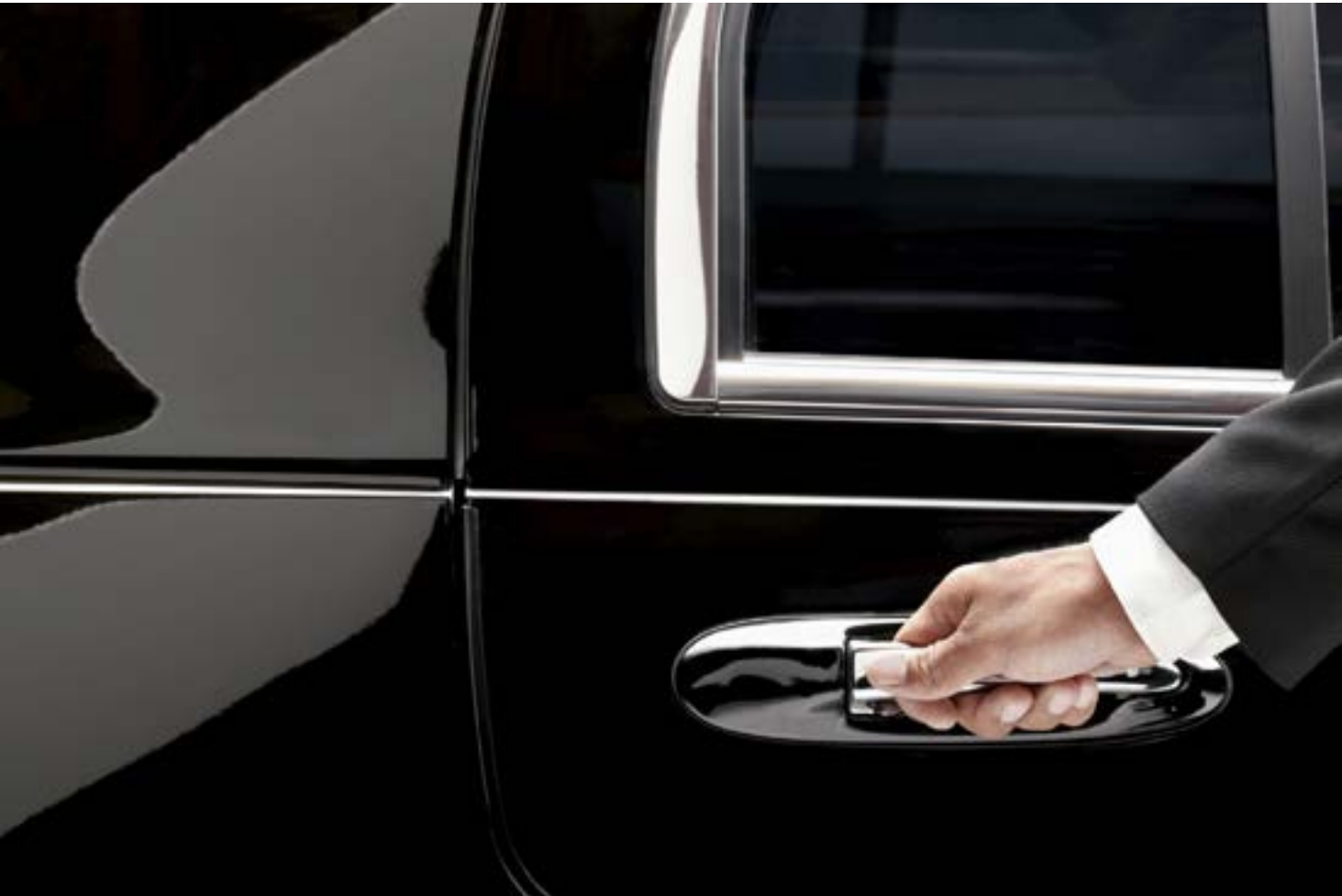
Dedicated Butler Service

From discreet Butler Service to captivating family traditions, the St. Regis Residences celebrate a modern vanguard. This is a new level of luxury, the first of its kind in Toronto. Introducing a new chapter, a forward-thinking residential property that will usher in the new golden age of luxury in Toronto.