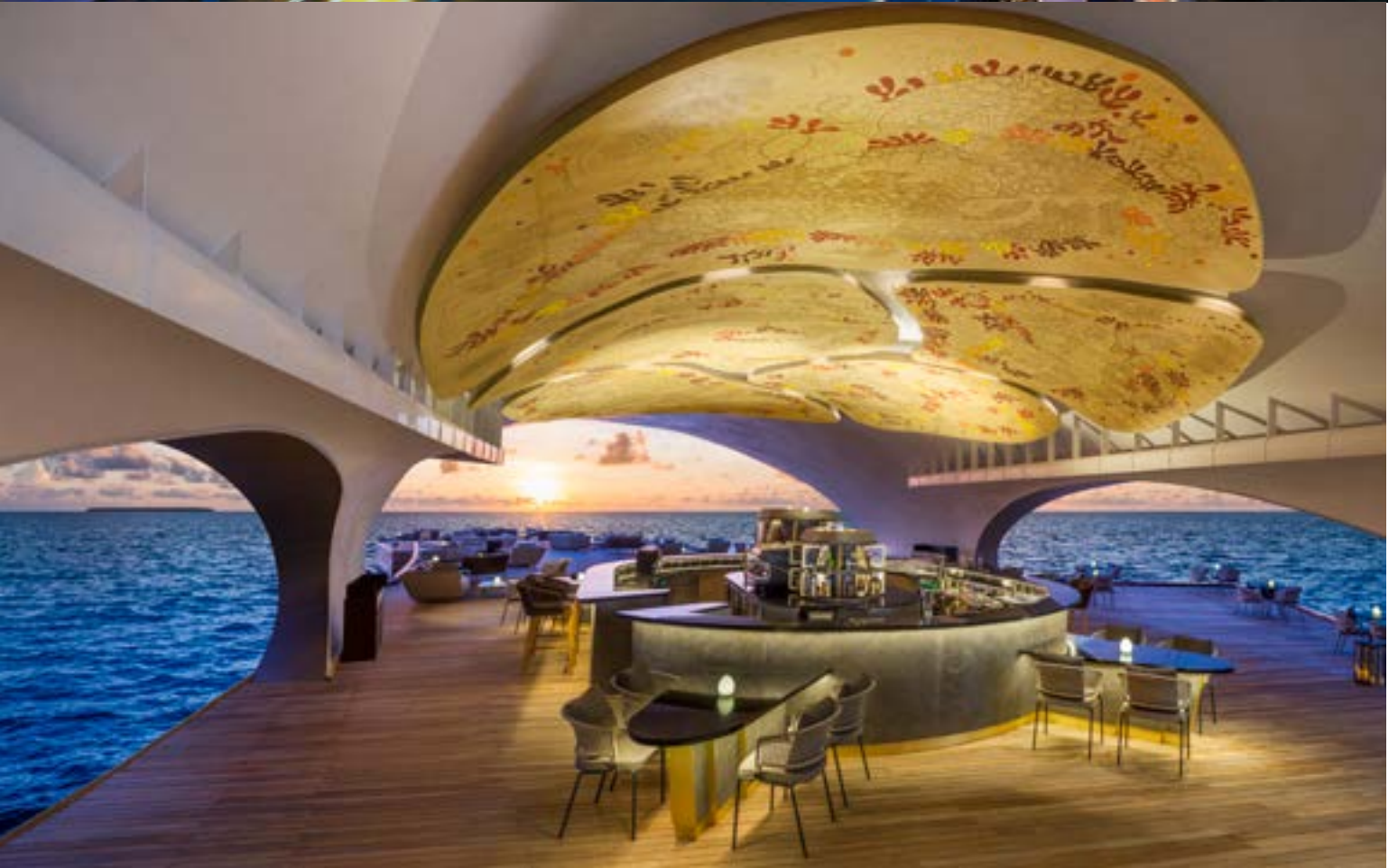
THE ST. REGIS SHENZHEN • THE ST. REGIS BORA BORA