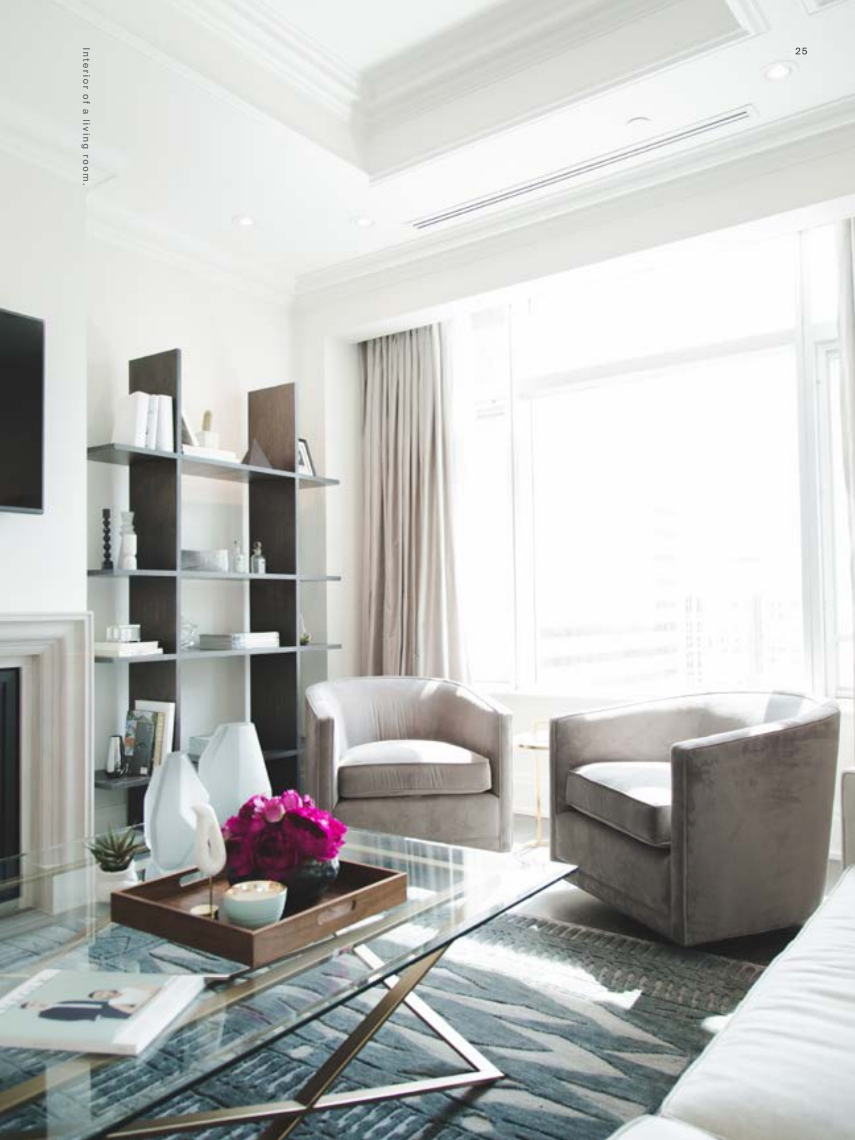
Interior of a living room.