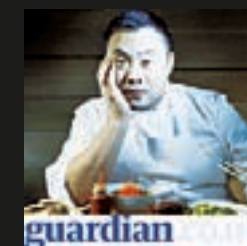
THE GUARDIAN NOVEMBER 2010