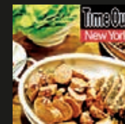
TIME OUT NEW YORK OCTOBER 2010