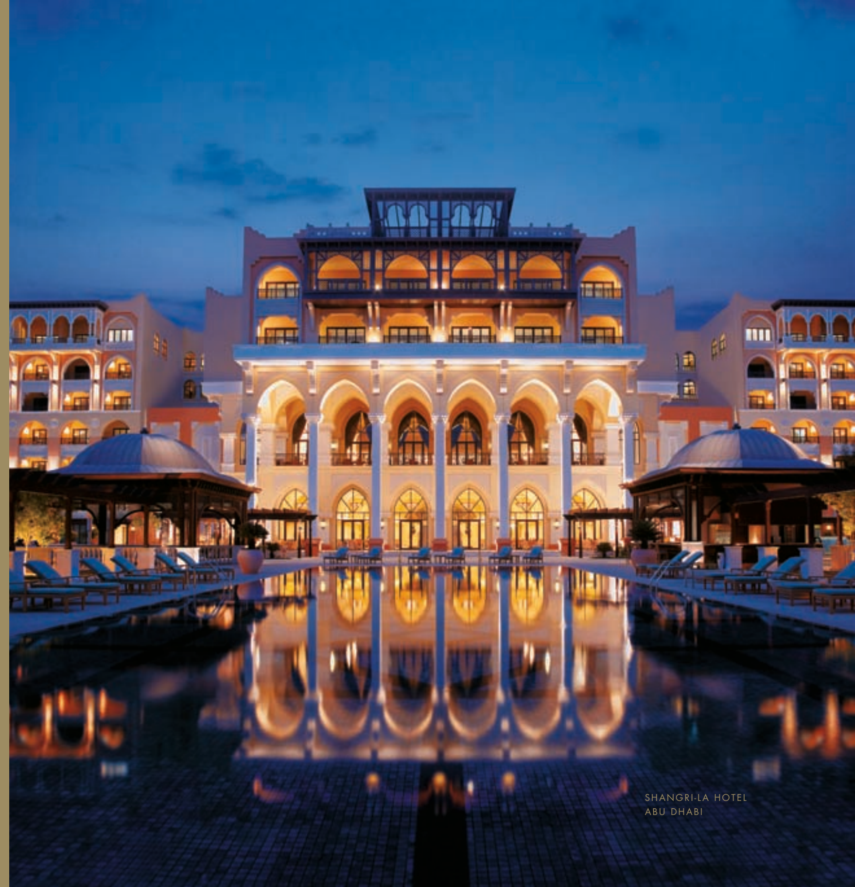
SHANGRI-LA HOTEL ABU DHABI

Shangri-La Hotels and Resorts constitutes signature properties throughout the world. These five-star deluxe establishments feature extensive luxury facilities and services. Shangri-La Hotels are located in Australia, Canada, Mainland China, Fiji, Hong Kong, Indonesia, India, Malaysia, the Philippines, Singapore, the Sultanate of Oman, Thailand, Taiwan, and the United Arab Emirates. Presently properties under development in China, France, India, Japan, Macau, Malaysia, the Maldives, the Philippines, Qatar, the Seychelles, Thailand, the United Emirates, United Kingdom, United States. A select few of these, such as our premier properties in Vancouver and Toronto, offer luxury residential condominiums and premium estates.