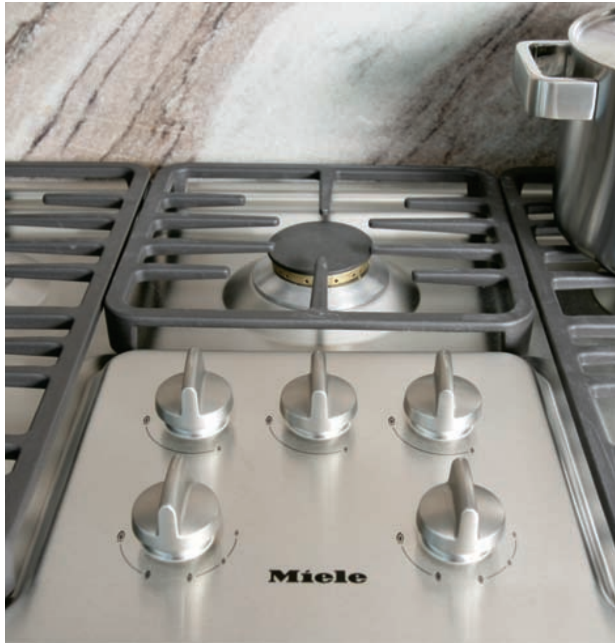
LUXURIOUS KITCHEN & APPLIANCE PACKAGE: BOFFI KITCHENS, MIELE GAS COOKTOP, STAINLESS STEEL FOUR-SPEED HOOD FAN, "INCOGNITO" DISHWASHER, SUB-ZERO REFRIGERATOR.