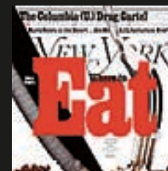
NEW YORK MAGAZINE JANUARY 2011