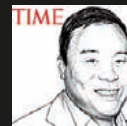
TIME MAGAZINE DECEMBER 2010