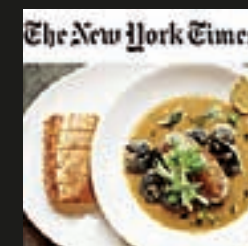
NEW YORK TIMES DECEMBER 2010