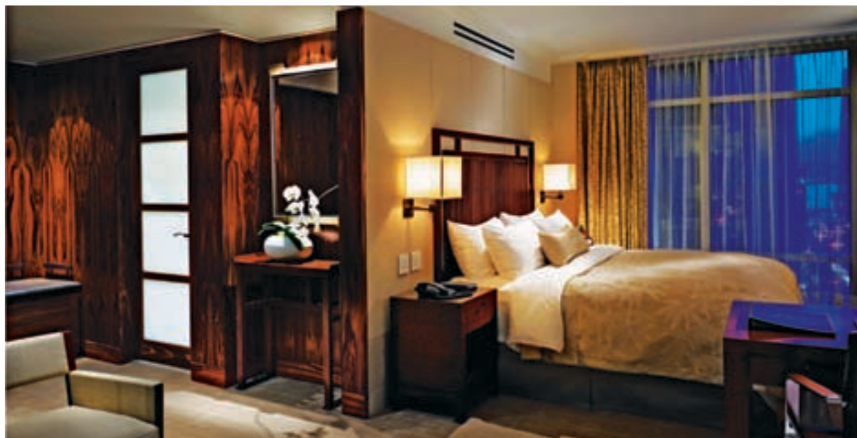
SHANGRI-LA HOTEL, VANCOUVER: GRAND LOBBY, MARKET BY JEAN-GEORGE RESTAURANT, LUXURY GUESTROOM; SHANGRI-LA HOTEL, PARIS (RIGHT)