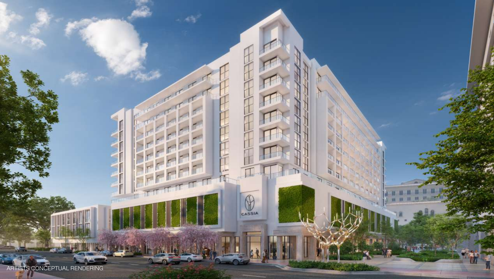
ARTISTS CONCEPTUAL RENDERING