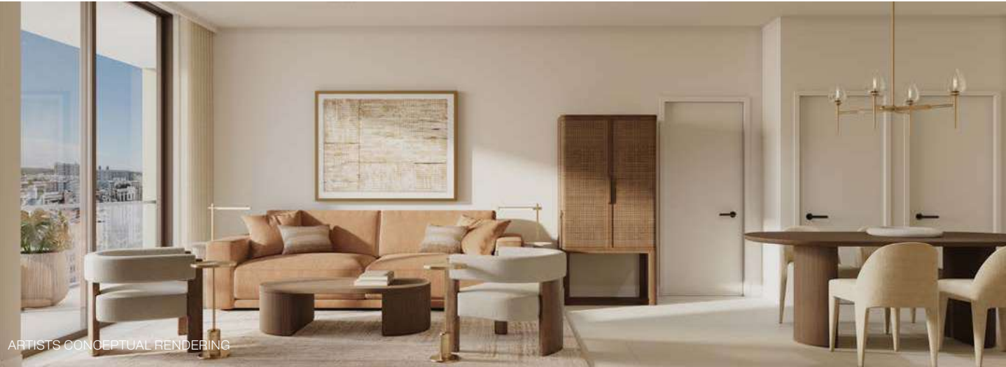
ARTISTS CONCEPTUAL RENDERING