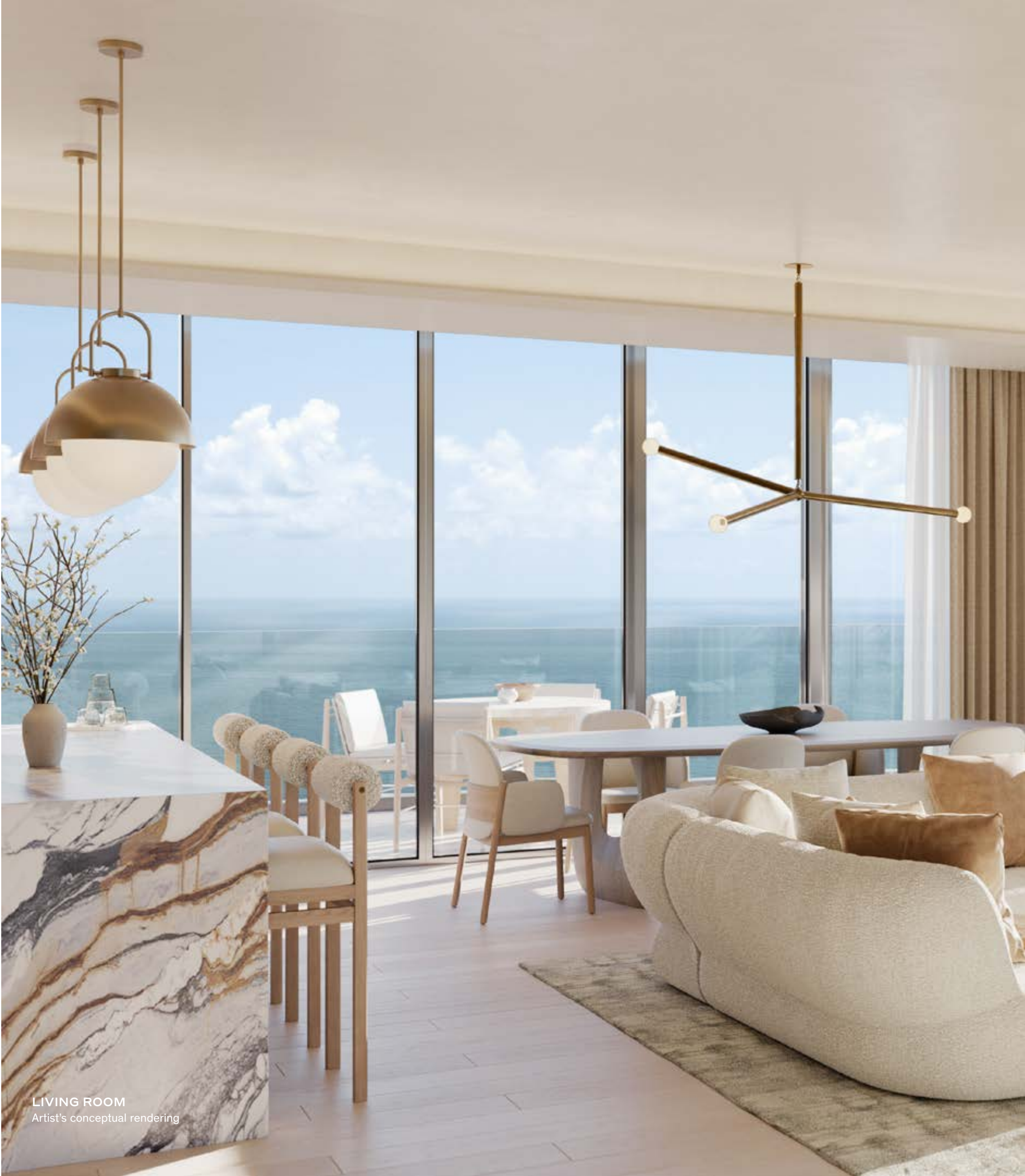
LIVING ROOM Artist's conceptual rendering

Interiors by Meyer Davis are graced with incredible water views and defined by discreet luxury, iconic design, clean, fluent lines, and striking textures—lending a carefree, refined sensibility to each and every space.