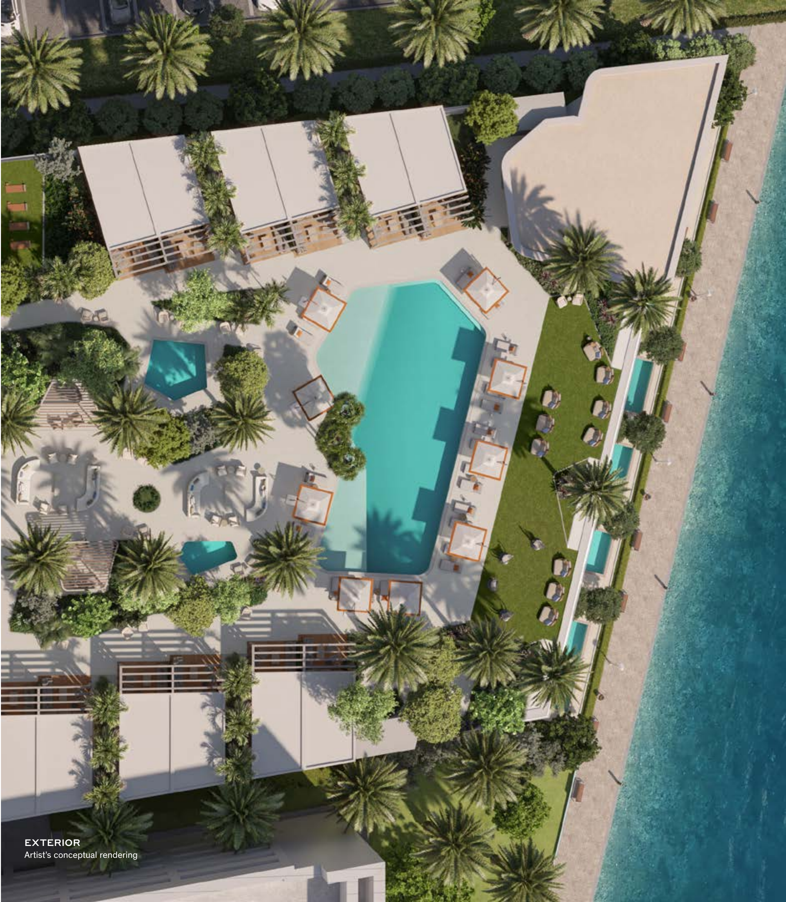
EXTERIOR Artist's conceptual rendering