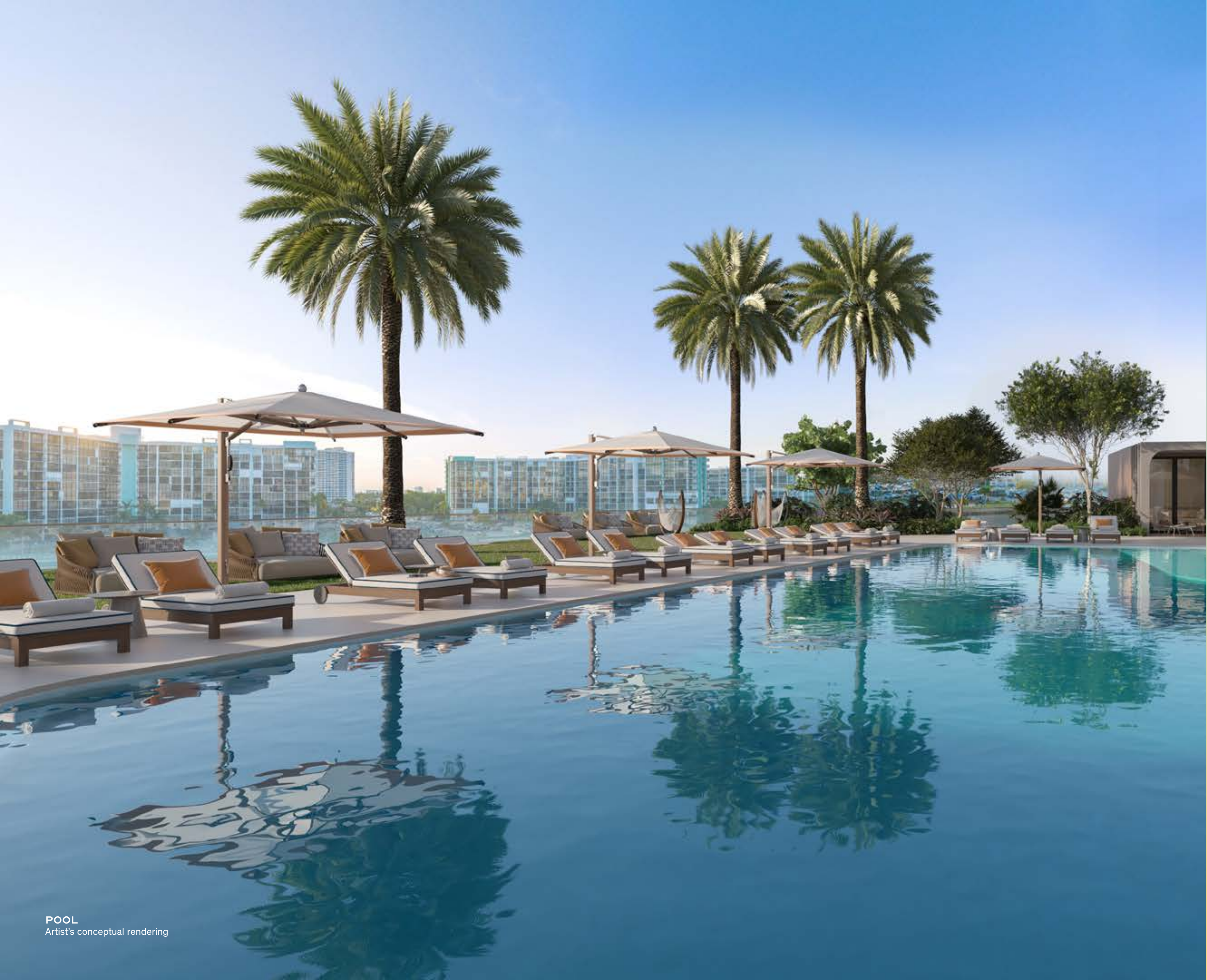
POOL Artist's conceptual rendering