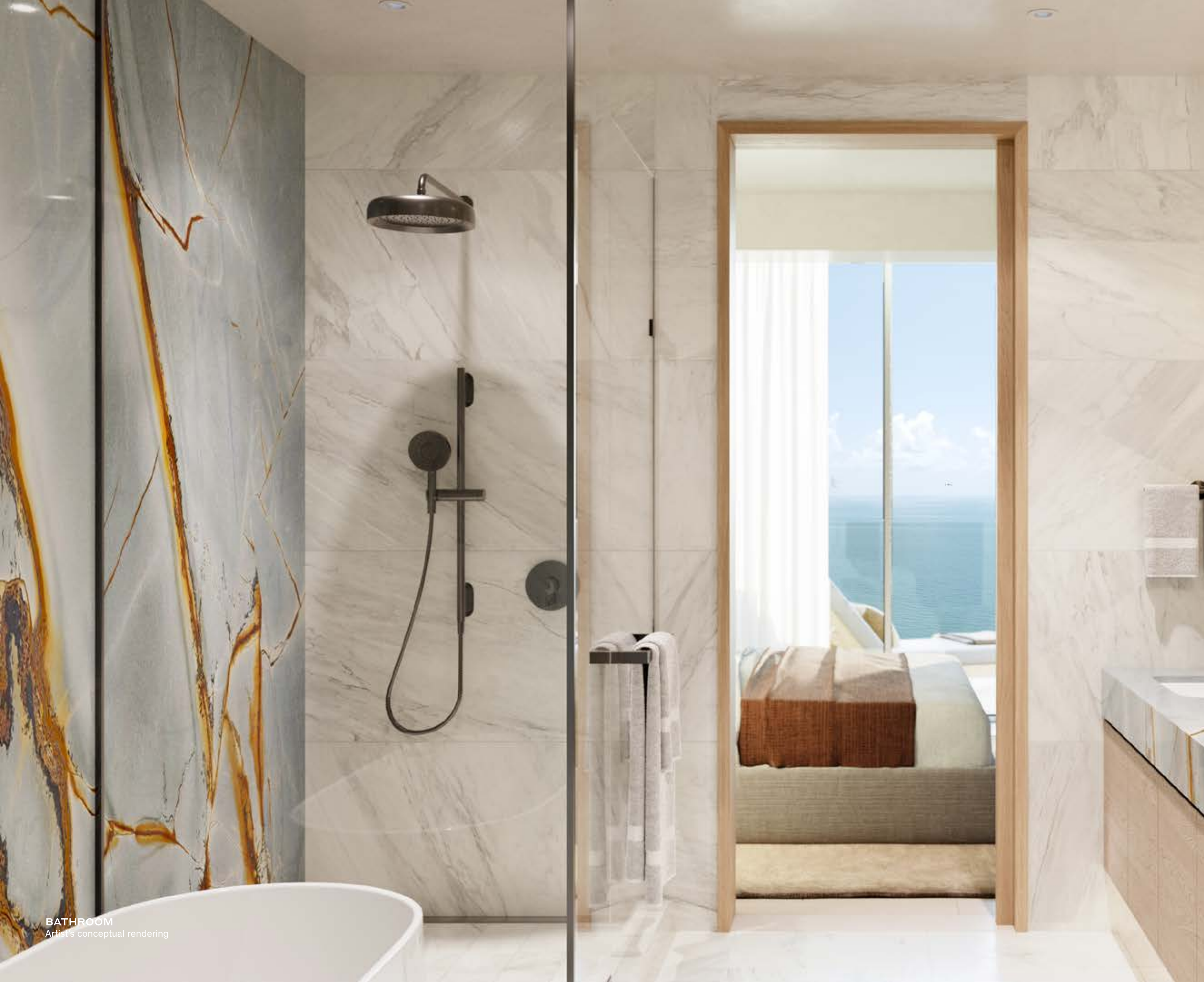
BATHROOM Artist's conceptual rendering