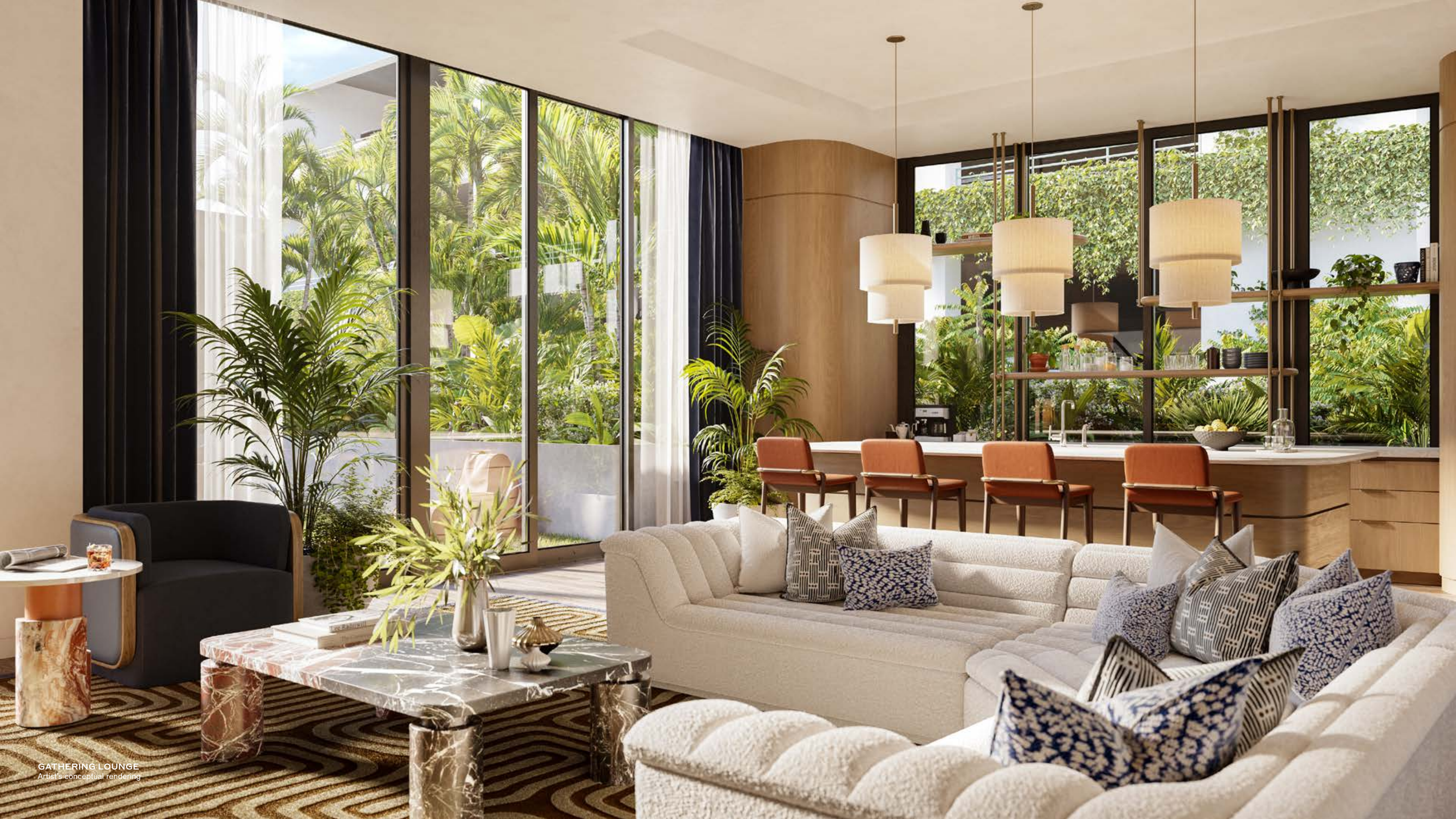
GATHERING LOUNGE Artist's conceptual rendering