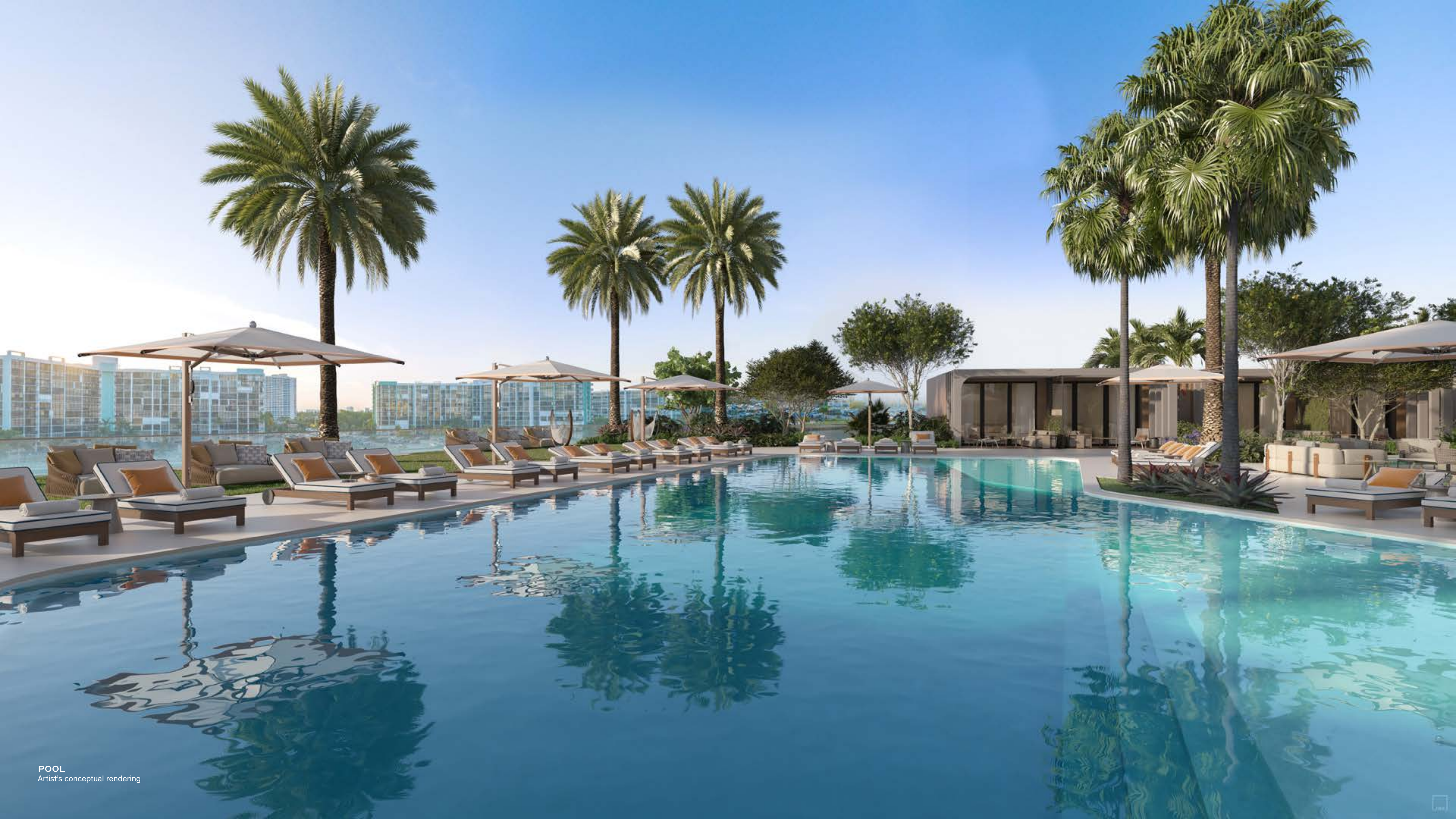
POOL Artist's conceptual rendering