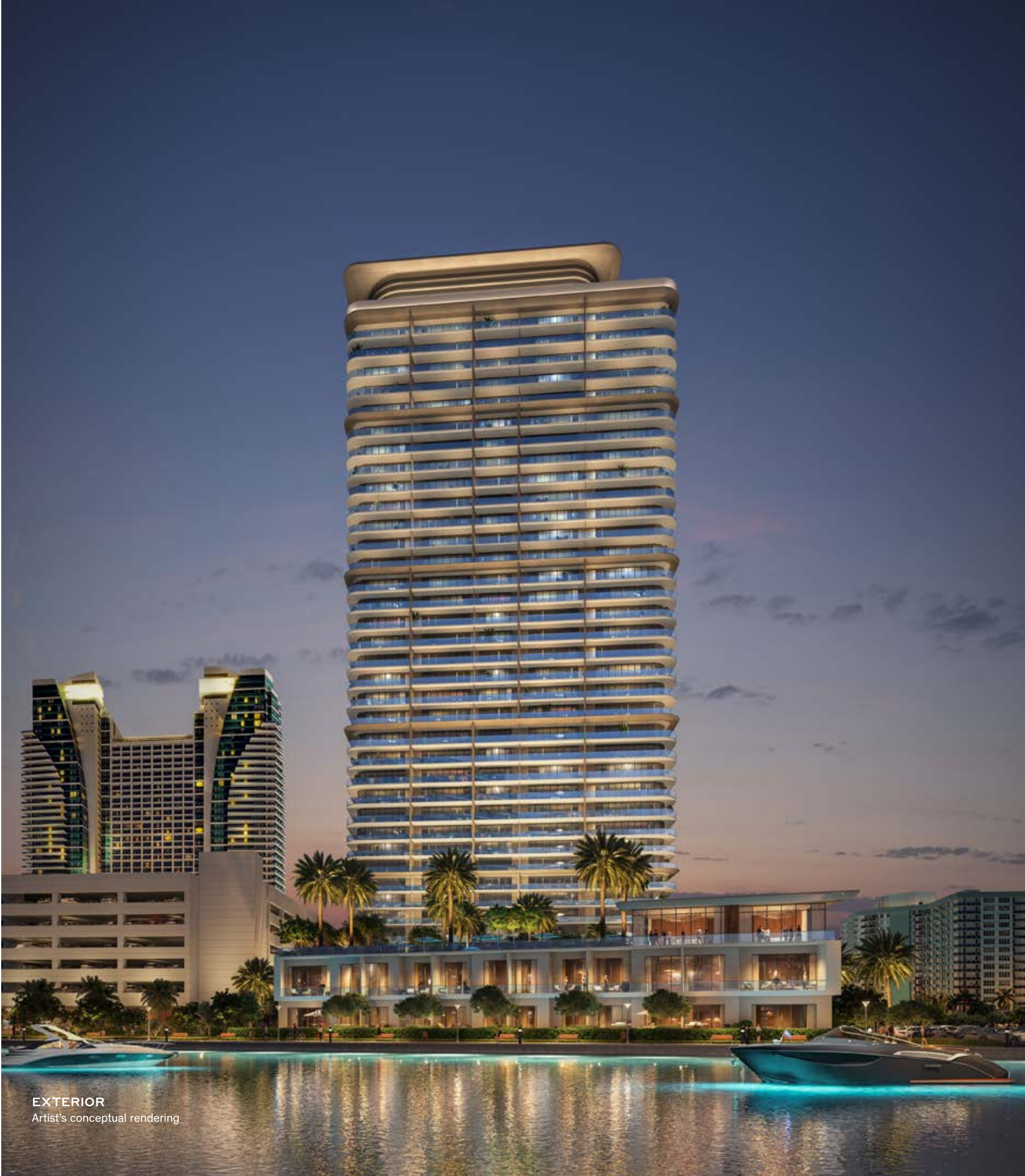
EXTERIOR Artist's conceptual rendering