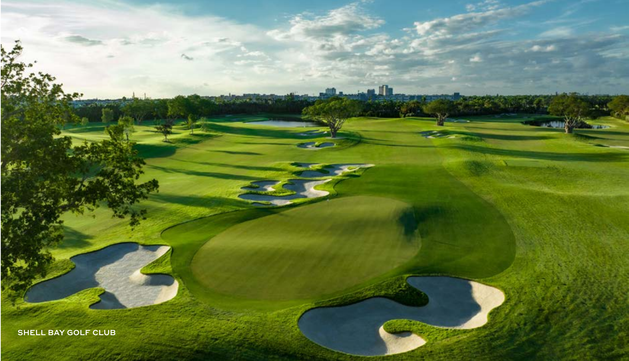
SHELL BAY GOLF CLUB