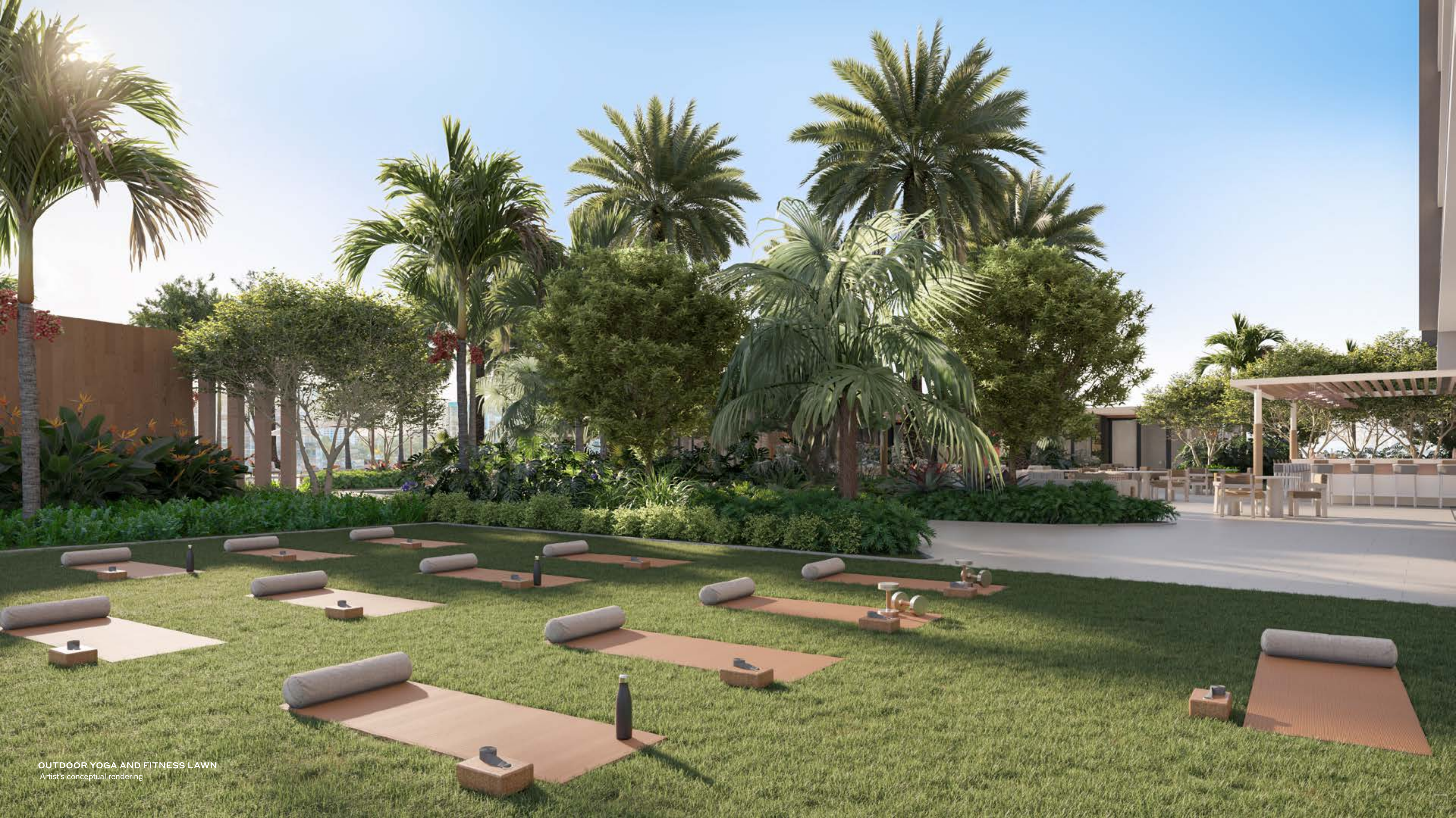
OUTDOOR YOGA AND FITNESS LAWN Artist's conceptual rendering