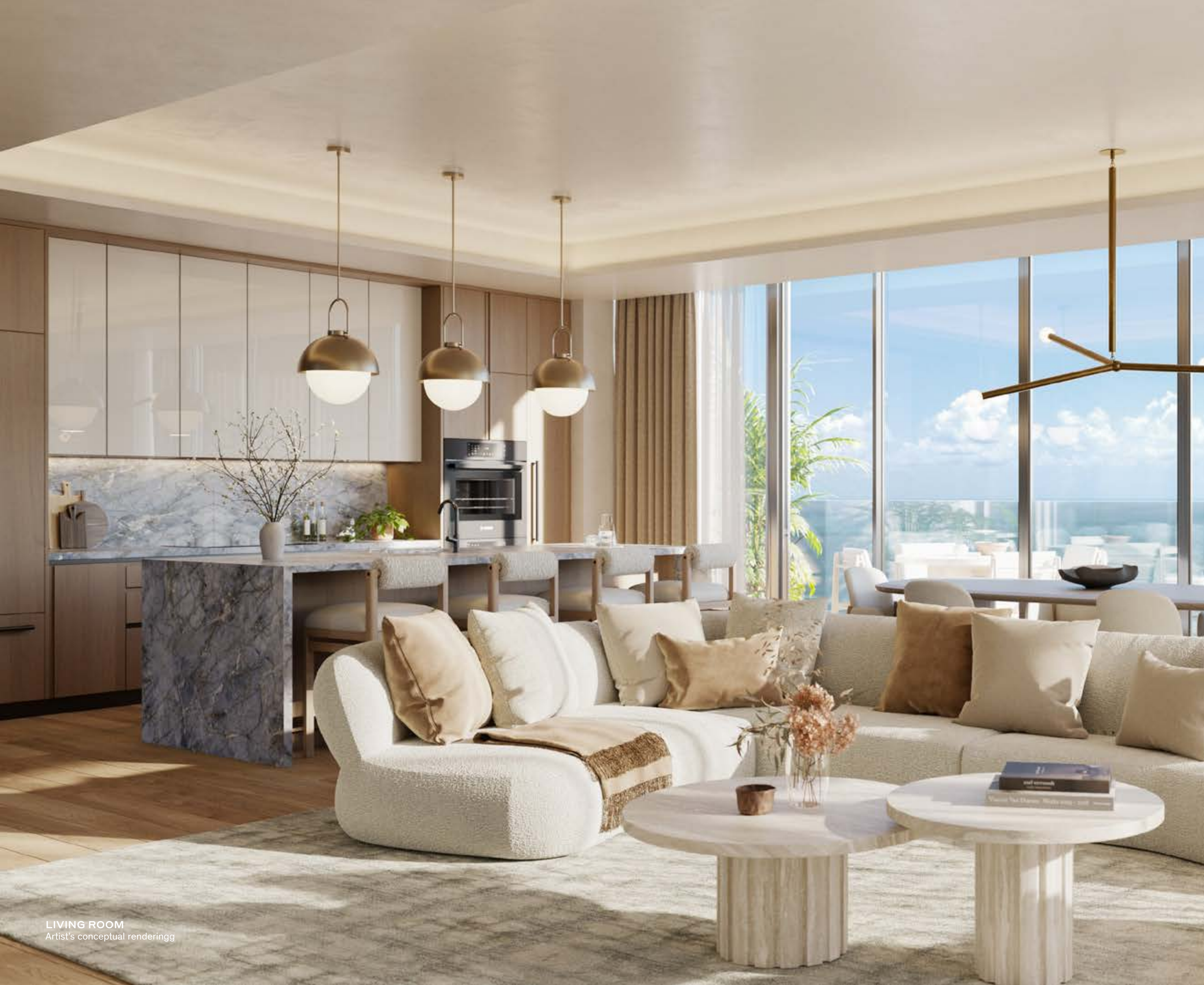
LIVING ROOM Artist's conceptual renderingg