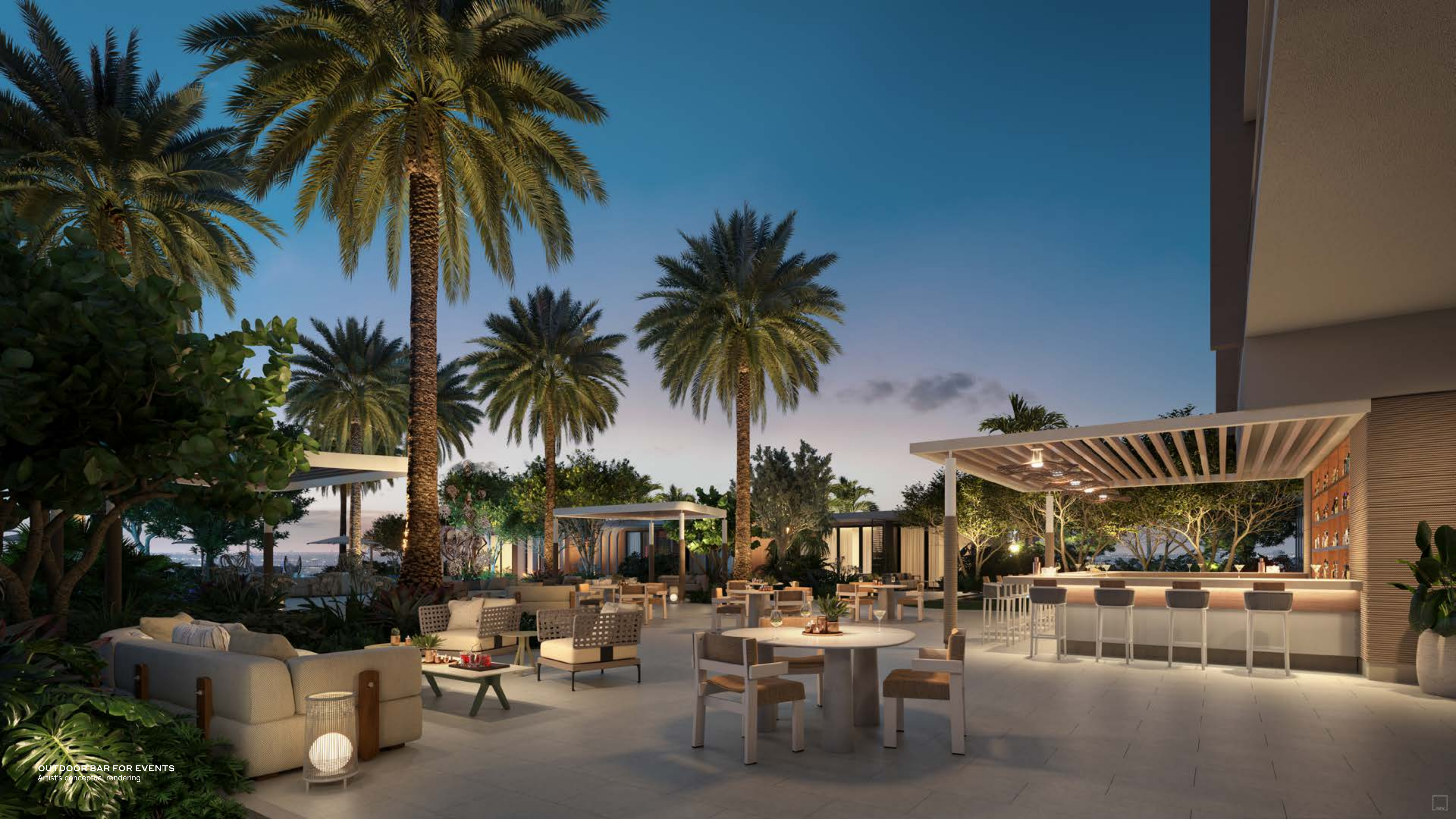
OUTDOOR BAR FOR EVENTS Artist's conceptual rendering