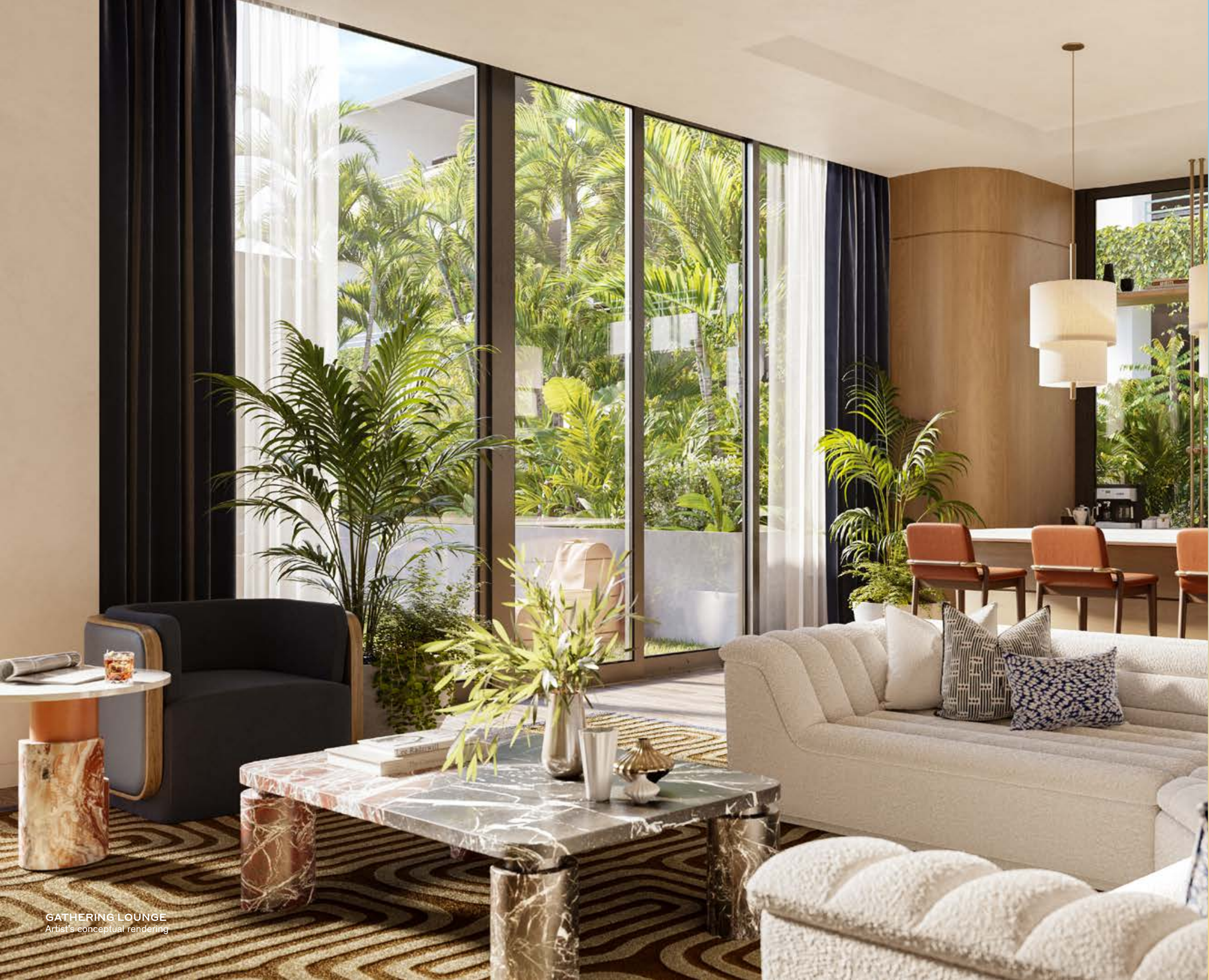
GATHERING LOUNGE Artist's conceptual rendering