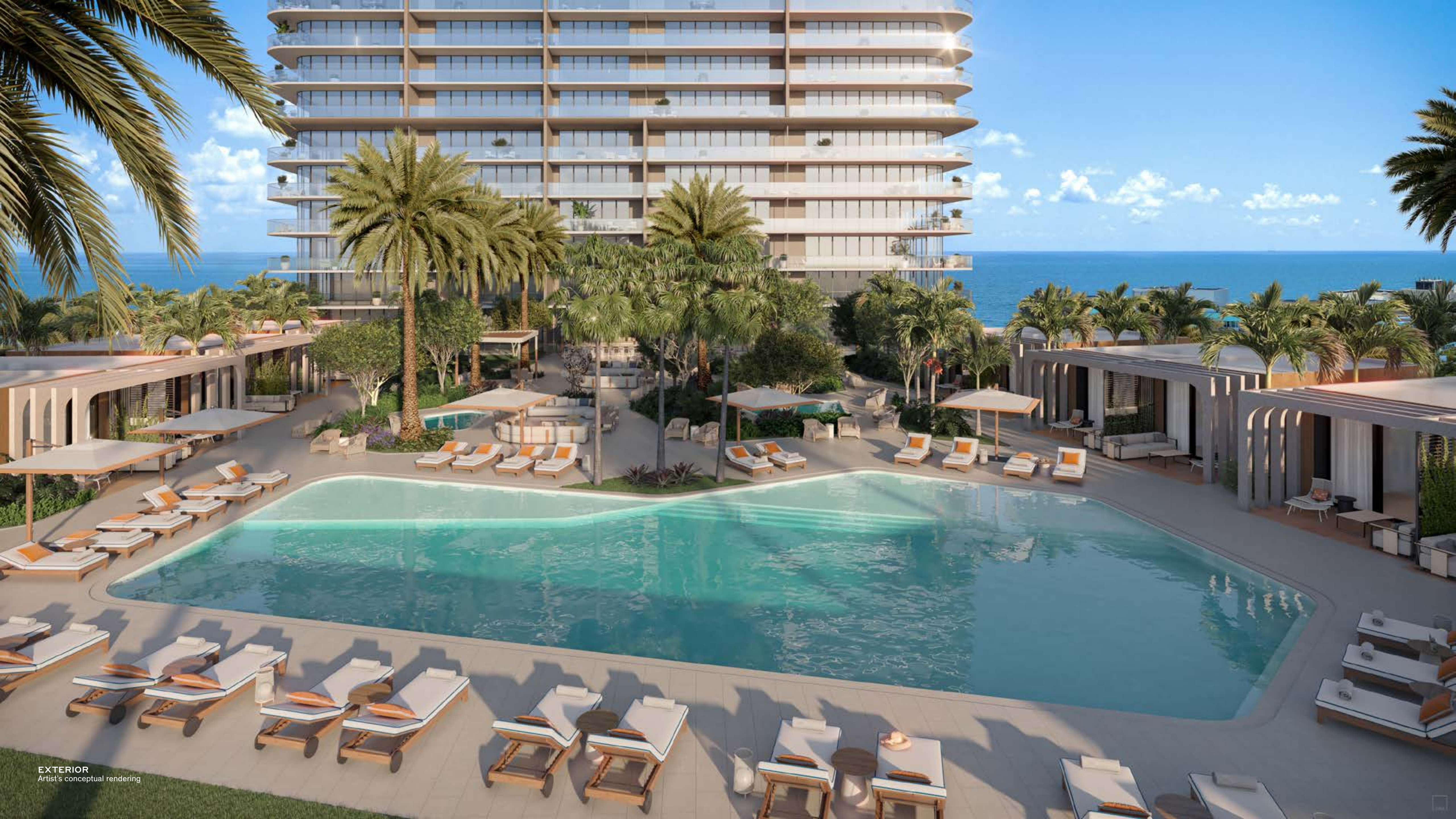
EXTERIOR Artist's conceptual rendering