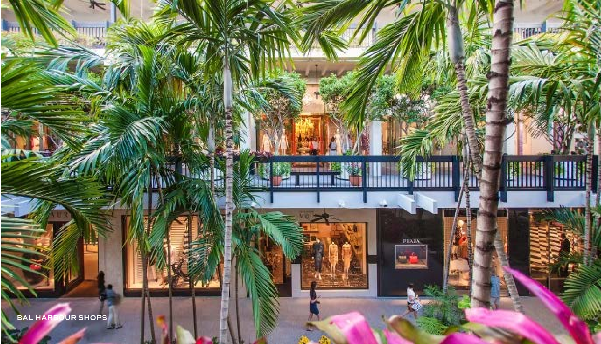
BAL HARBOUR SHOPS

One-of-a-kind waterpark and outdoor experience, located at the JW Marriott Turnberry Resort & Spa.