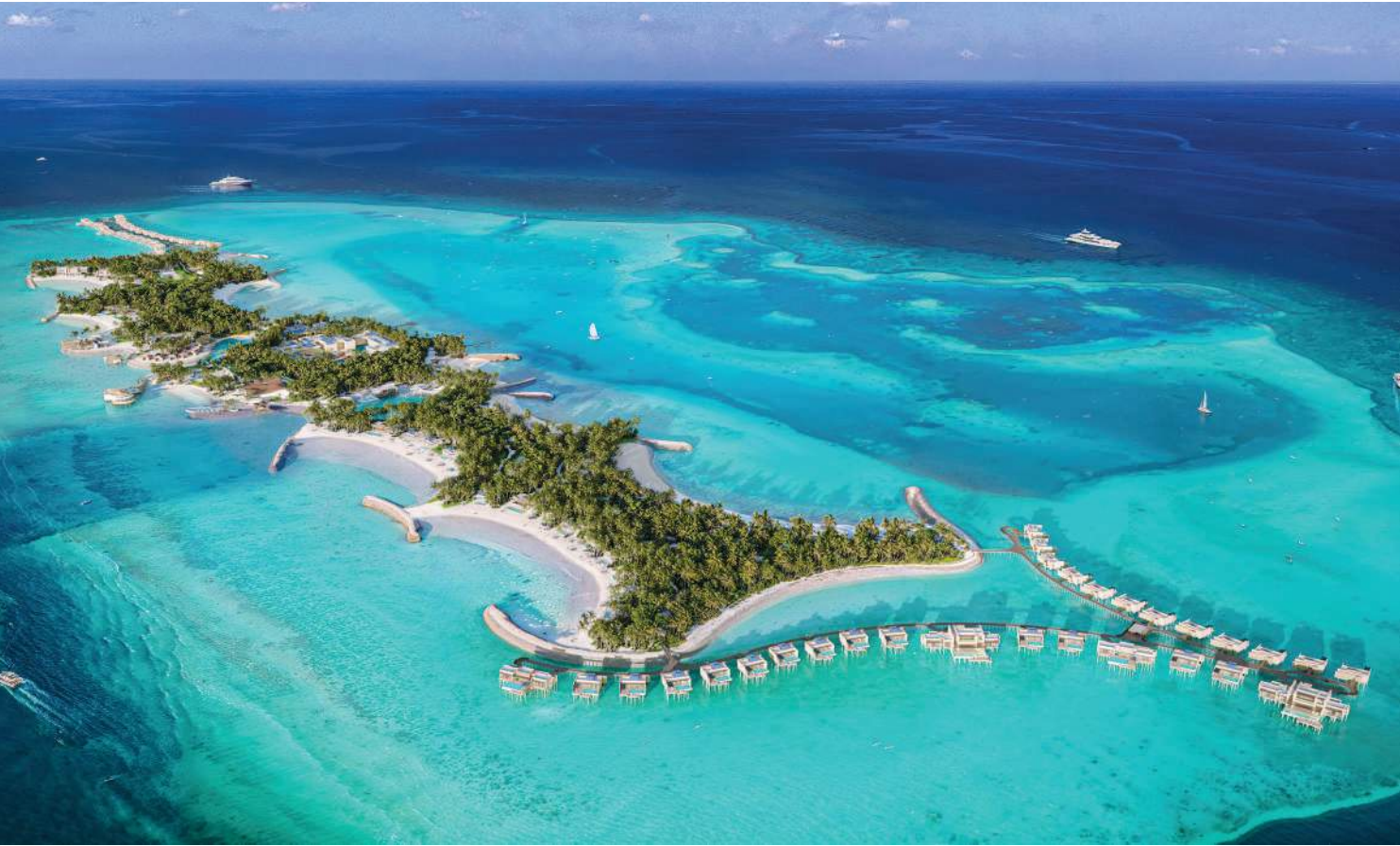
Mandarin Oriental, Maldives

Zaha Hadid Architects (ZHA) redefined architecture for the 21st century with a repertoire of projects that have captured imaginations across the globe. Creating buildings uniquely tailored to the communities they serve; ZHA has been awarded the highest honours from professional and academic institutions worldwide. Founded by Zaha Hadid, ZHA is one of the world’s most consistently inventive architectural studios—and has been for almost 50 years. ZHA’s architecture meets the aspirations of a new generation.