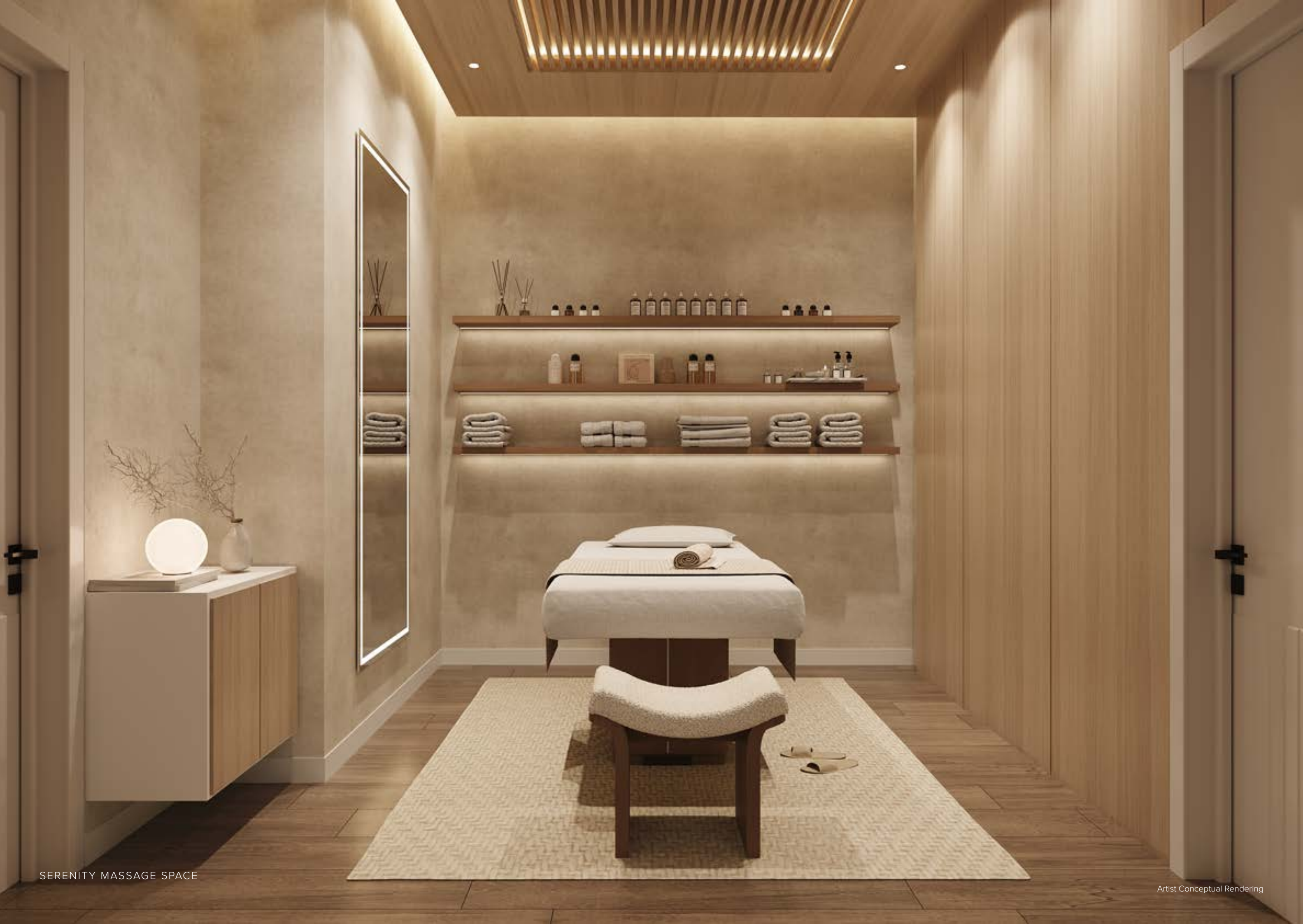
SERENITY MASSAGE SPACE