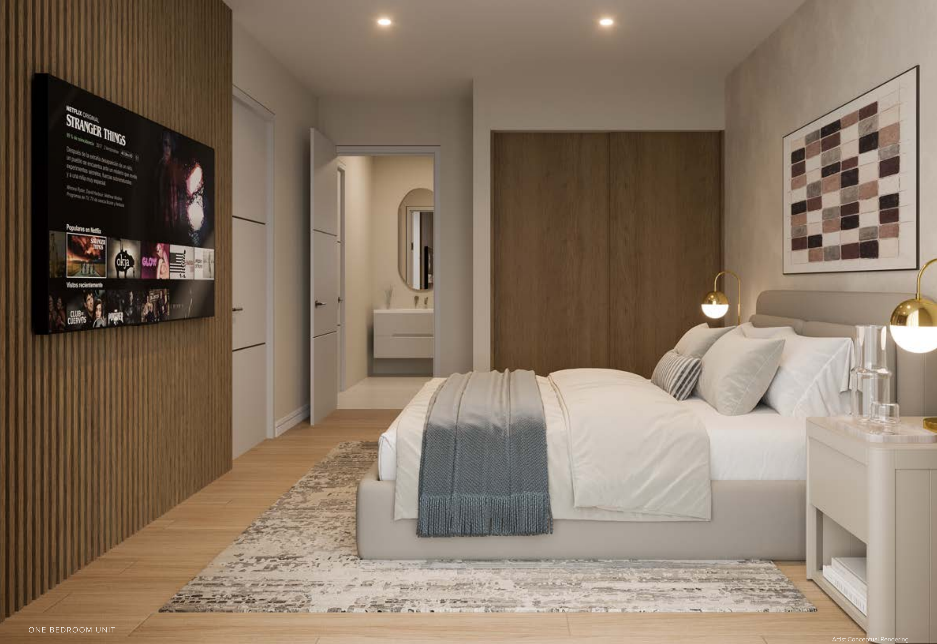
ONE BEDROOM UNIT