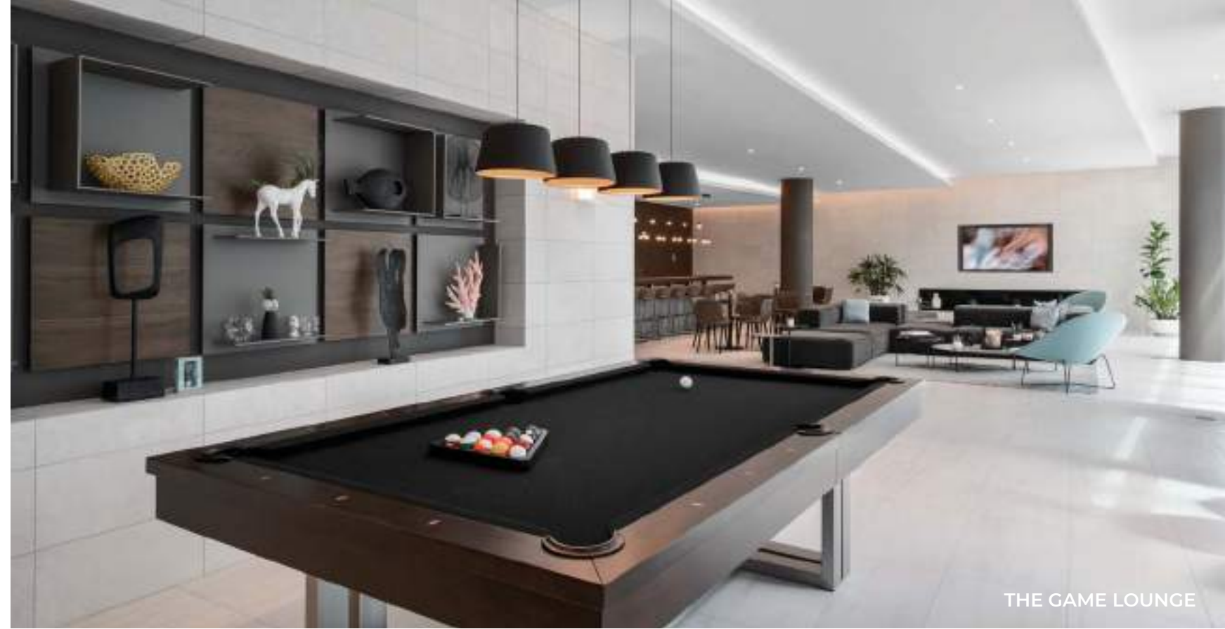
THE GAME LOUNGE