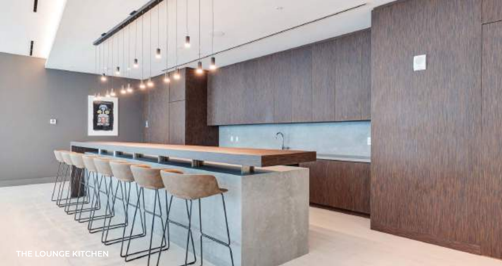
THE LOUNGE KITCHEN