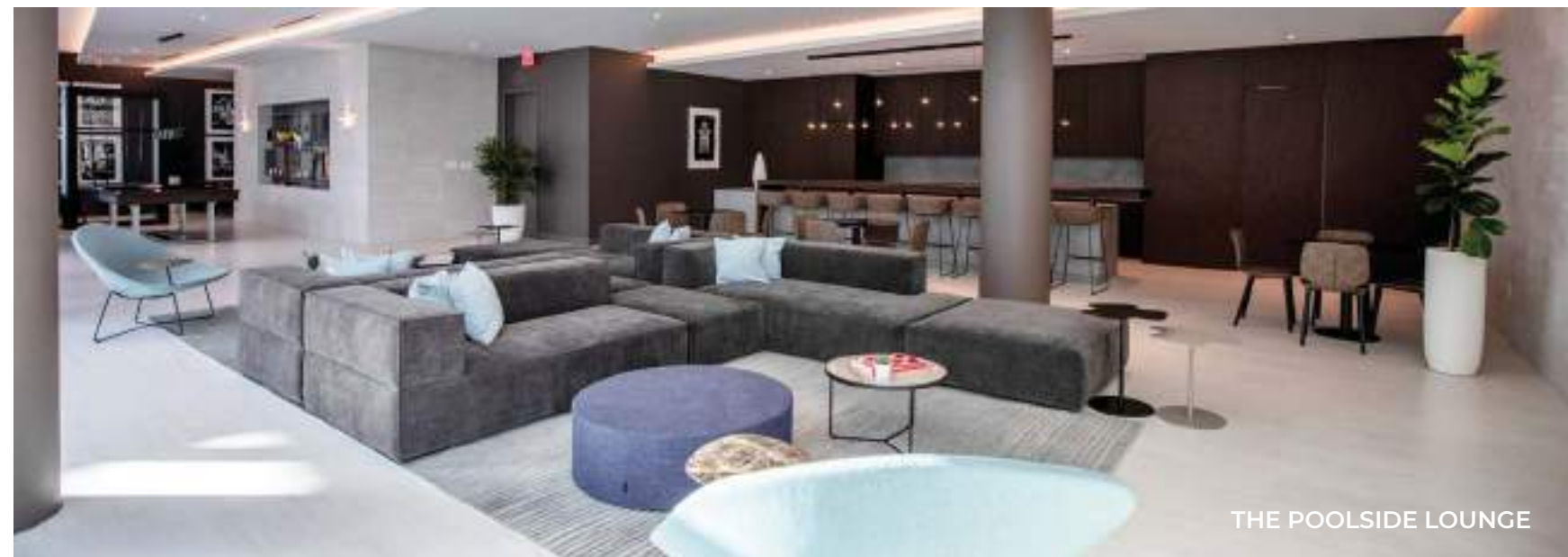
THE POOLSIDE LOUNGE