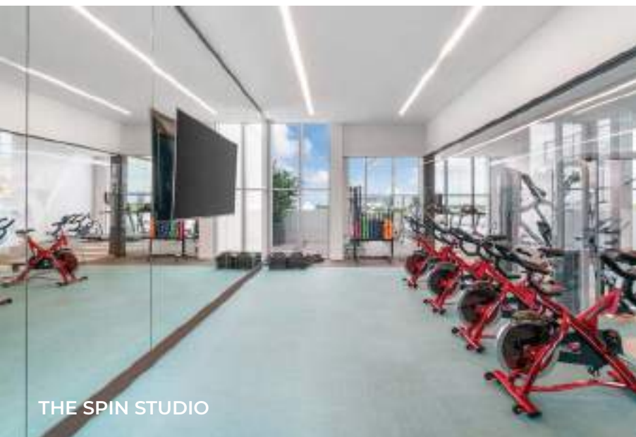
THE SPIN STUDIO