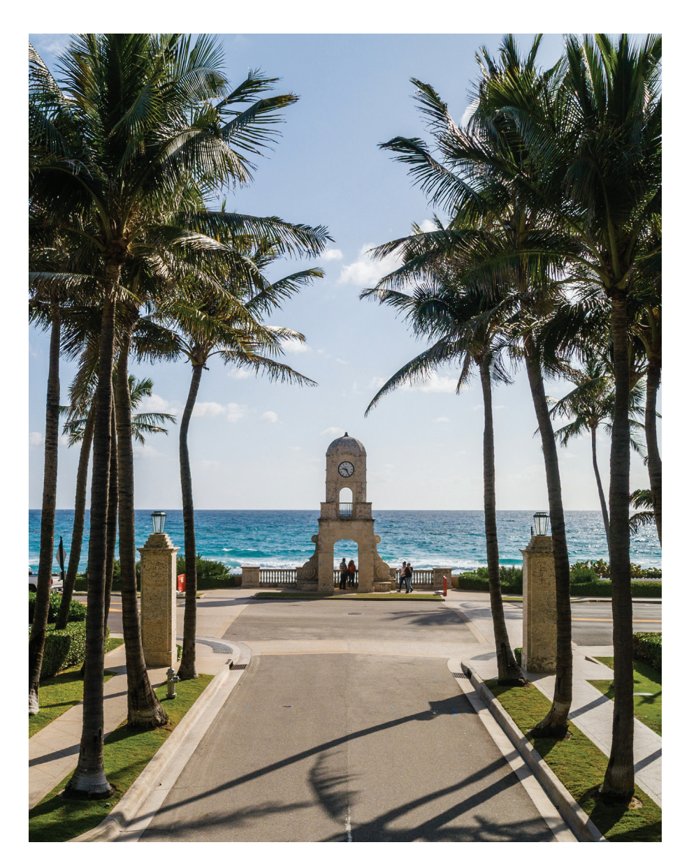
The Ritz-Carlton life: an oasis of luxury, a revered destination, and a world of possibilities at your service.

Set in the heart of West Palm Beach, overlooking the Intracoastal and Palm Beach Island, a refined destination of MICHELIN-starred cuisine, dynamic performing arts, exclusive galleries, and iconic boutiques awaits.