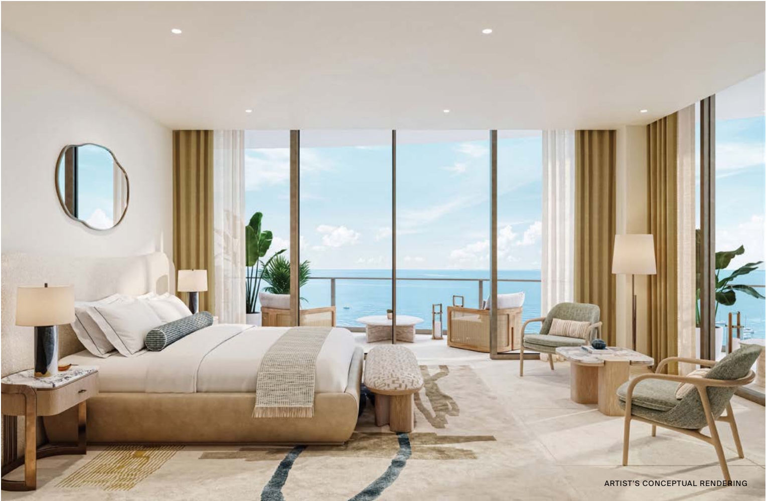
SEDUCTIVE, LIGHT-FILLED INTERIORS DESIGNED BY TARA BERNERD & PARTNERS