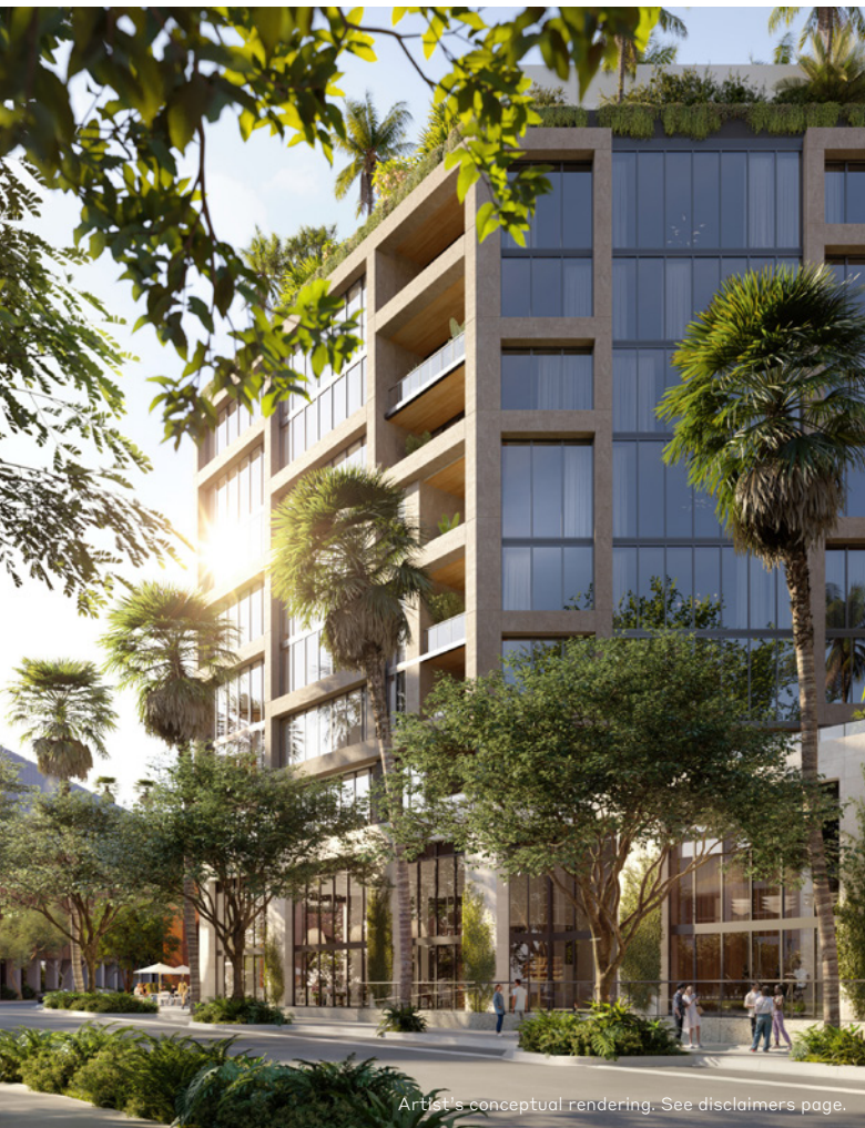
Artist's conceptual rendering. See disclaimers page.