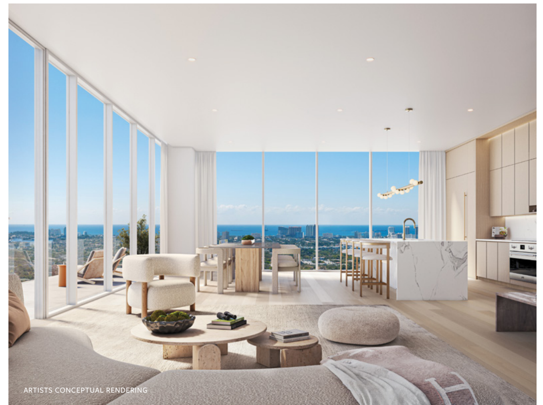
ARTISTS CONCEPTUAL RENDERING

With a community plaza for everyday conveniences and 100,000 SF of limitless amenity space exclusive to residents, Ombelle offers a lifestyle unlike anything yet to be imagined in Fort Lauderdale.