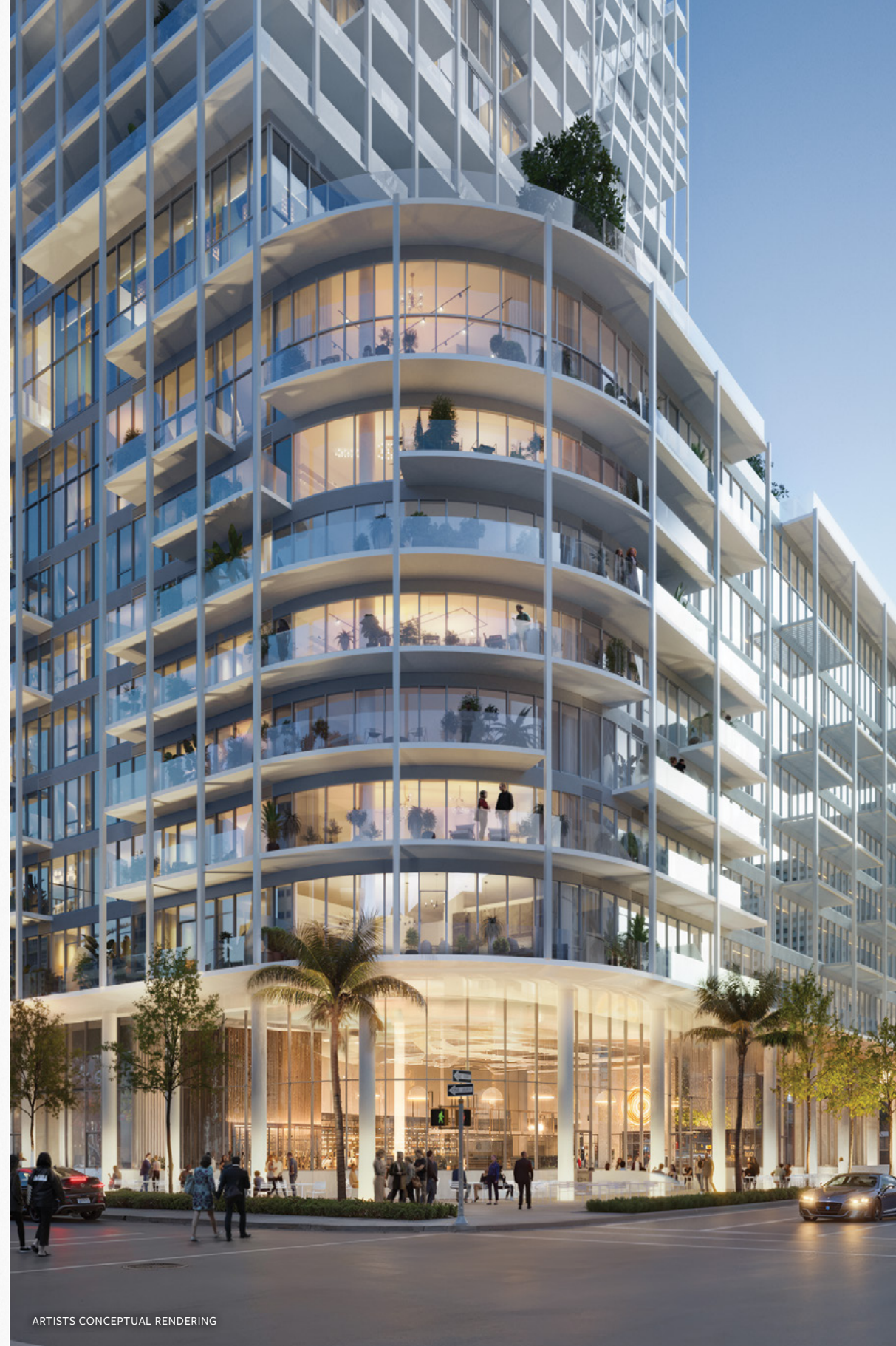
ARTISTS' CONCEPTUAL RENDERING

A TRUE LANDMARK OF CONTEMPORARY URBAN LIVING.