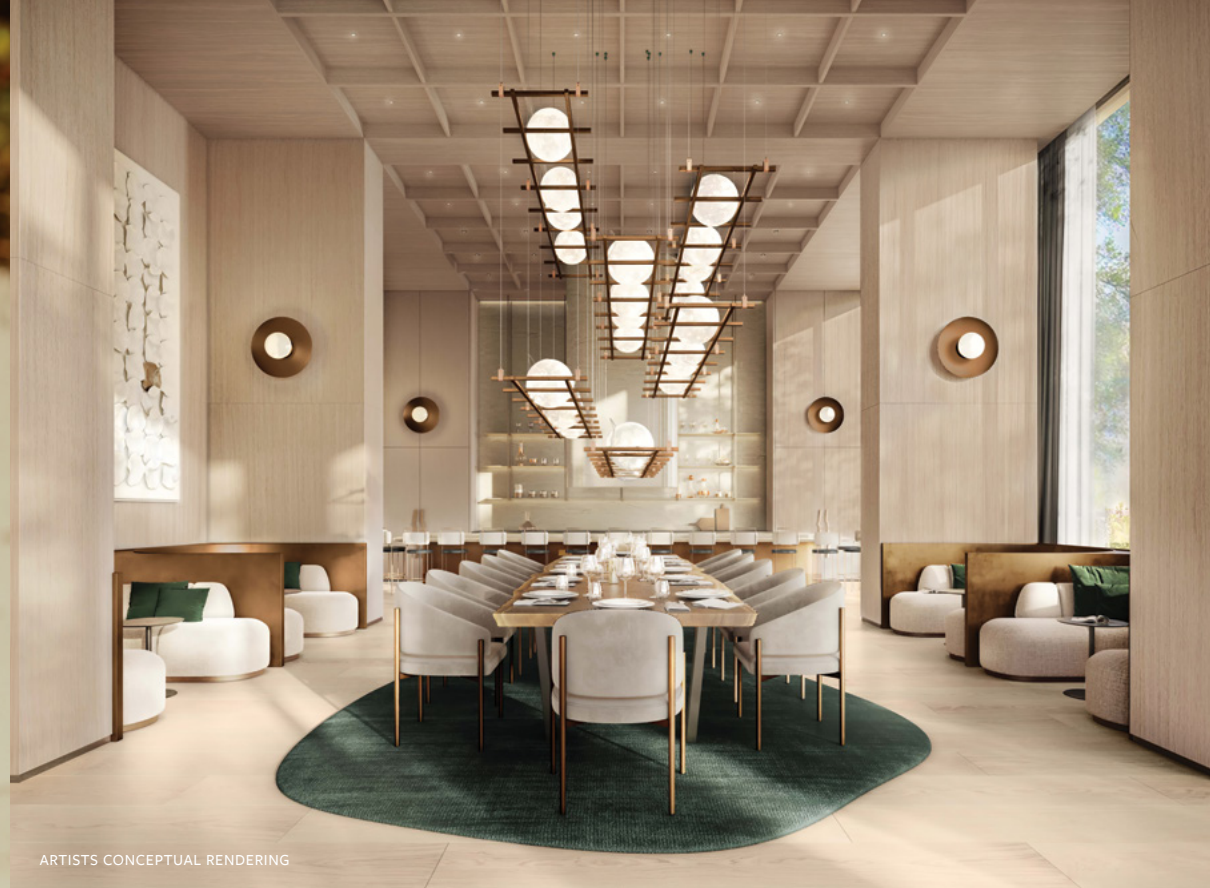
ARTISTS CONCEPTUAL RENDERING

WHERE PEOPLE AND IDEAS COME TOGETHER TO CO-CREATE A DANCE OF CITY LIFE, THE NATURAL ENVIRONMENT, AND AN ELEVATED SIGNATURE OF TIMELESS BEAUTY.