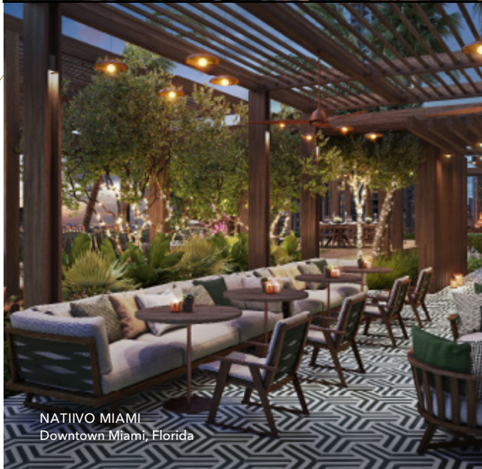
NATIIVO MIAMI Downtown Miami, Florida