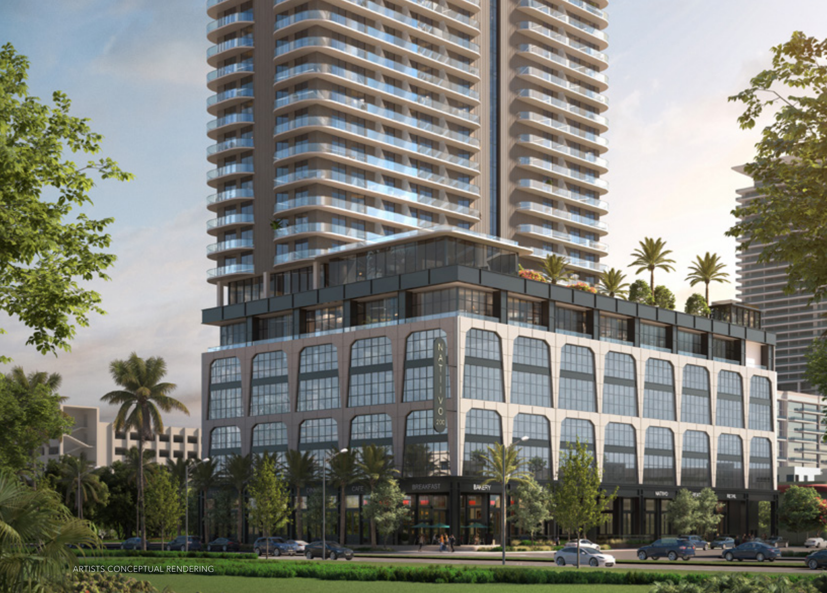
ARTISTS CONCEPTUAL RENDERING