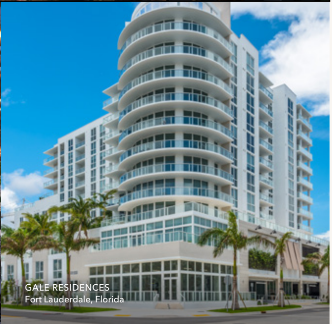
GALE RESIDENCES Fort Lauderdale, Florida