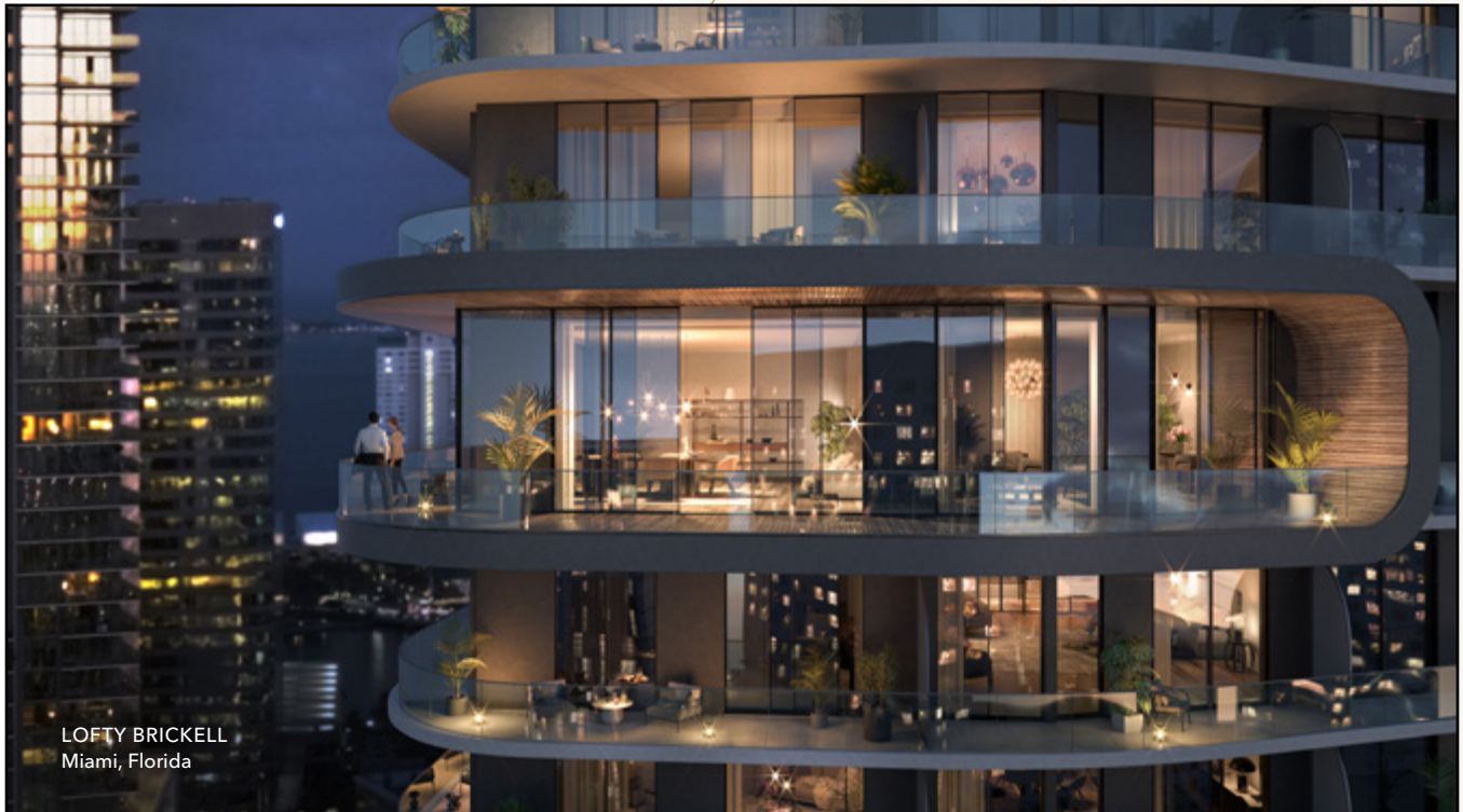
LOFTY BRICKELL Miami, Florida

A SELECTION OF NEWGARD DEVELOPED PROPERTIES