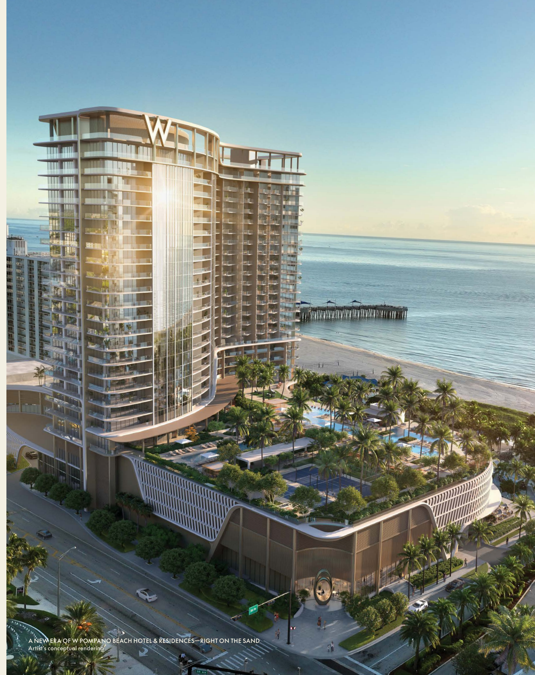
A NEW ERA OF W POMPAÑO BEACH HOTEL & RESIDENCES—RIGHT ON THE SAND Artist's conceptual rendering

Access to all W Hotel facilities, including WET® Pool Deck, AWAY® Spa, FIT® Gym, meeting and event rooms, and The Living Room