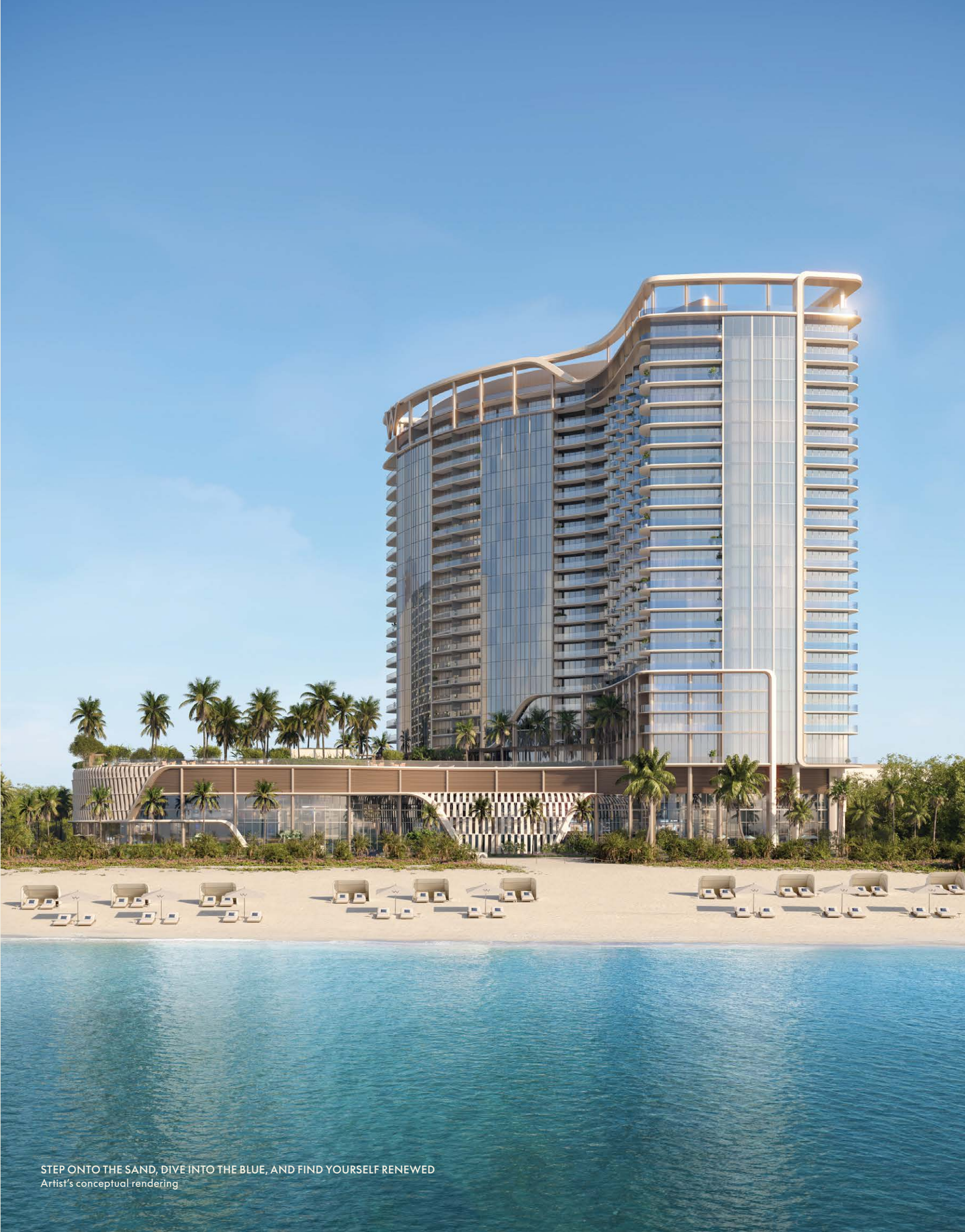
STEP ONTO THE SAND, DIVE INTO THE BLUE, AND FIND YOURSELF RENEWED Artist's conceptual rendering