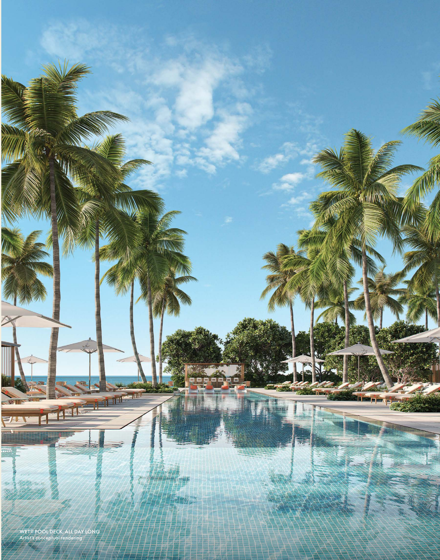
WET® POOL DECK, ALL DAY LONG Artist's conceptual rendering