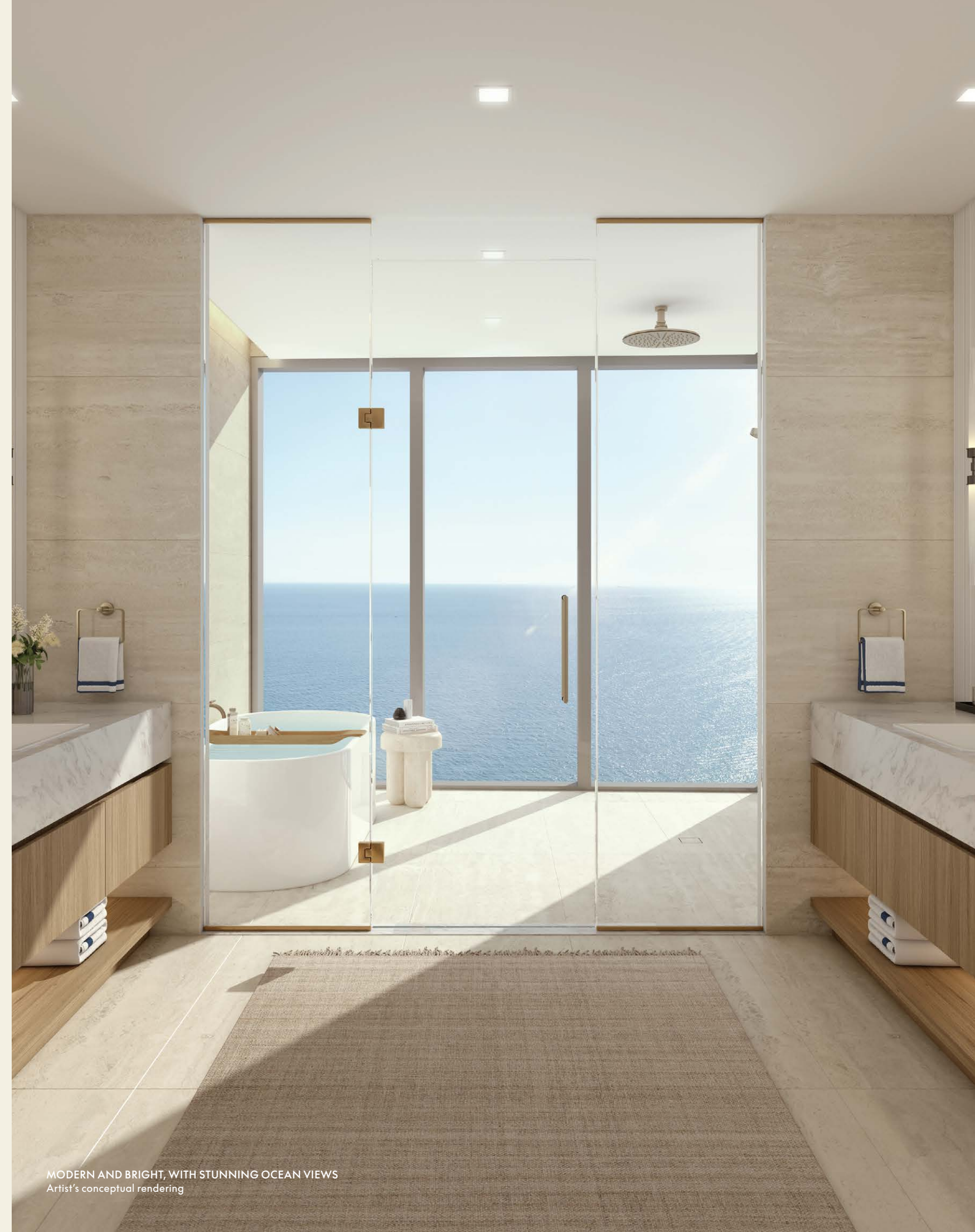
MODERN AND BRIGHT, WITH STUNNING OCEAN VIEWS Artist's conceptual rendering