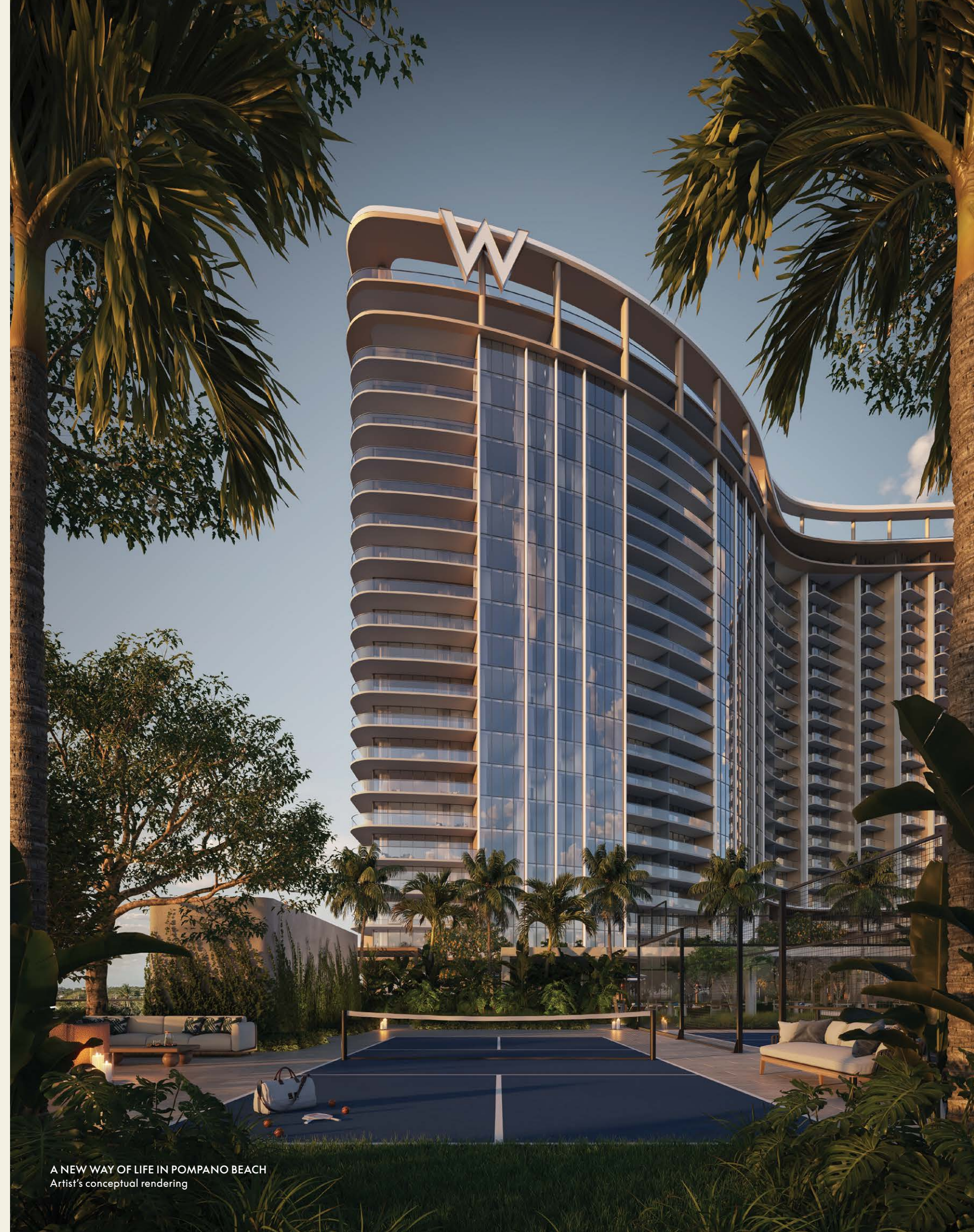
A NEW WAY OF LIFE IN POMpano BEACH Artist's conceptual rendering

Founded by renowned Swiss landscape architect Enzo Enea, Enea Landscape Architecture is an internationally renowned firm known for creating extraordinary outdoor environments. Enea brings over three decades of experience in blending art, nature, and architecture to craft timeless landscapes. Enea's diverse portfolio includes private residences, urban parks, luxury developments, hospitality projects, and public spaces. Their designs feature meticulously curated outdoor spaces that seamlessly integrate with the architecture. They use native plants, sculptural elements, and creative architectural solutions, ensuring aesthetic appeal and sustainability, all while respecting the genus loci of Pompano Beach. Whether it's tranquil courtyards, lush rooftop gardens, or sophisticated pool areas, Enea Landscape Architecture creates serene and inviting spaces for residents and guests to enjoy. Their designs elevate the living experience, offering a harmonious connection between nature and the built environment.