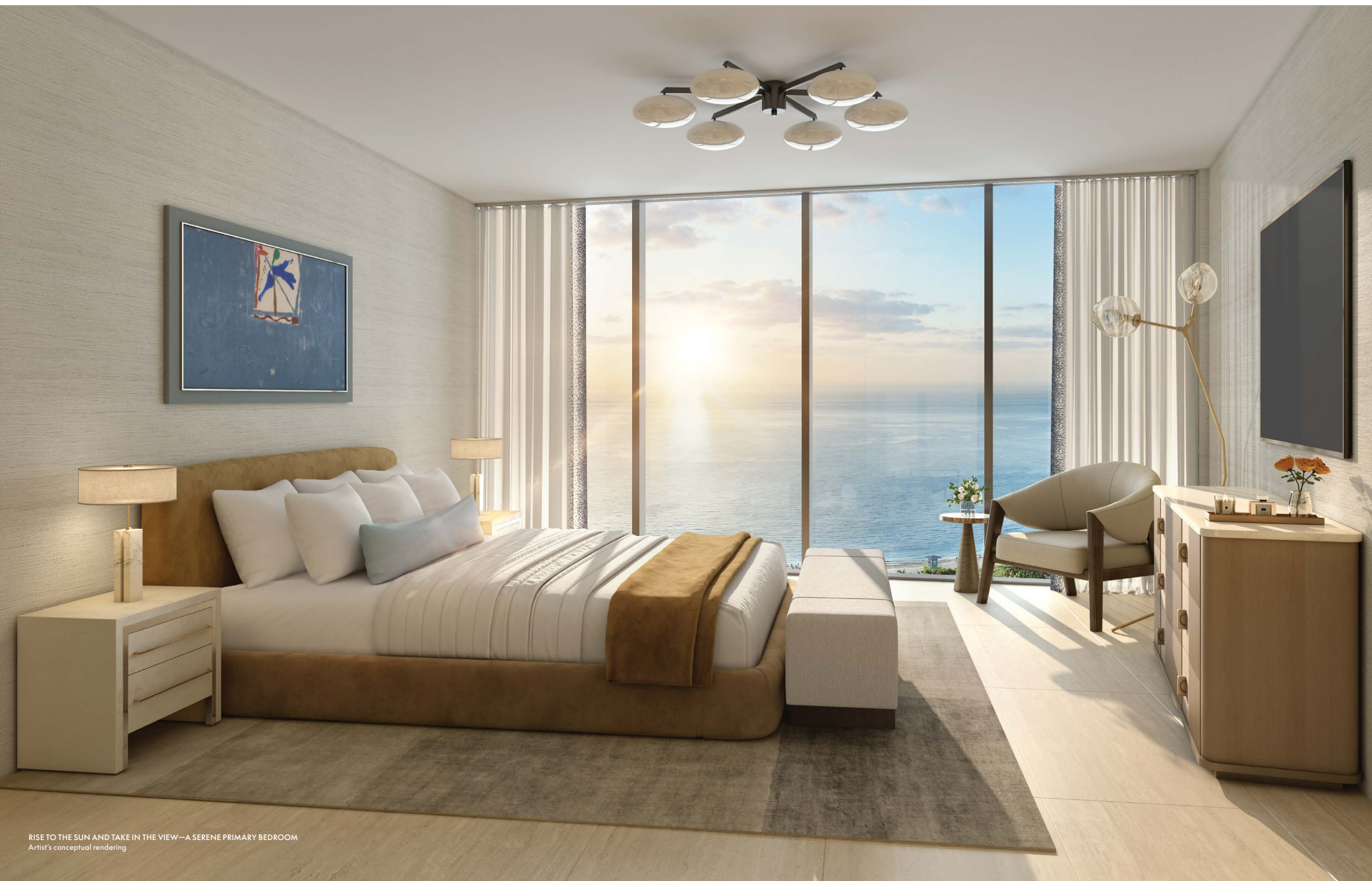
RISE TO THE SUN AND TAKE IN THE VIEW—A SERENE PRIMARY BEDROOM Artist's conceptual rendering