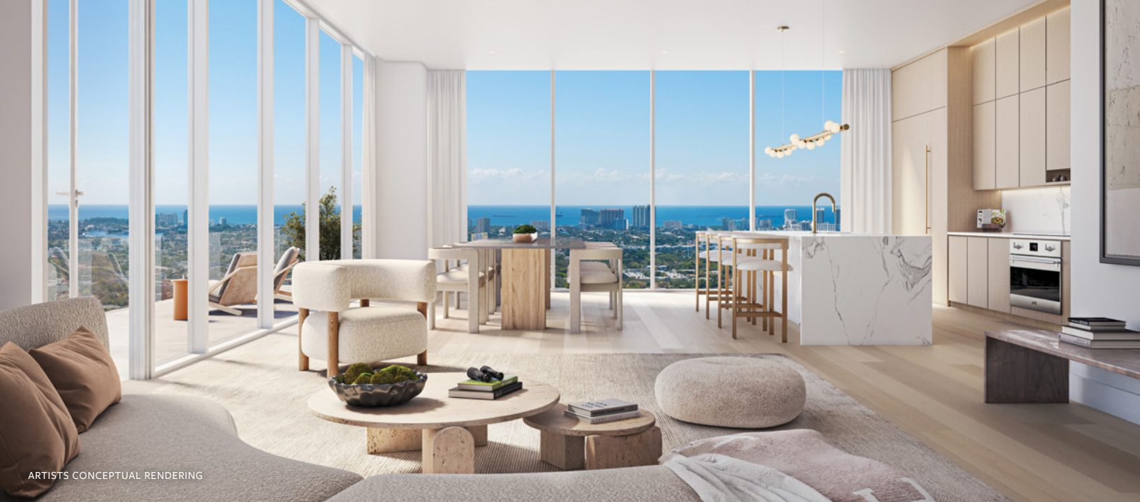
ARTISTS CONCEPTUAL RENDERING