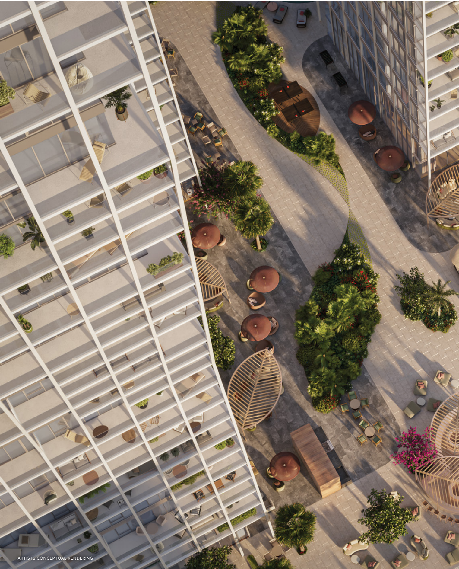
ARTISTS CONCEPTUAL RENDERING