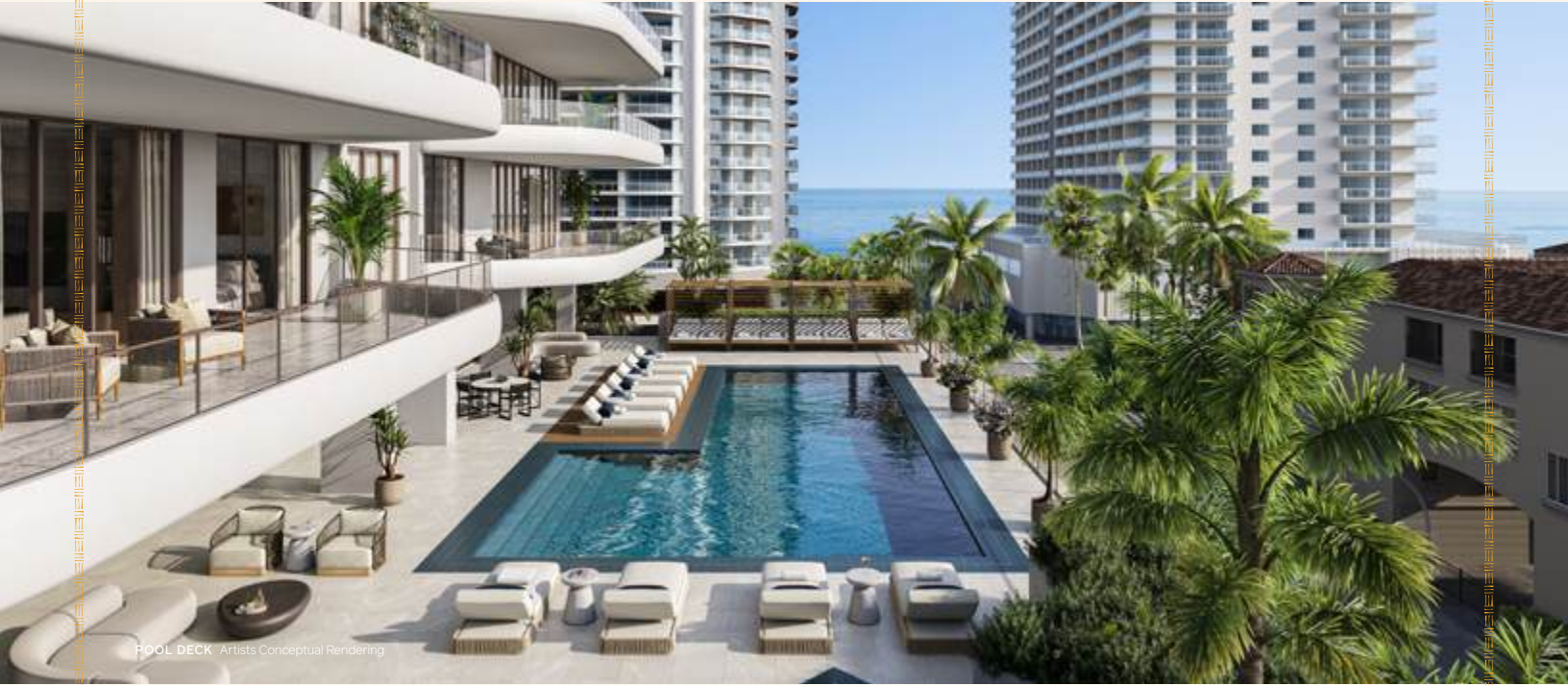
POOL DECK - Artists Conceptual Rendering