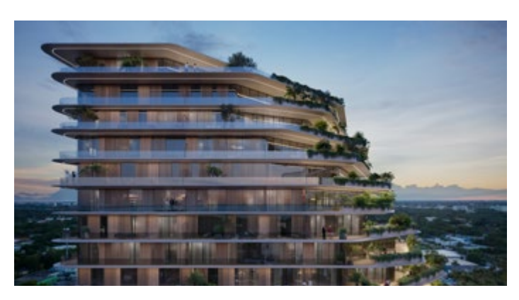
ARCHITECTURAL DESIGN & BRAND

Since 1979, Related Group has enhanced skylines with iconic developments characterized by innovative design, enduring quality and inclusive living. Through groundbreaking partnerships with world-renowned architects, designers and artists, Related has redefined urban environments on a global scale, fostering distinctive, dynamic communities and symbolic landmarks that have become sources of local pride. To date, Related has built and managed more than 100,000 condominium and apartment residences that are meticulously designed with finishes and amenities that transform buildings into vibrant residential environments. Related doesn't just create neighborhoods... it builds legacies.