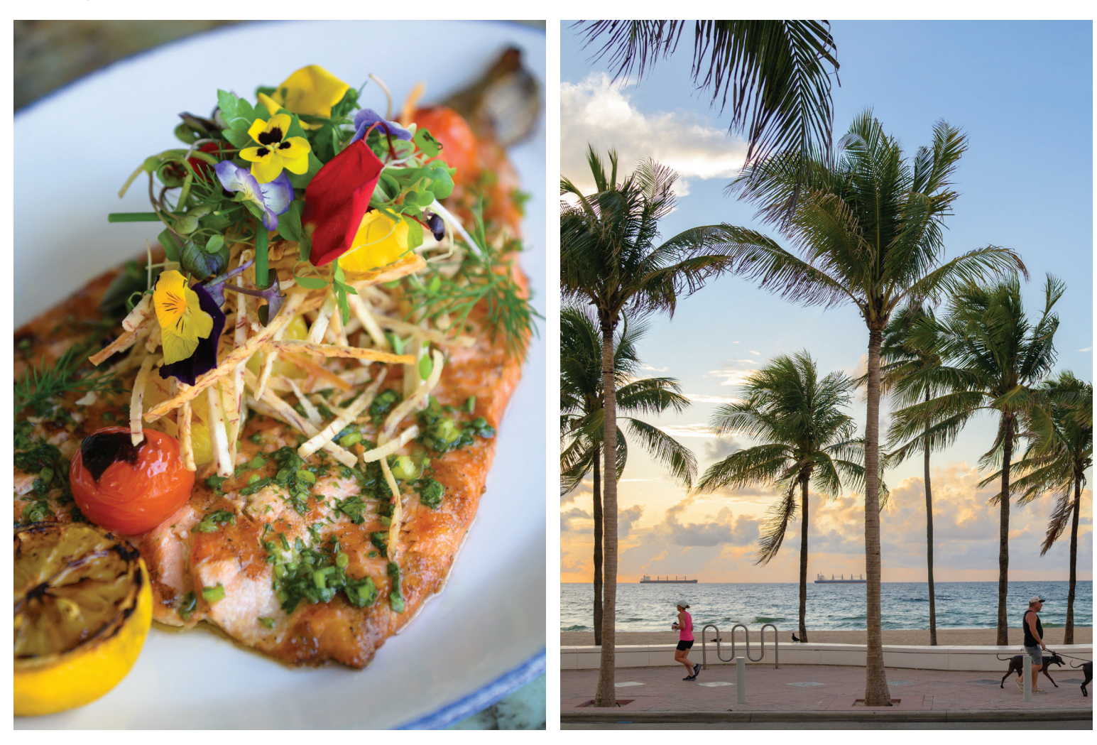
FORT LAUDERDALE OFFERS A BALANCE OF LAID-BACK BEACH LIFESTYLES AND VIBRANT URBAN ACTIVITIES