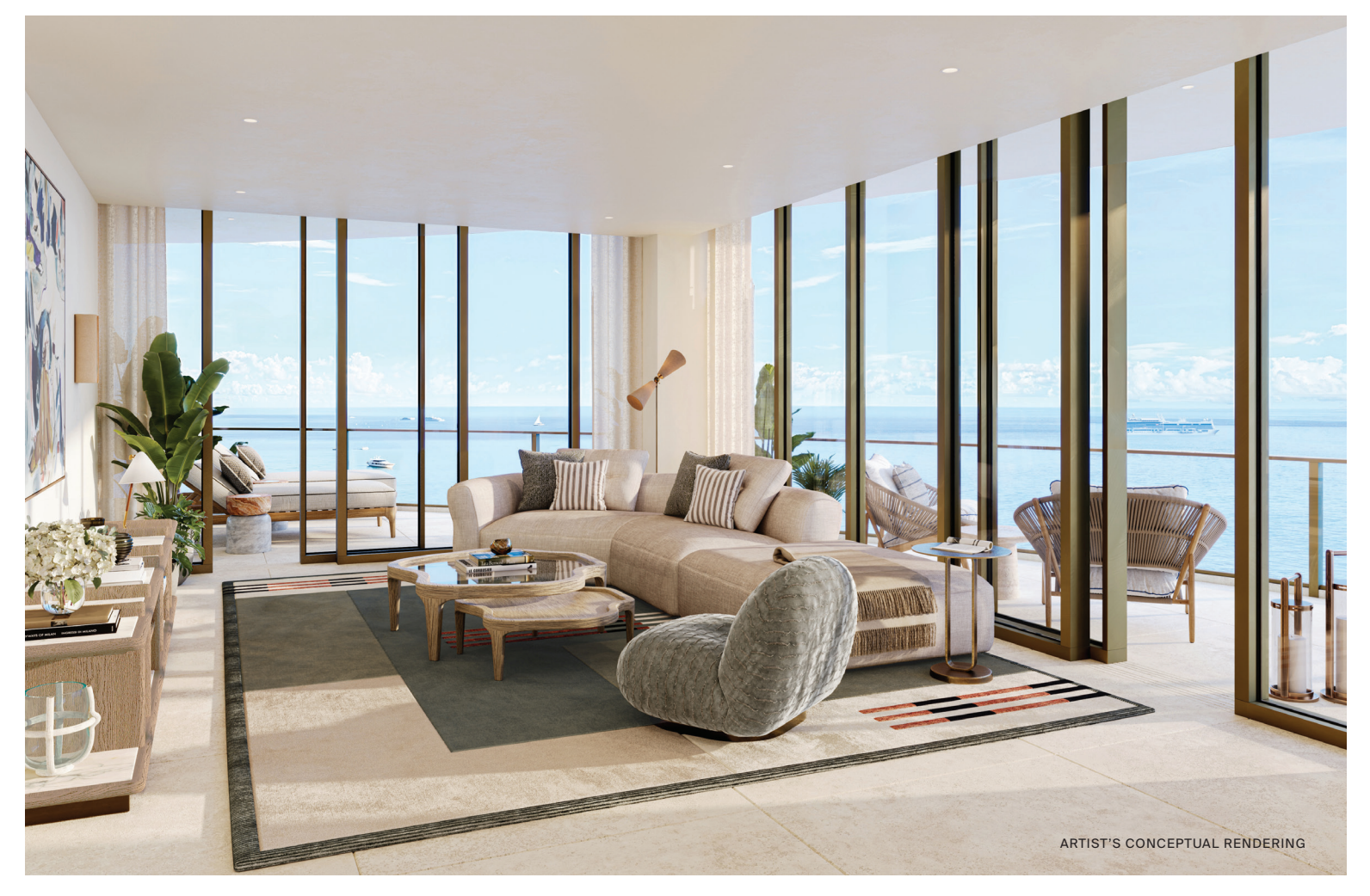
SWEEPING VIEWS OF THE BAY AND THE OCEAN ARE TRULY RESTORATIVE