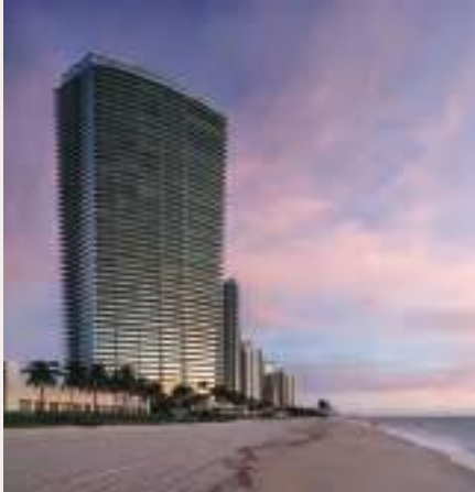
RESIDENCES BY ARMANI CASA, SUNNY ISLES