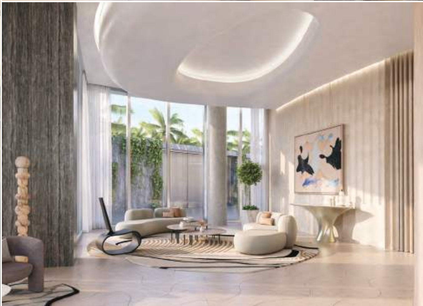
TOP: READING LOUNGE; BOTTOM: FORMAL SITTING LOUNGE