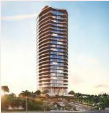
FORTÉ, WEST PALM BEACH

Founded in 1979, Related Group has enhanced skylines with iconic development characterized by innovative design, enduring quality and inclusive living. Through groundbreaking partnerships with world-renowned architects, designers and artists, Related redefines urban environments on a global scale, fostering distinctive dynamic communities and symbolic landmarks. The firm is one of the largest privately owned businesses in the U.S., with a development portfolio in excess of $40 billion in 40 years.