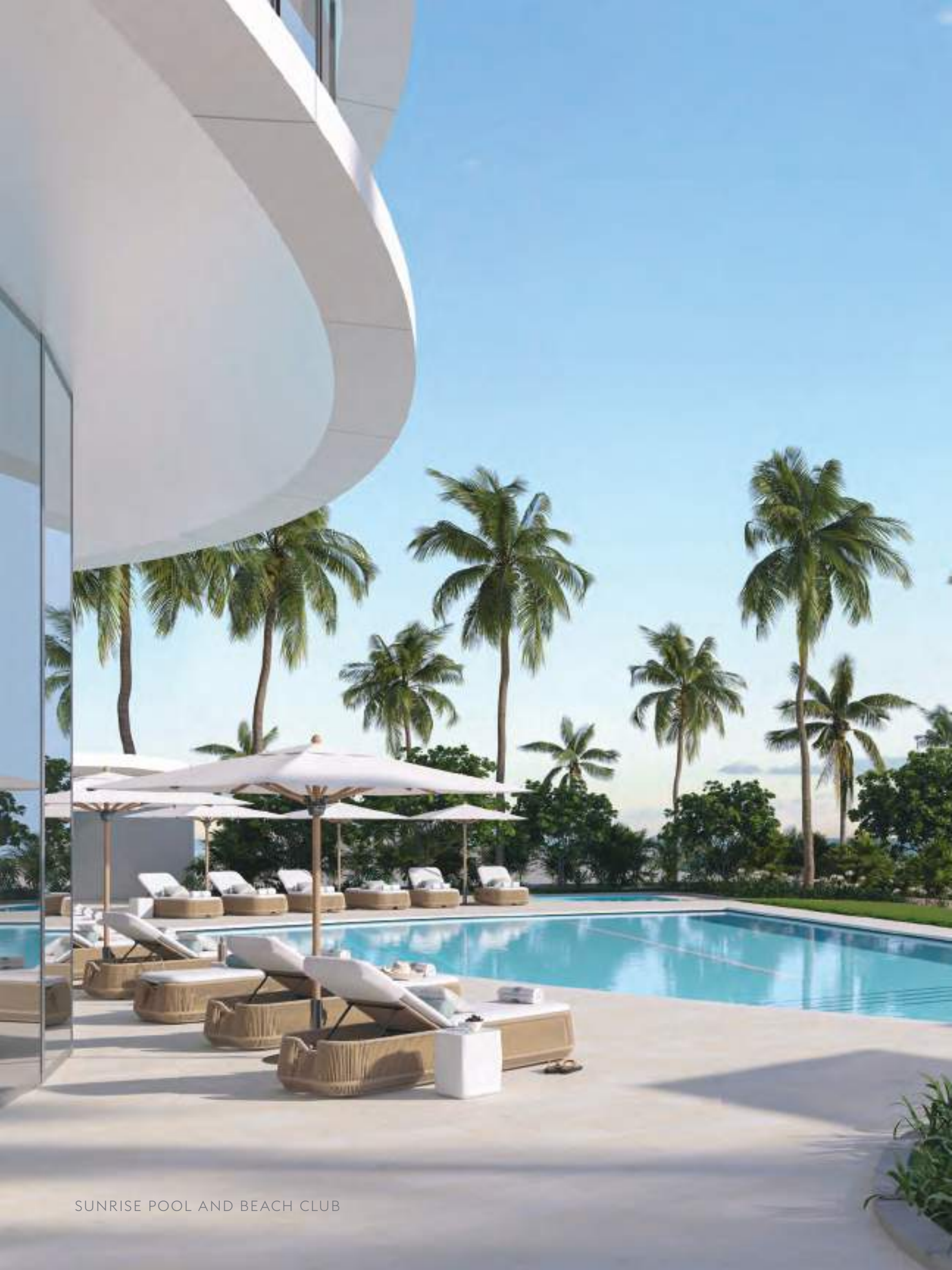
SUNRISE POOL AND BEACH CLUB