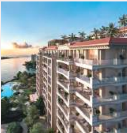
THE RESIDENCES AT 6 FISHER ISLAND, MIAMI

Two Roads Development is a South Florida-based real estate development firm whose principals have over 120 years of combined experience in developing, financing and marketing residential and commercial projects across the U.S. The company's visionary approach and unparalleled business acumen combine to create landmark projects in some of the nation's most celebrated metropolitan areas.