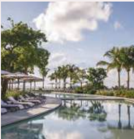
PARK GROVE, MIAMI