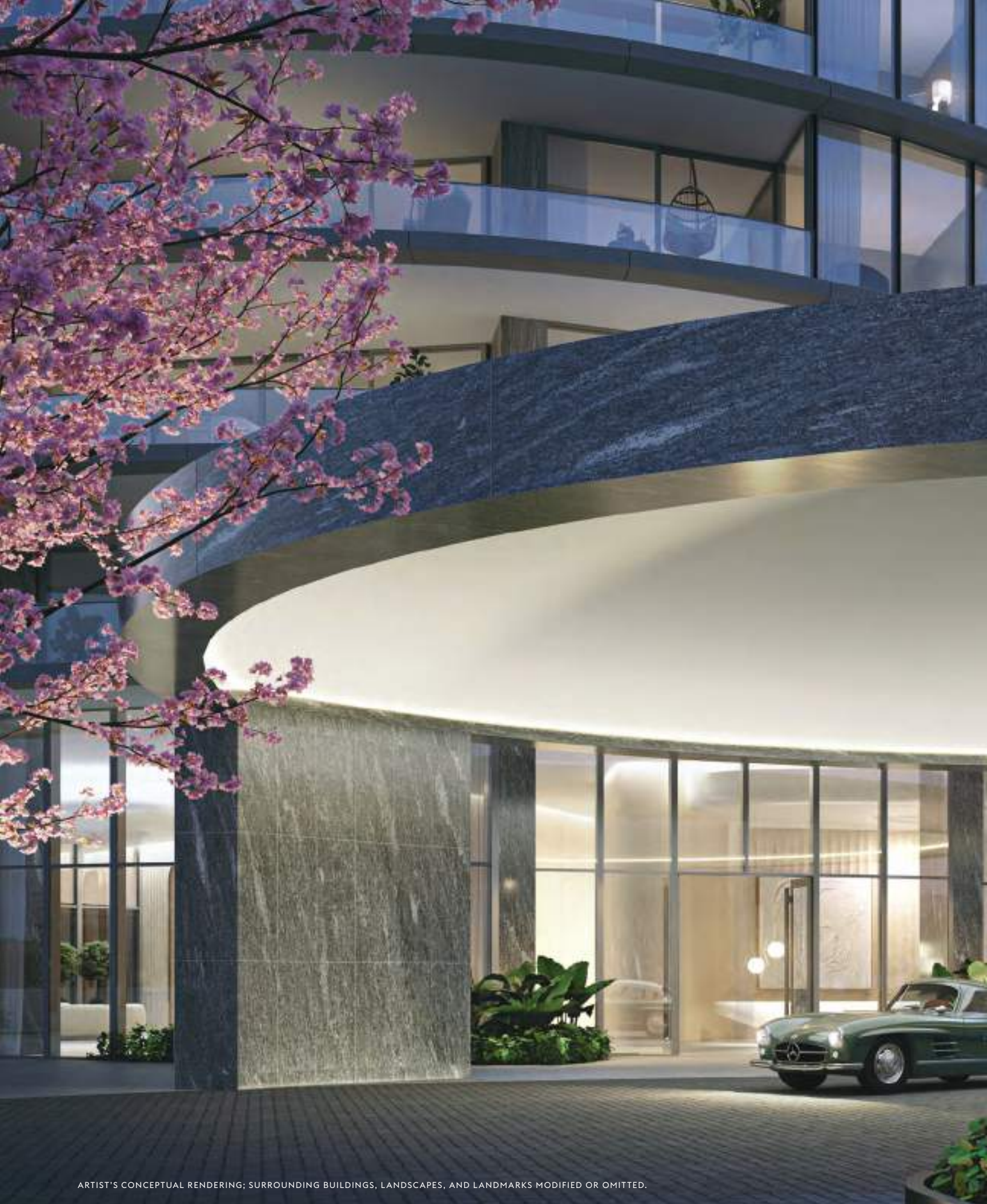
ARTIST'S CONCEPTUAL RENDERING; SURROUNDING BUILDINGS, LANDSCAPES, AND LANDMARKS MODIFIED OR OMITTED.