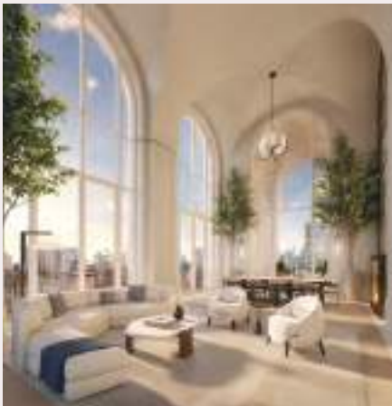
FOUR SEASONS, BOGOTÁ

Skidmore, Owings & Merrill (SOM) is a leading architecture, engineering, and planning practice responsible for some of the world's most technically and environmentally advanced buildings and public spaces—from Burj Khalifa in Dubai and One World Trade Center in New York City to Millennium Park in Chicago.