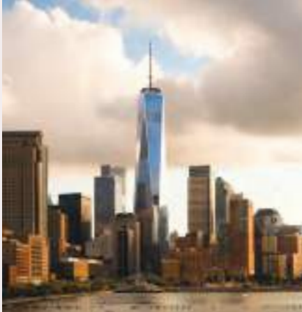
ONE WORLD TRADE CENTER, NEW YORK