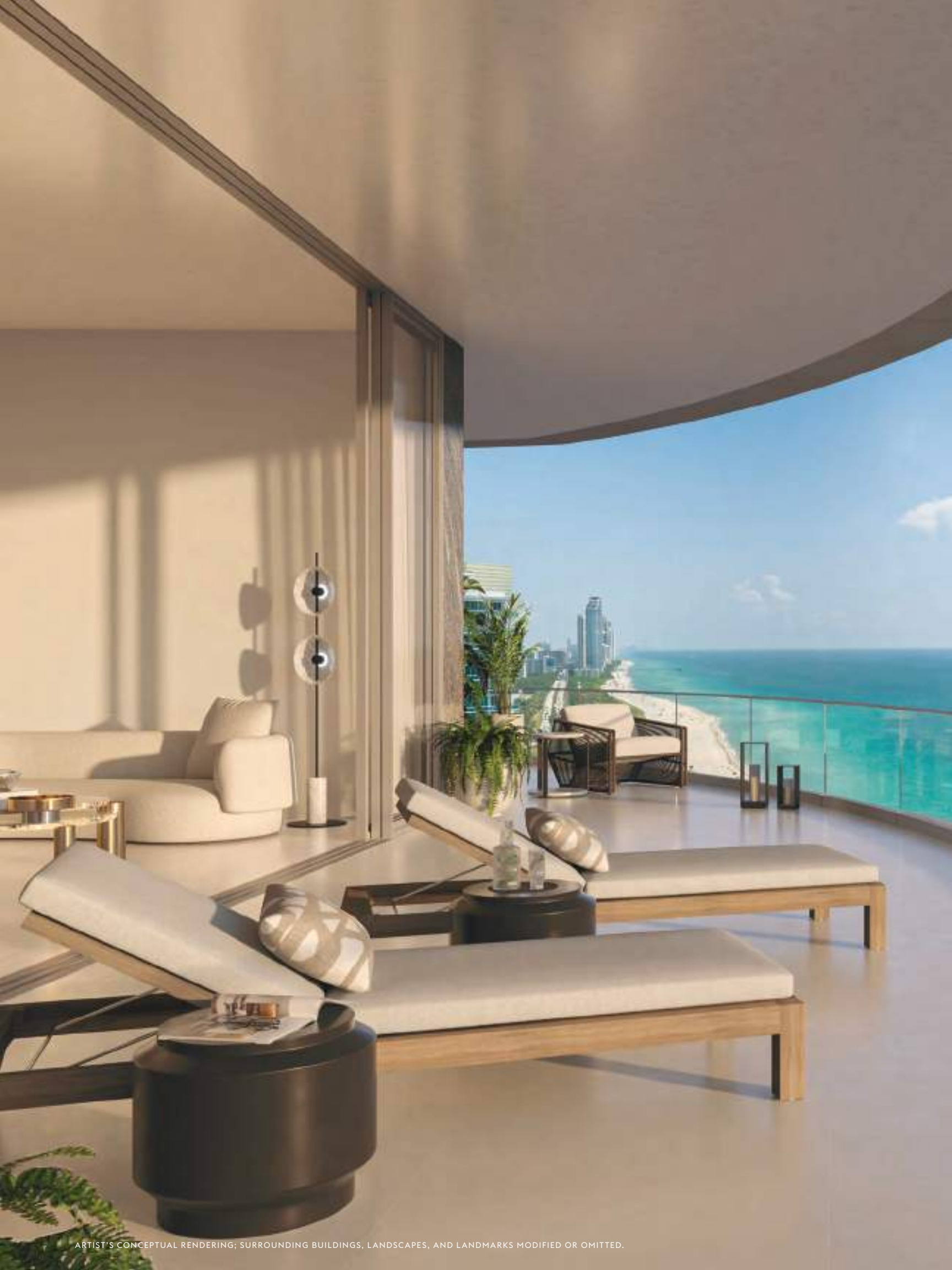
ARTIST'S CONCEPTUAL RENDERING; SURROUNDING BUILDINGS, LANDSCAPES, AND LANDMARKS MODIFIED OR OMITTED.