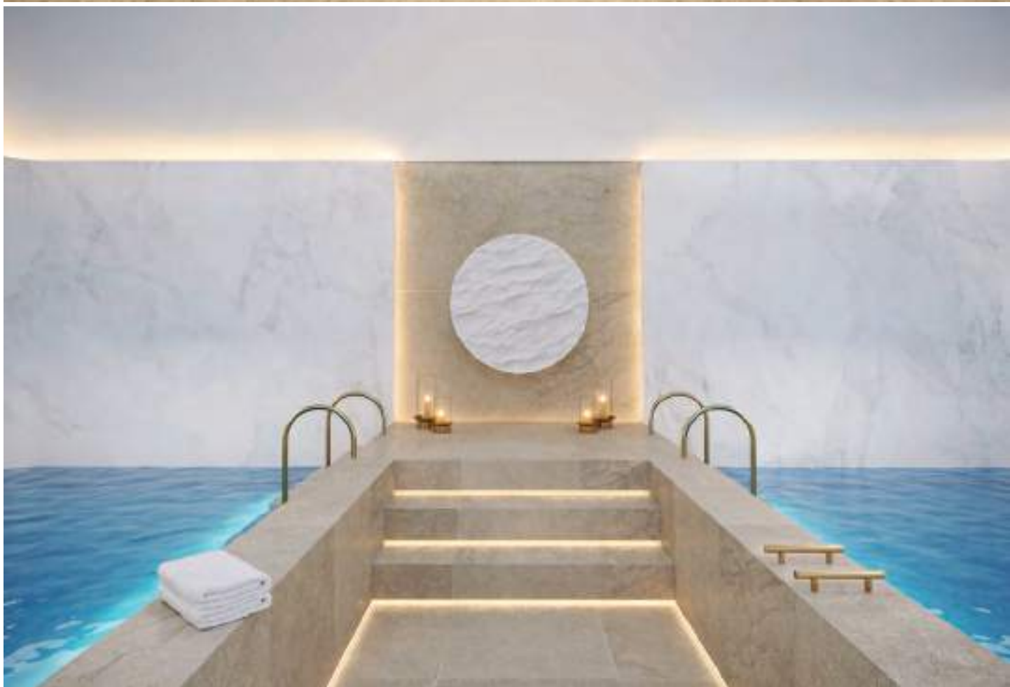
TOP: HAMMAM; BOTTOM: HOT AND COLD PLUNGE POOLS