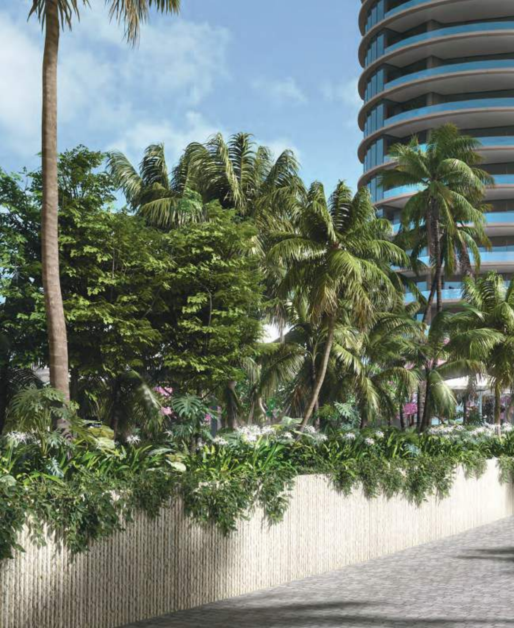
ARRIVAL FROM COLLINS AVENUE