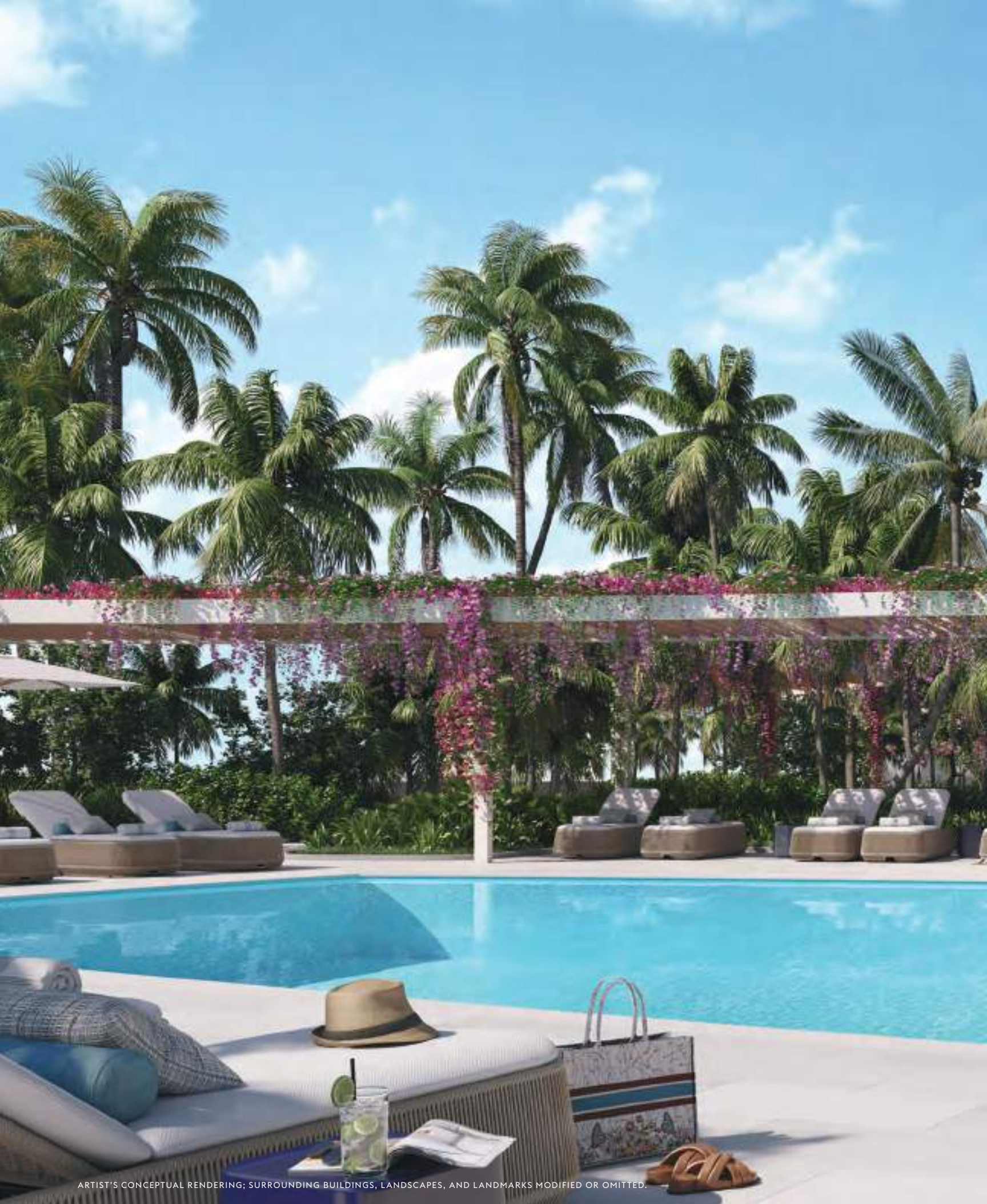
ARTIST'S CONCEPTUAL RENDERING; SURROUNDING BUILDINGS, LANDSCAPES, AND LANDMARKS MODIFIED OR OMITTED.