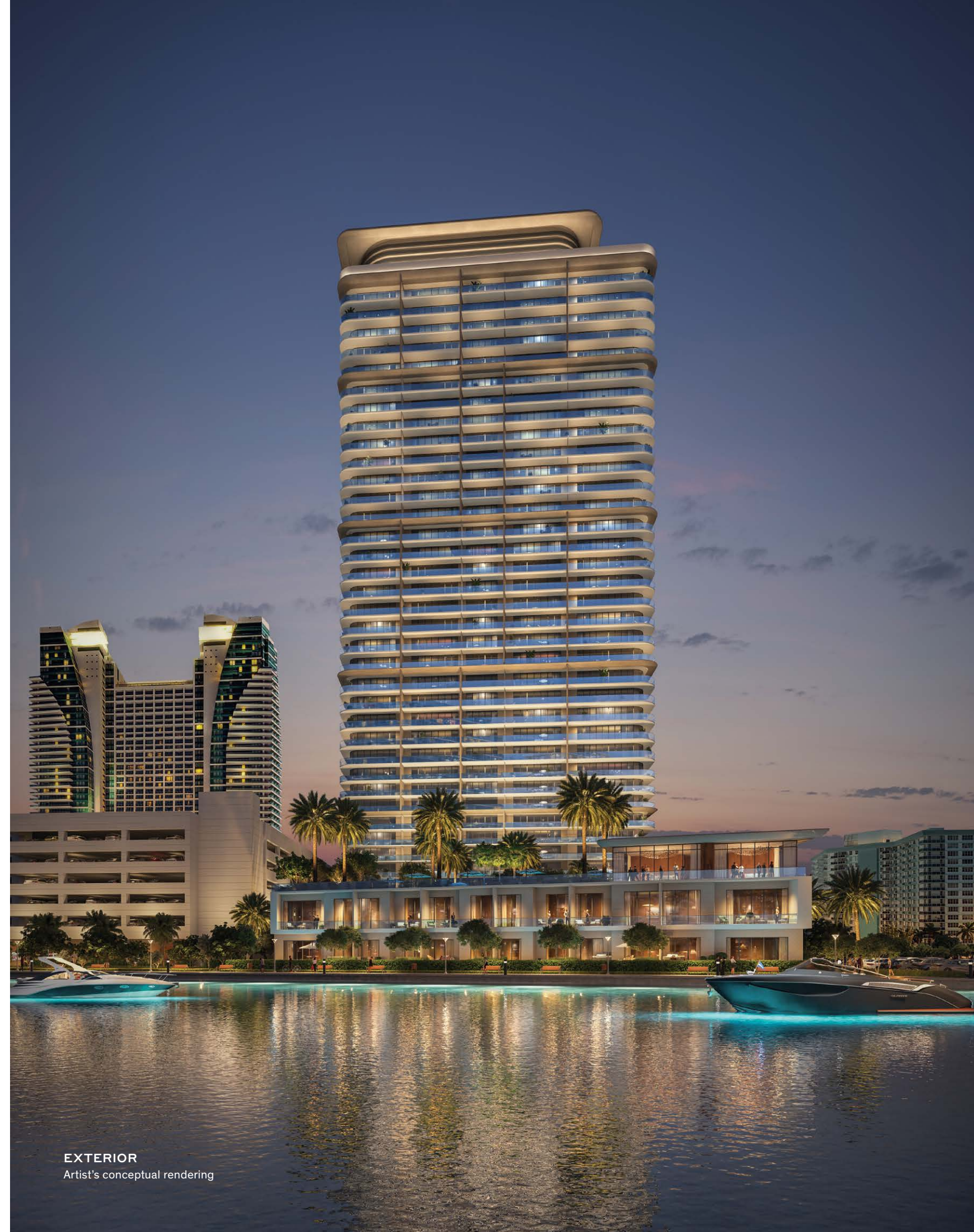
EXTERIOR Artist's conceptual rendering