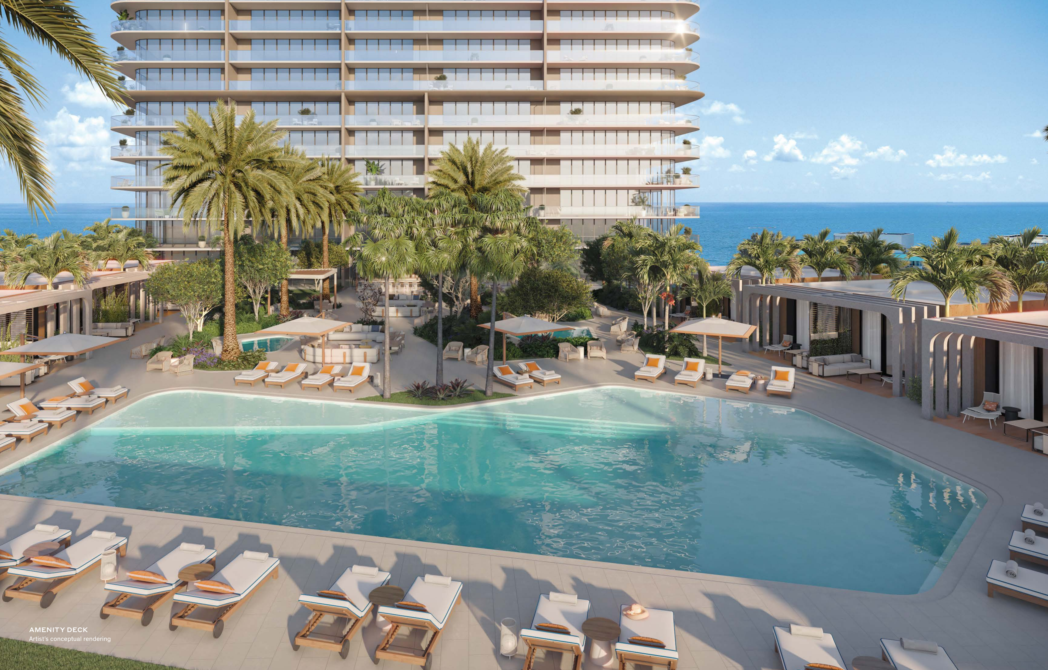
AMENITY DECK Artist's conceptual rendering