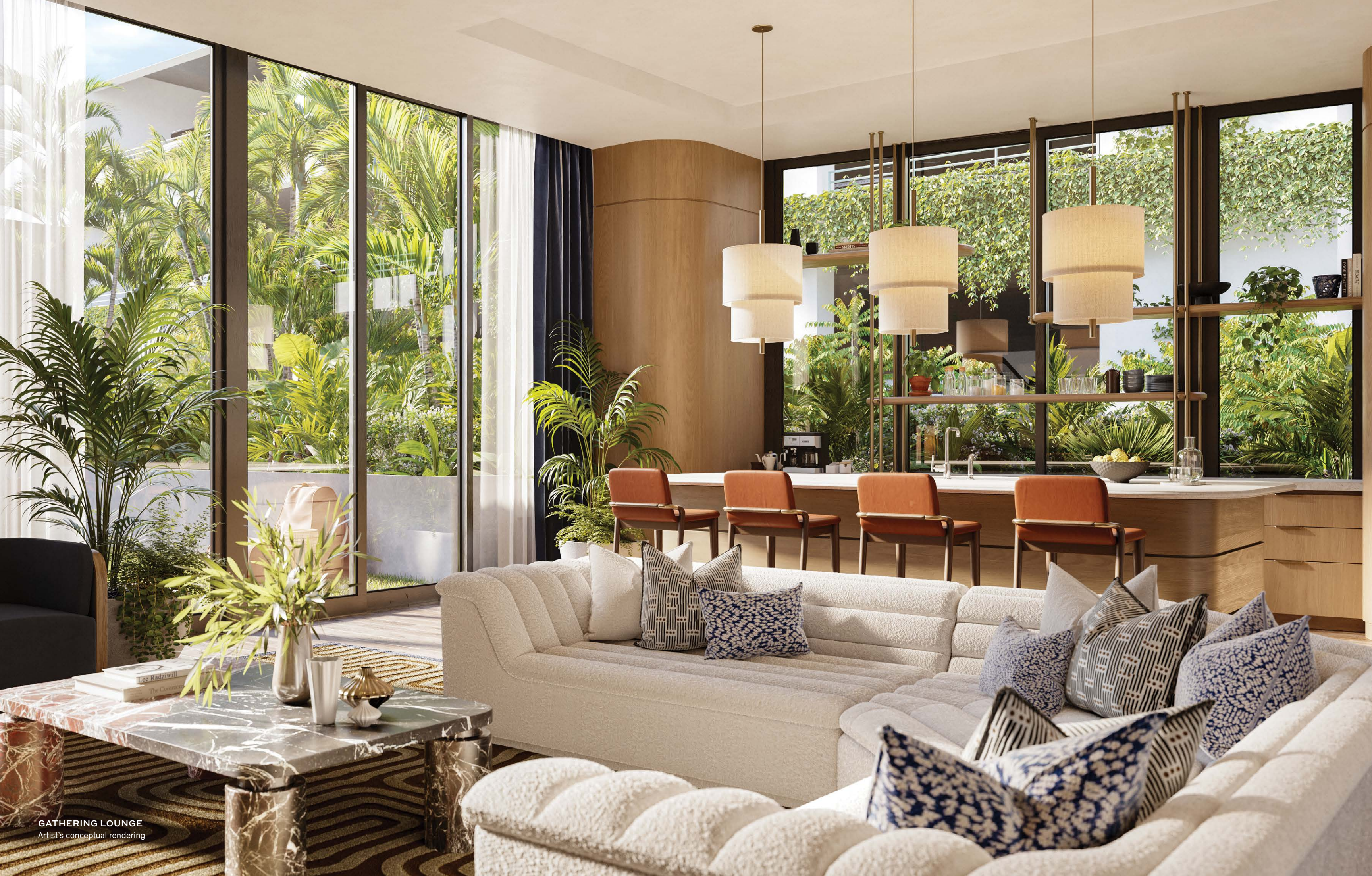
GATHERING LOUNGE Artist's conceptual rendering