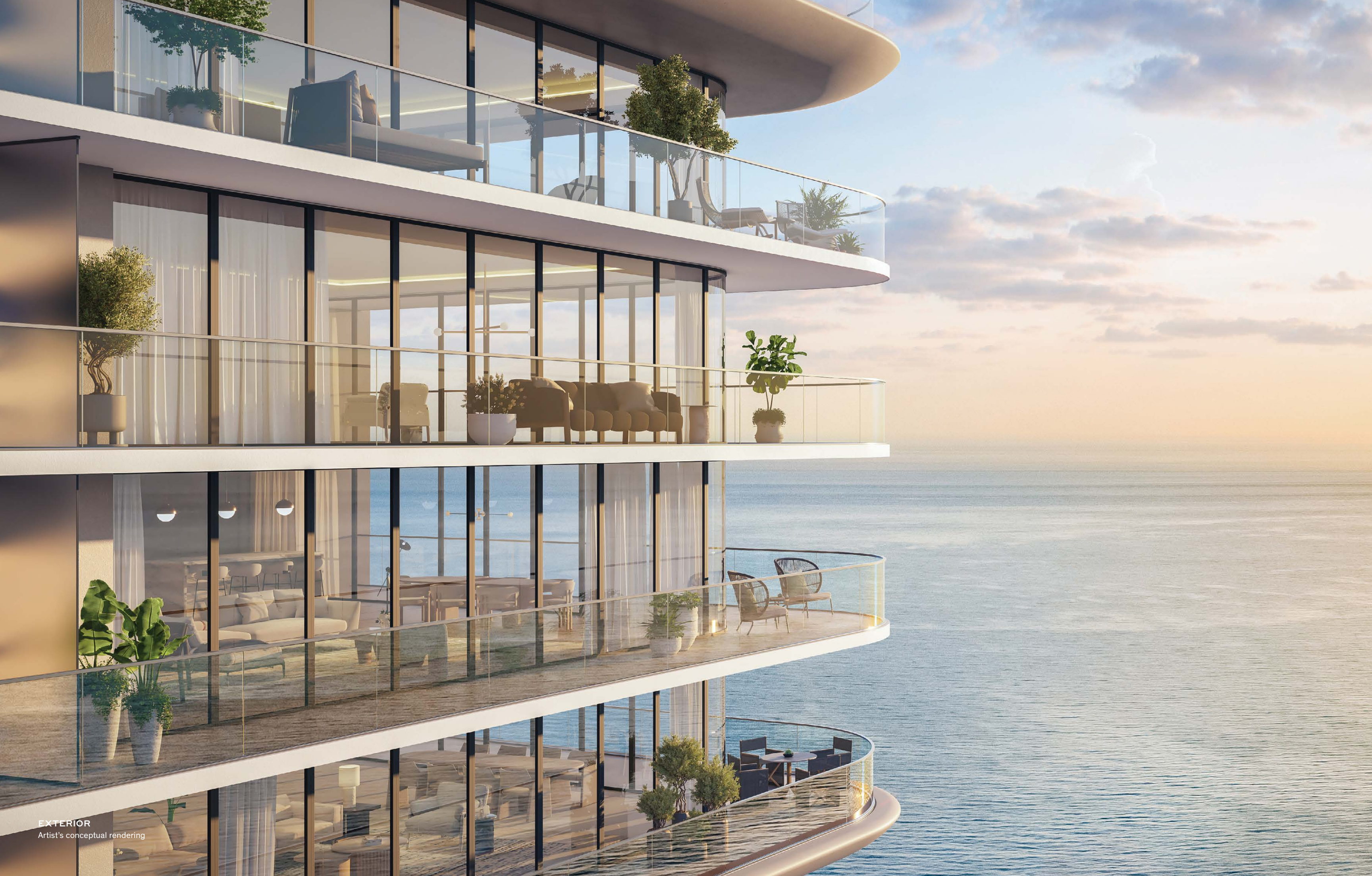
EXTERIOR Artist's conceptual rendering