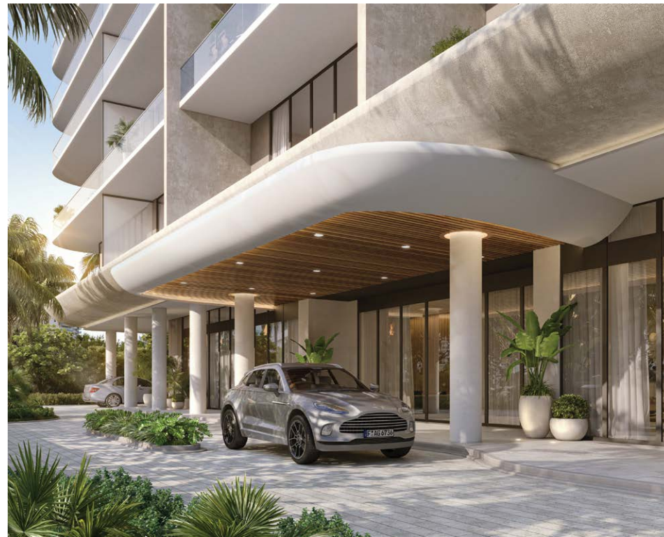
PORTE-COCHERE Artist's conceptual rendering

An expert concierge and management team are on hand to accommodate your requests, offer local guidance, and ensure that life at Icon Beach Residences feels effortless.