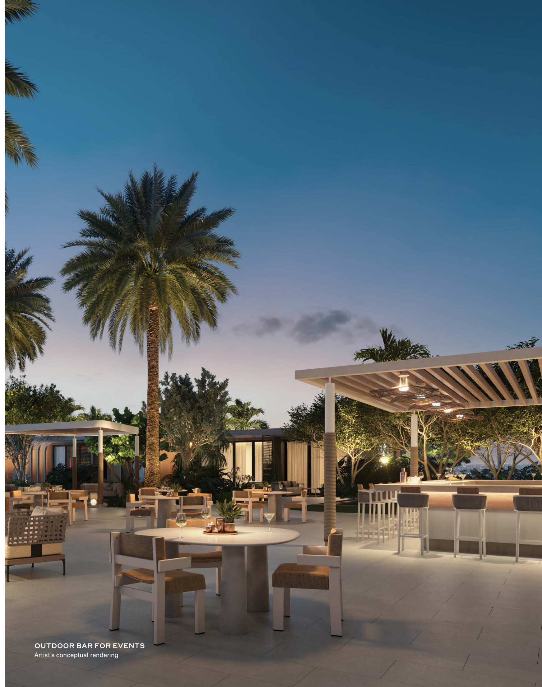
OUTDOOR BAR FOR EVENTS Artist's conceptual rendering