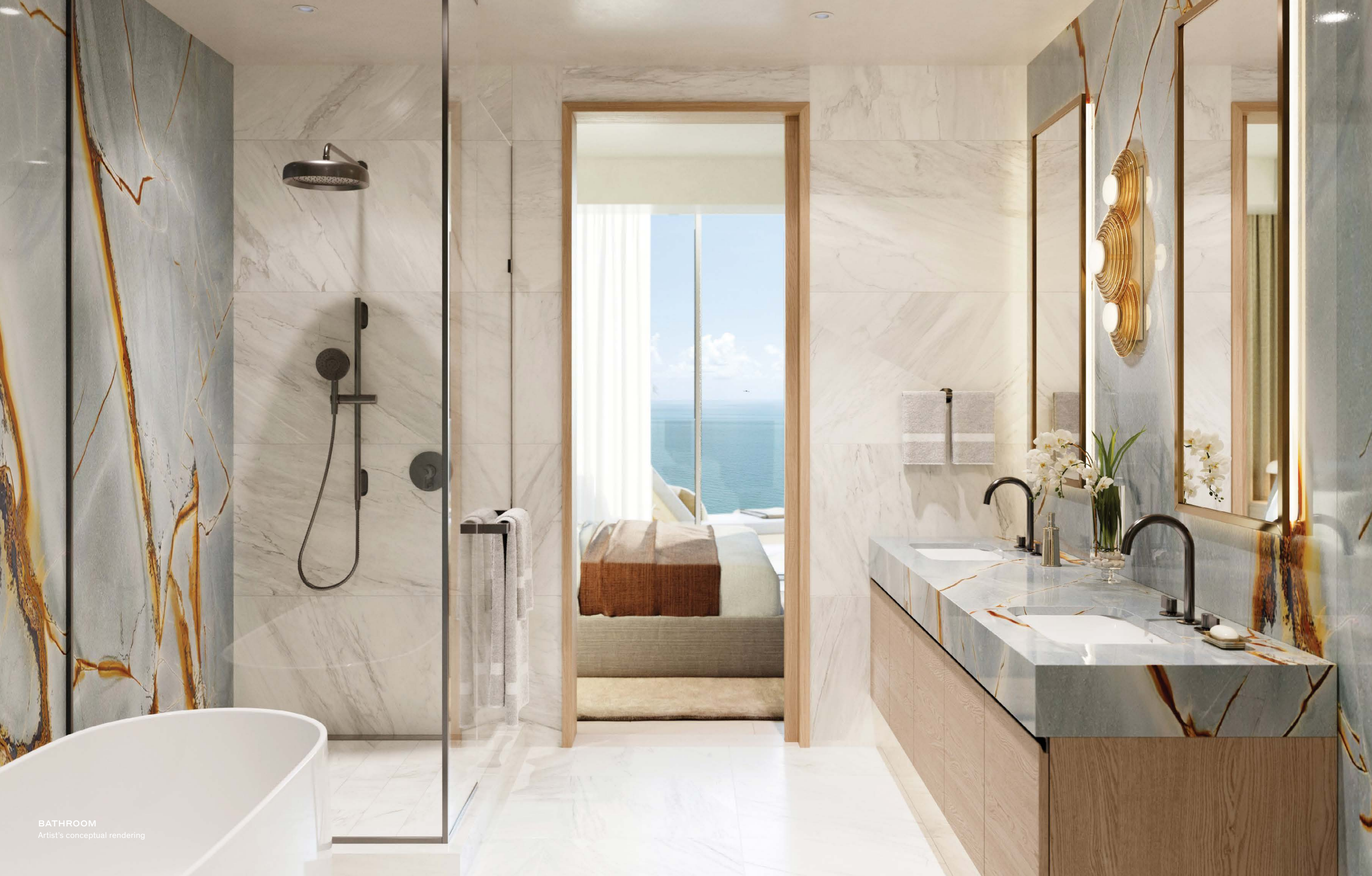
BATHROOM Artist's conceptual rendering