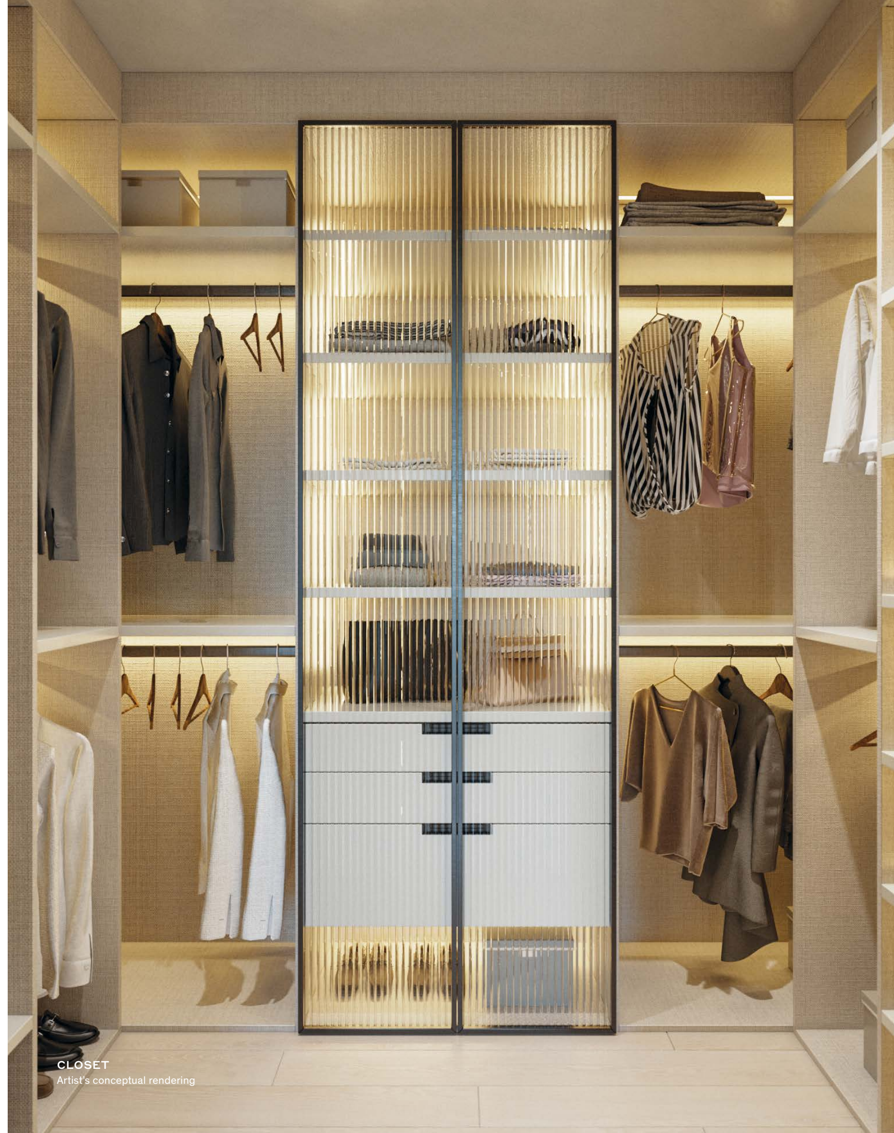
CLOSET Artist's conceptual rendering