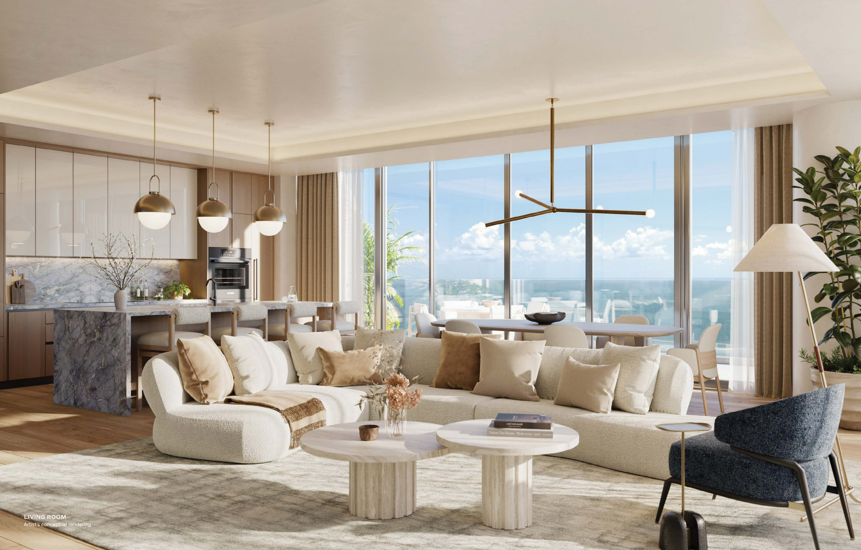
LIVING ROOM Artist's conceptual rendering