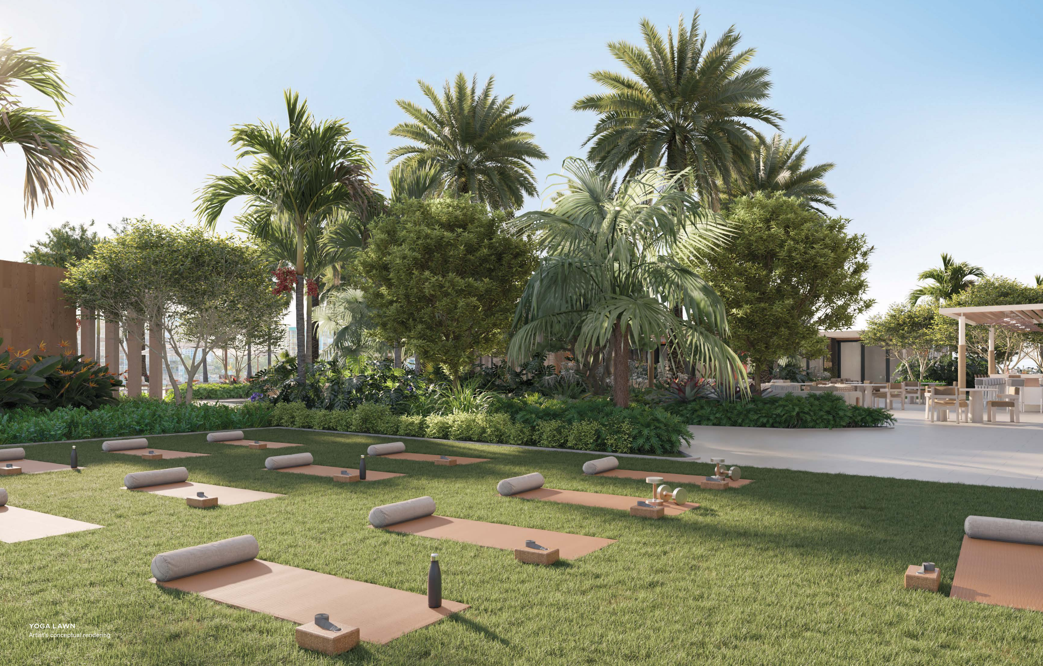
YOGA LAWN Artist's conceptual rendering