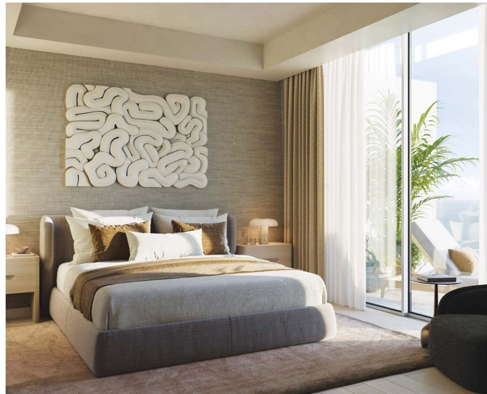
BEDROOM Artist's conceptual rendering

Interiors by Meyer Davis create a warm, minimalist aesthetic with clean, fluent lines, striking textures, and open, modern living spaces. The palette is distinctively soft and neutral, accentuated by rich coastal colors—a captivating blend of organic oceanfront beauty and streamlined custom design.