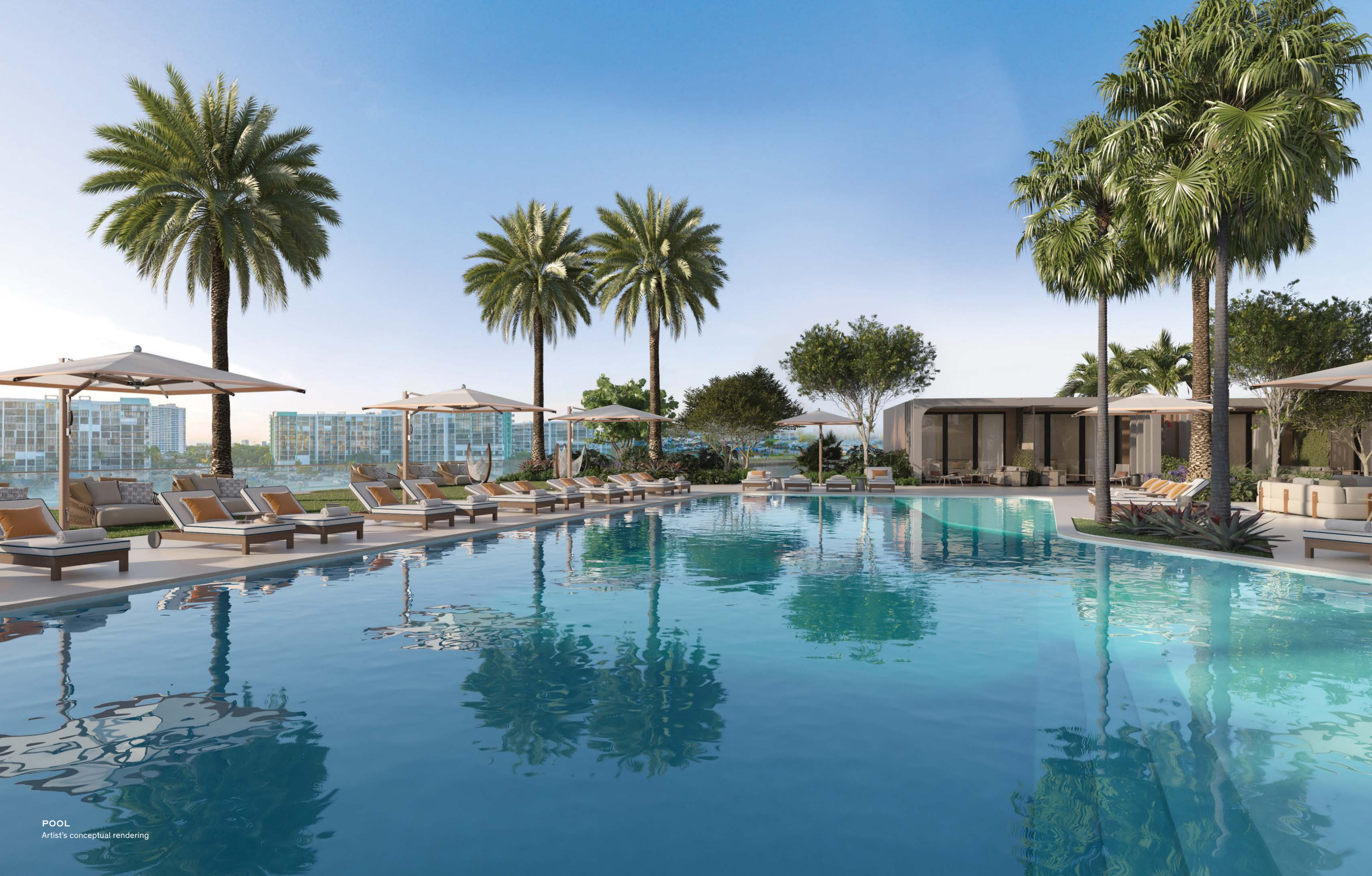
POOL Artist's conceptual rendering