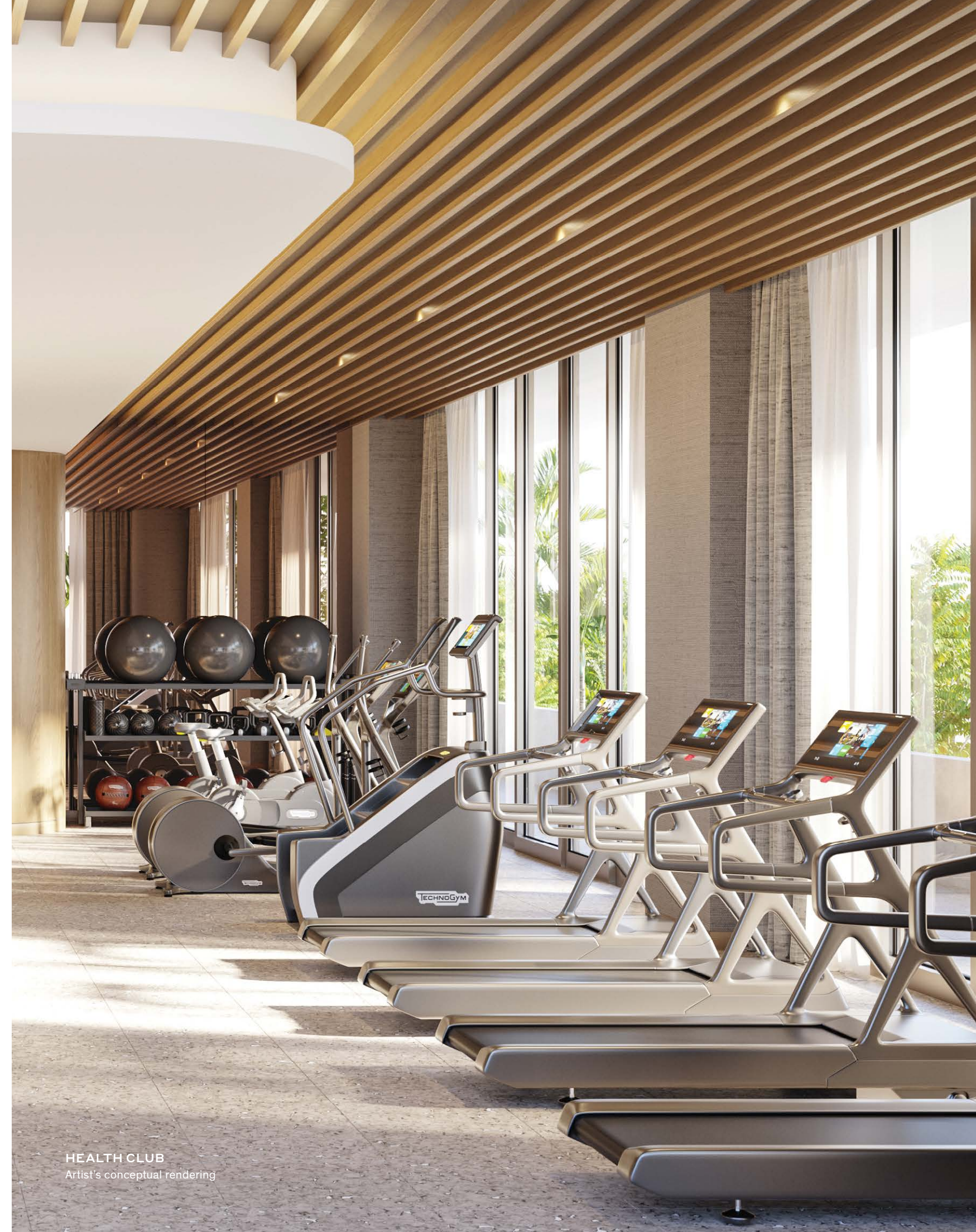
HEALTH CLUB Artist's conceptual rendering