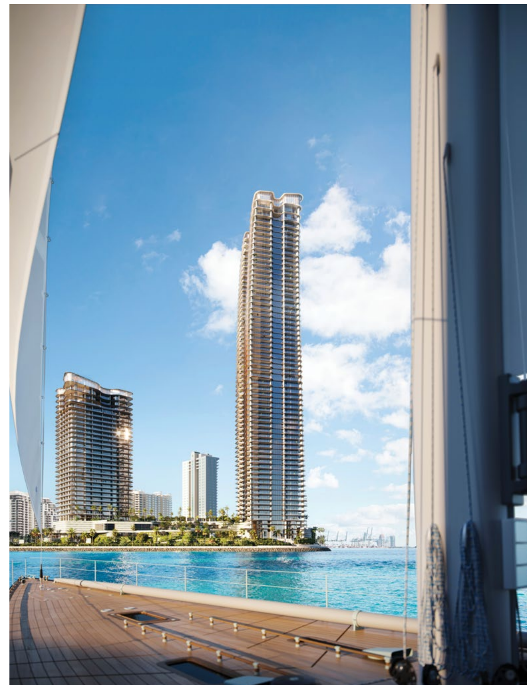
An exclusive oasis of calm, The Residences offers a refreshing retreat, while being only moments from the vibrant city center.