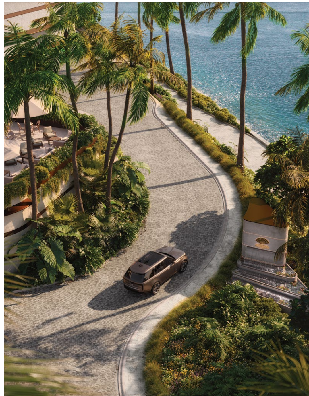
Secluded and sophisticated, The Residences is an island on an island.