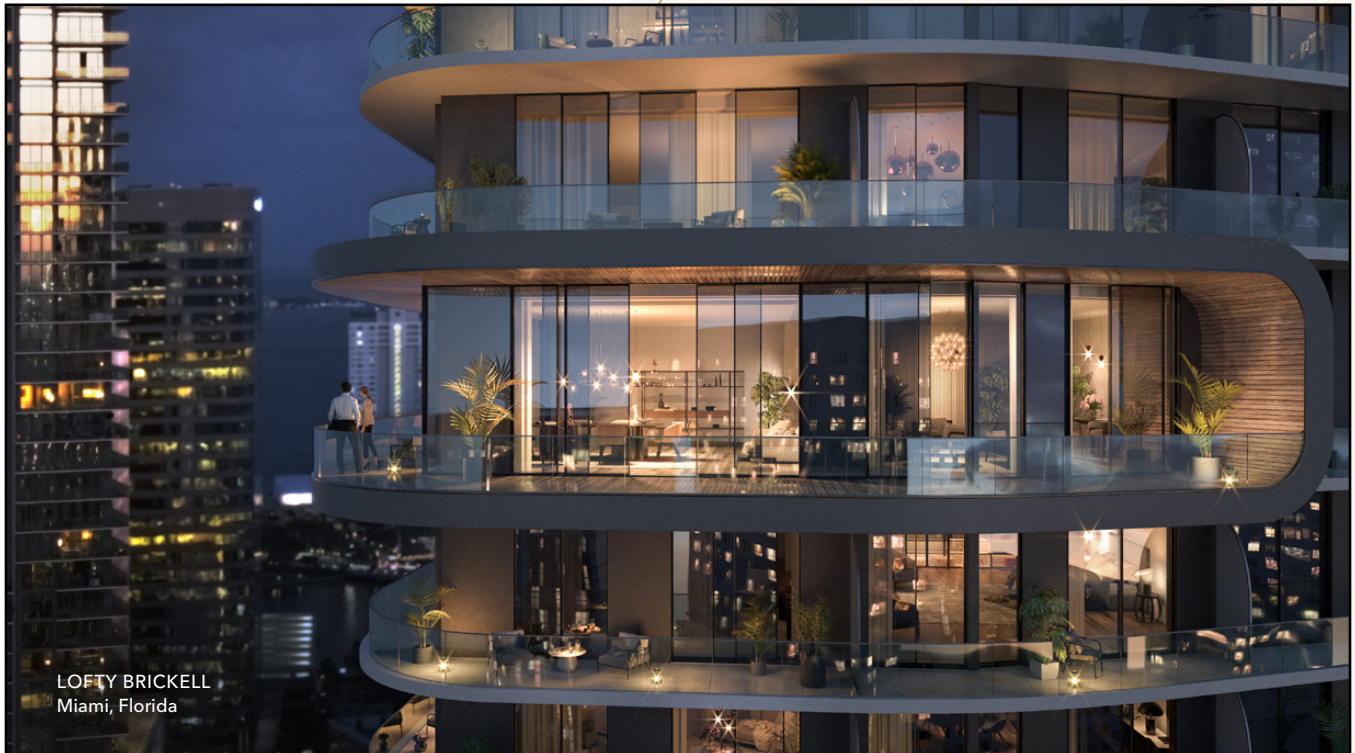
LOFTY BRICKELL Miami, Florida

A SELECTION OF NEWGARD DEVELOPED PROPERTIES