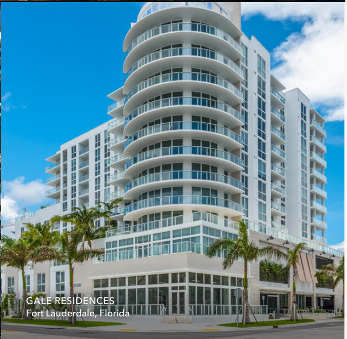
GALE RESIDENCES Fort Lauderdale, Florida