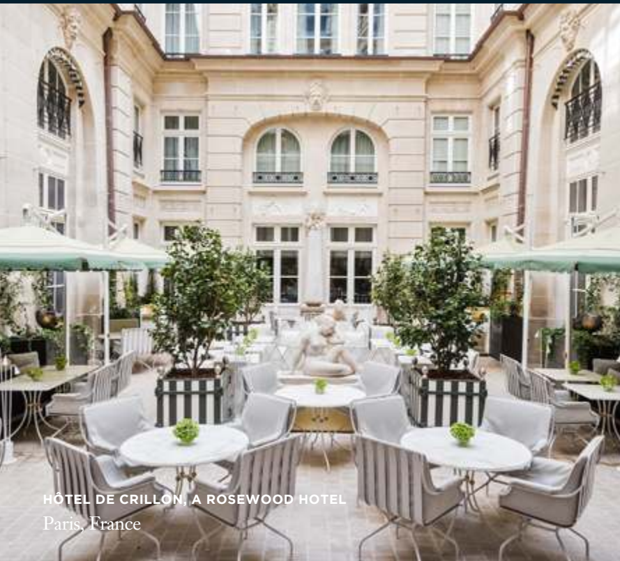
HÔTEL DE CRILLON, A ROSEWOOD HOTEL Paris, France