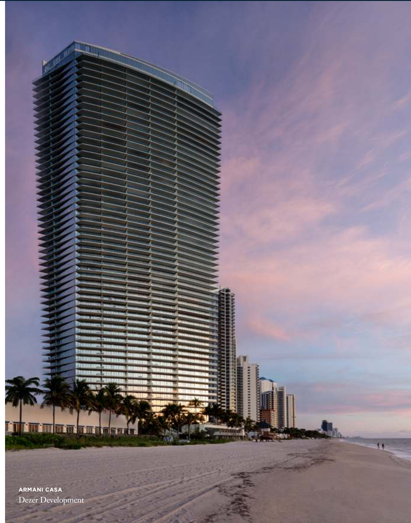
ARMANI CASA Dezer Development

Today, Dezer Development has arguably one of the largest holdings of beachfront property in the state. In addition to these properties, the Dezers have significant holdings in New York. Their portfolio encompasses more than 20 properties with over 1 million square feet. Dezer Development's branded real estate portfolio includes six Trump-branded towers, the Porsche Design Tower, and Residences by Armani/Casa. Generating an unprecedented response from a broad range of local, national, and international buyers, the prolific developer has successfully sold over 2,700 units and generated over $3.6 billion in sales.