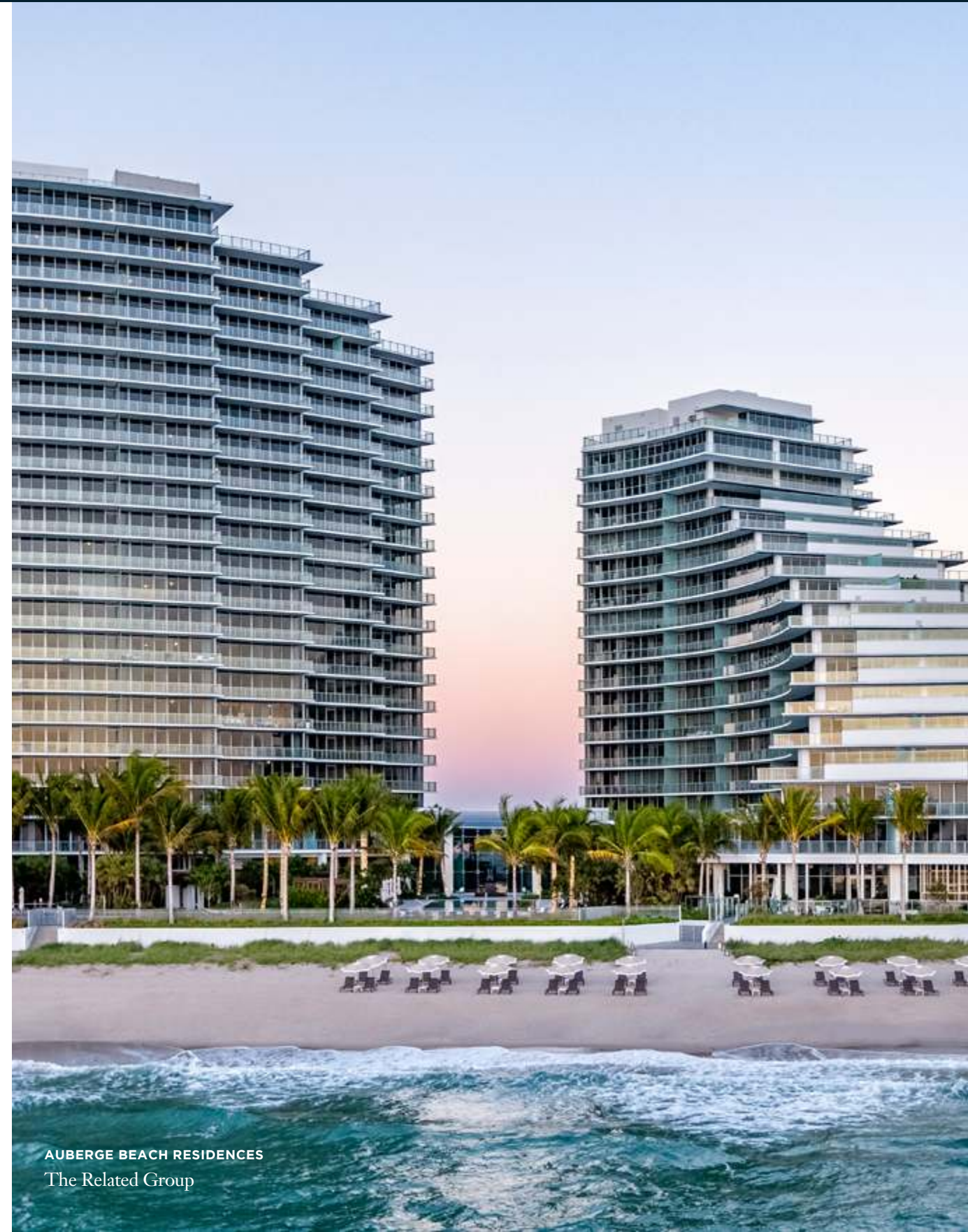
AUBERGE BEACH RESIDENCES The Related Group