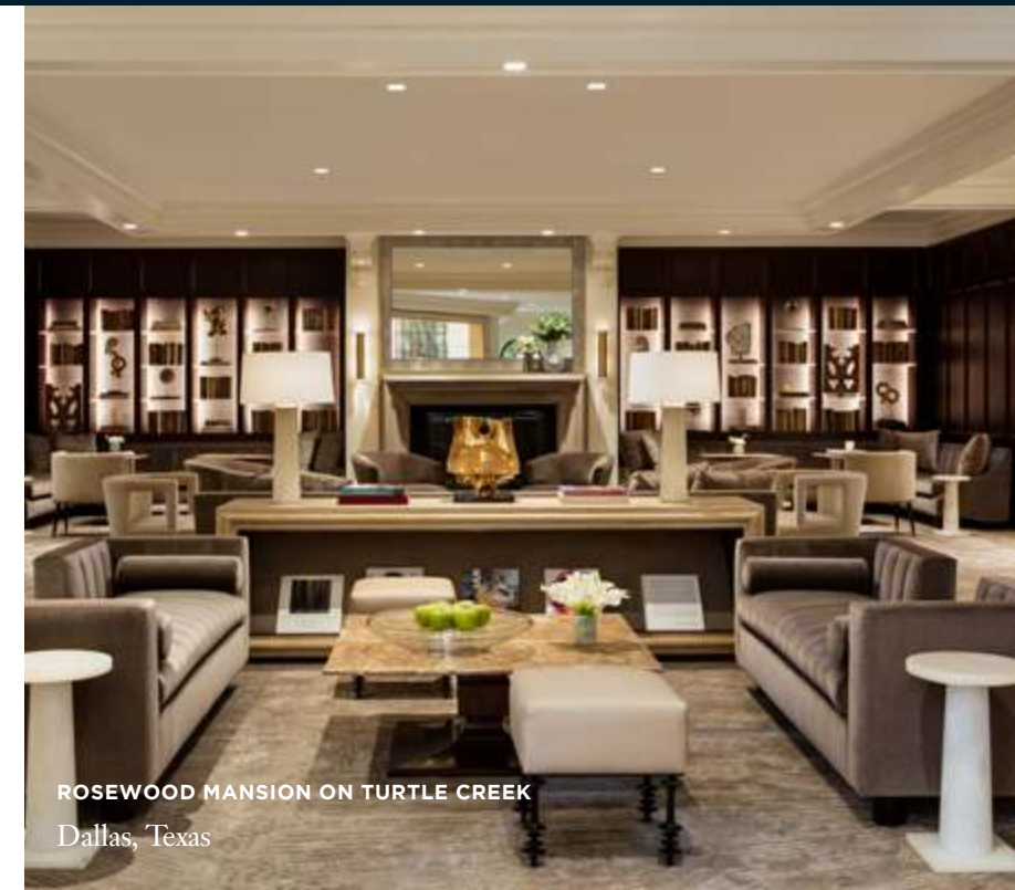
ROSEWOOD MANSION ON TURTLE CREEK Dallas, Texas