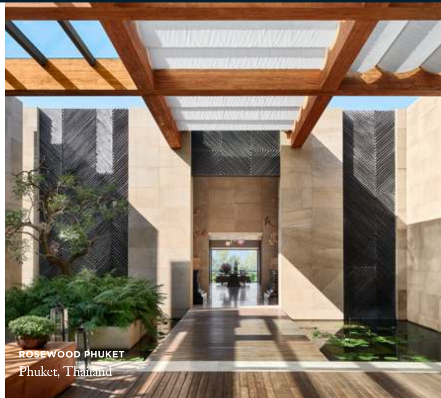
ROSEWOOD PHUKET Phuket, Thailand