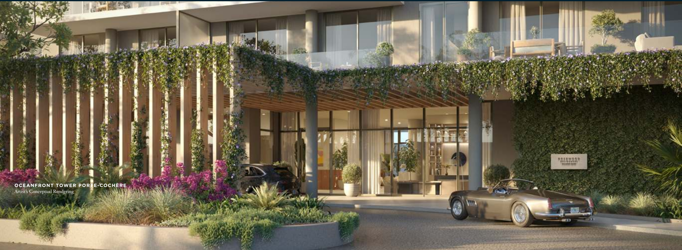
OCEANFRONT TOWER PORTE-COCHÈRE Artist's Conceptual Rendering