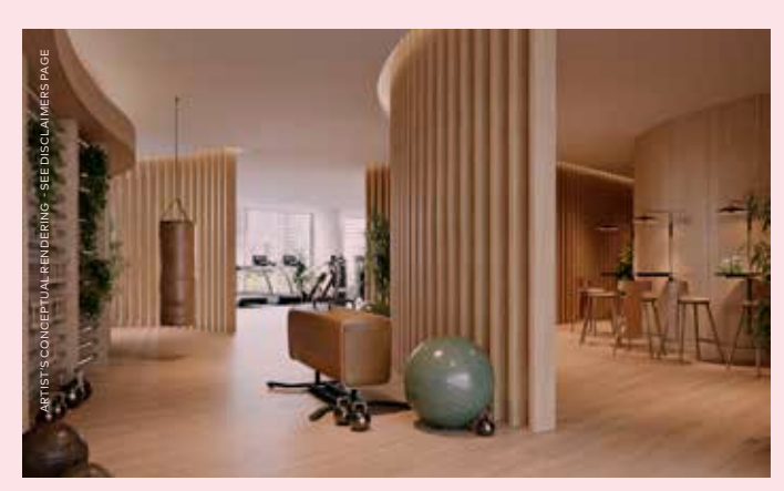
Bayshore Club Fitness Zone