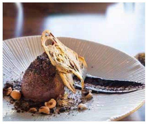
ALMA / Photo Credit: Carlos M. Silva @carlosmsilvaphoto

The menu for this modern Spanish restaurant opens with a long list of tapas that includes roasted bone marrow with oxtail and caramelized onions; steamed mussels with chorizo; and buttermilk-fried quail with a sriracha-romesco sauce. The entrée list is smaller but no less appealing, featuring a dryaged rib-eye served with Padrón peppers and a branzino with piquillo peppers sofrito, among others. The wine list is extensive and the dining room is austere but sophisticated.