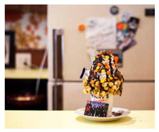
Vicky's House Milkshake Bar and Tasting Room