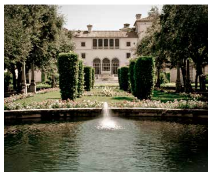
Vizcaya Museum and Gardens

Located on the northern end of Coconut Grove on Biscayne Bay, Vizcaya was the winter estate of manufacturing magnate James Deering, who spent the years between 1912 and 1922 constructing the building and furnishing it with antiquities and artifacts, particularly from Italy. Today, the site is open to the public for guided tours of the house and gardens, which include a stunning collection of native and exotic flora. Gray foxes live on and around the property, so keep your eyes open for them.