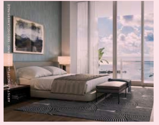
Bayshore Master Bedroom