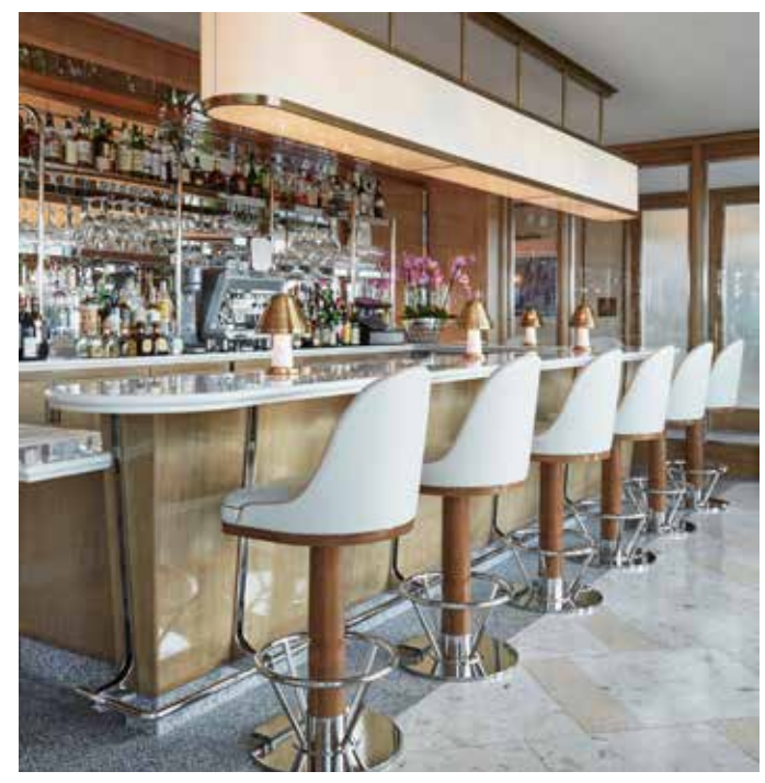
Bellini at Mr. C Hotel