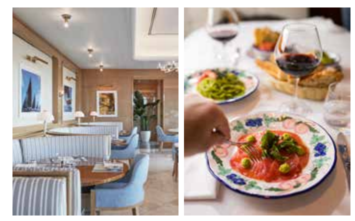
Mr. C Hotel