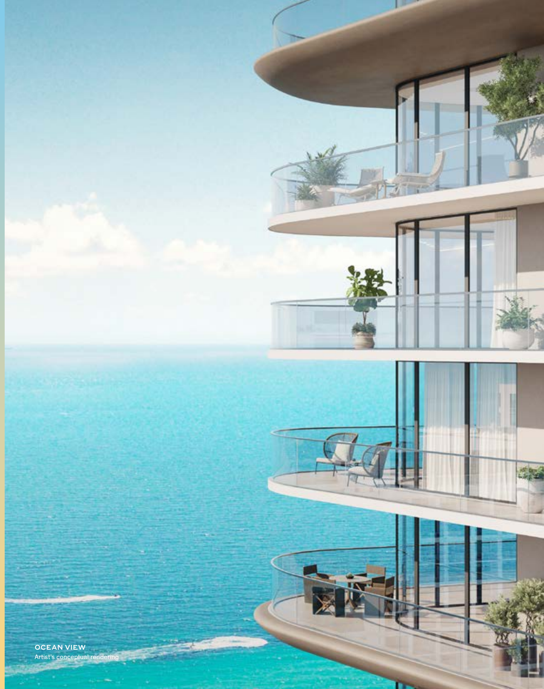
OCEAN VIEW Artist's conceptual rendering

ORAL REPRESENTATIONS CANNOT BE RELIED UPON. FOR CORRECT REPRESENTATIONS, MAKE REFERENCE TO THE OFFICIAL RECORDS OF THE FLORIDA STATUTES, TO BE FURNISHED BY A DEVELOPER.