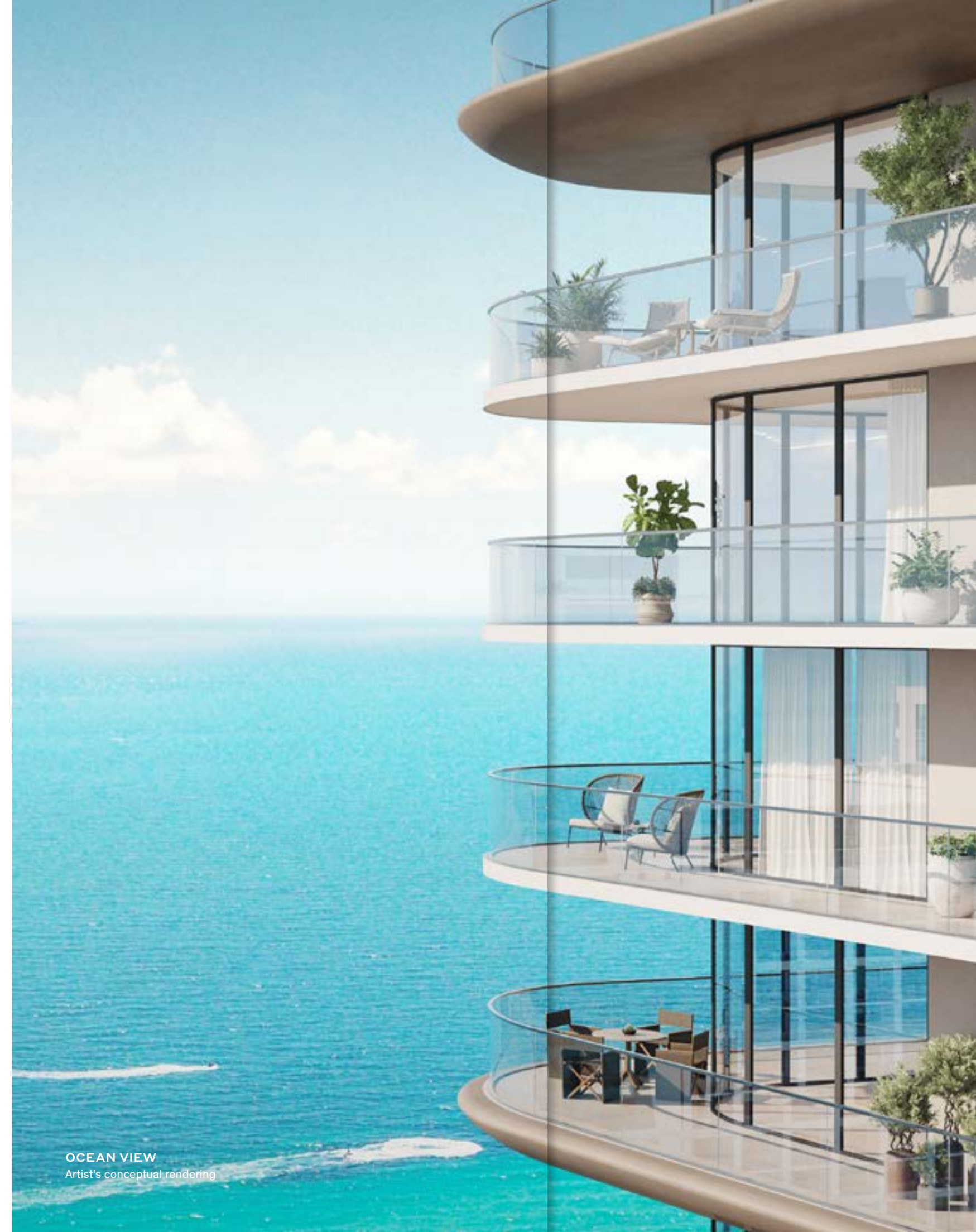
OCEAN VIEW Artist's conceptual rendering

ORAL REPRESENTATIONS CANNOT BE RELIED UPON AS CORRECTLY STATING REPRESENTATIONS OF THE DEVELOPER. FOR CORRECT REPRESENTATIONS, MAKE REFERENCE TO THIS BROCHURE AND TO THE DOCUMENTS REQUIRED BY SECTION 718.503, FLORIDA STATUTES, TO BE FURNISHED BY A DEVELOPER TO A BUYER OR LESSEE.