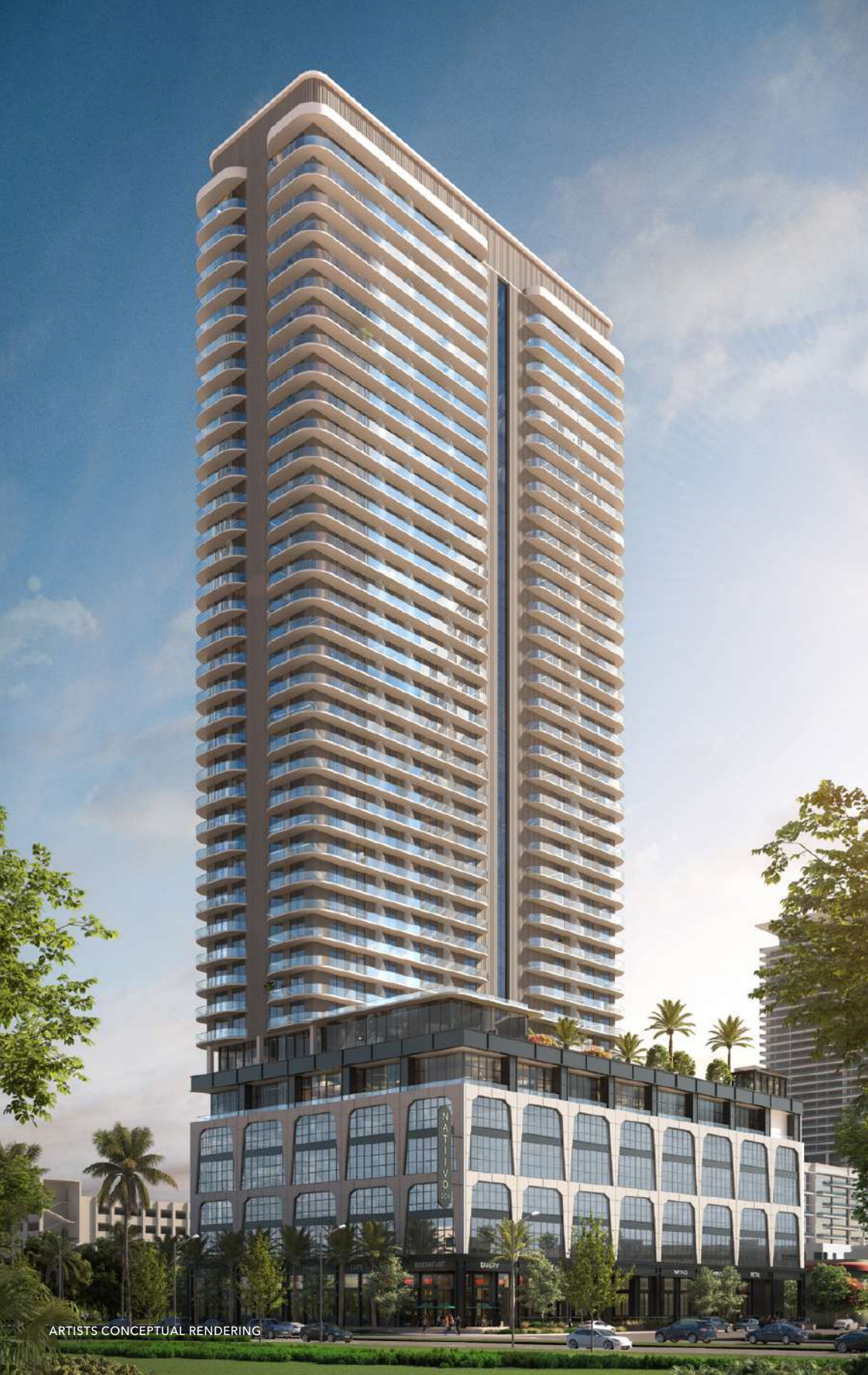
ARTISTS CONCEPTUAL RENDERING