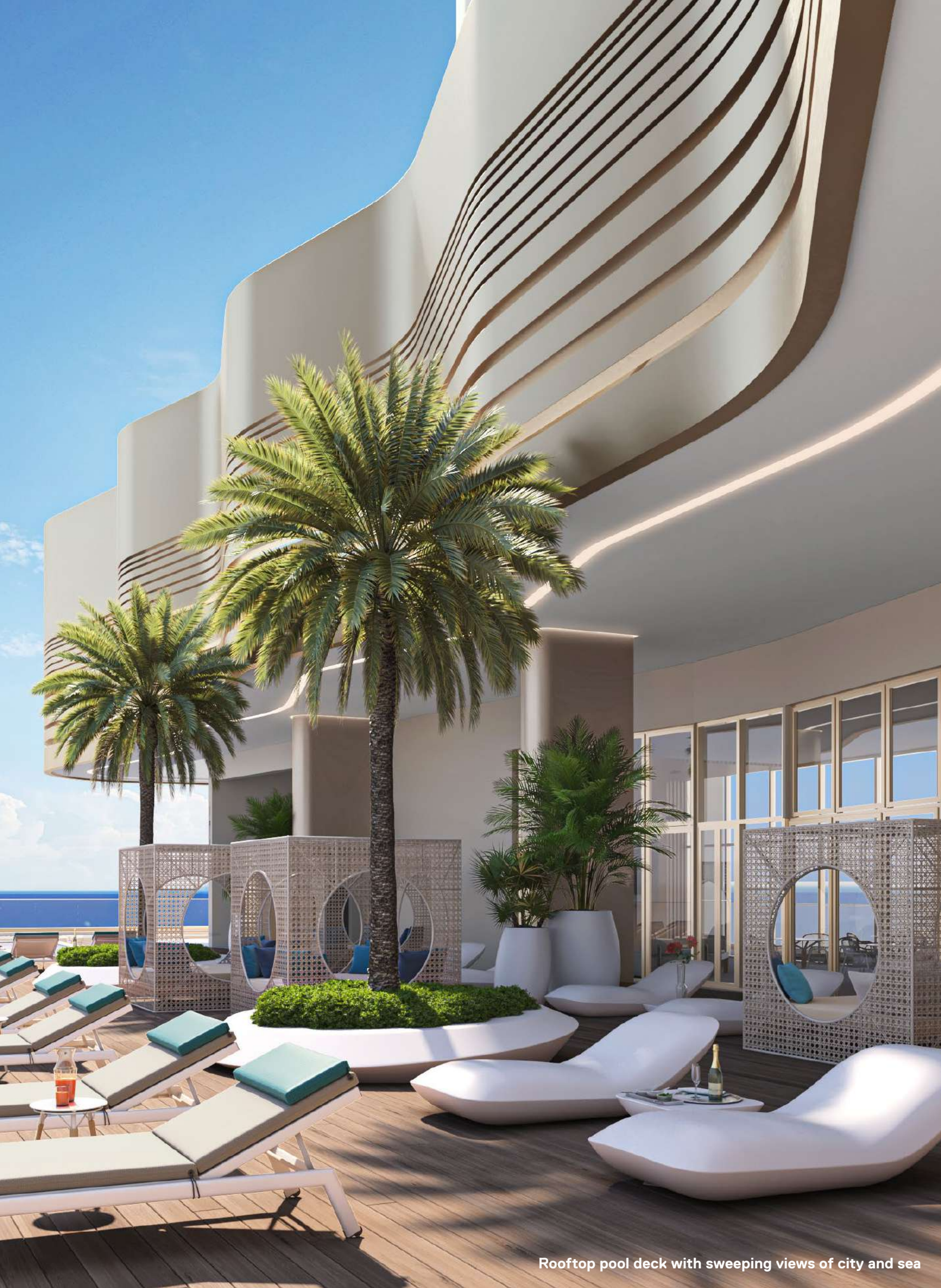
Rooftop pool deck with sweeping views of city and sea