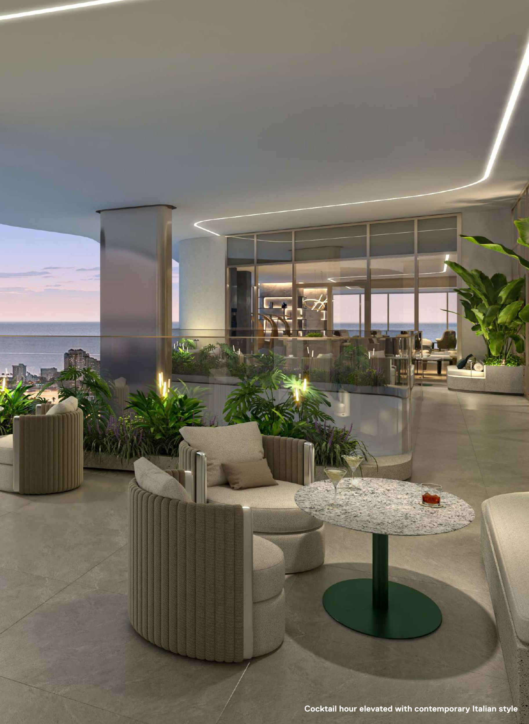
Cocktail hour elevated with contemporary Italian style