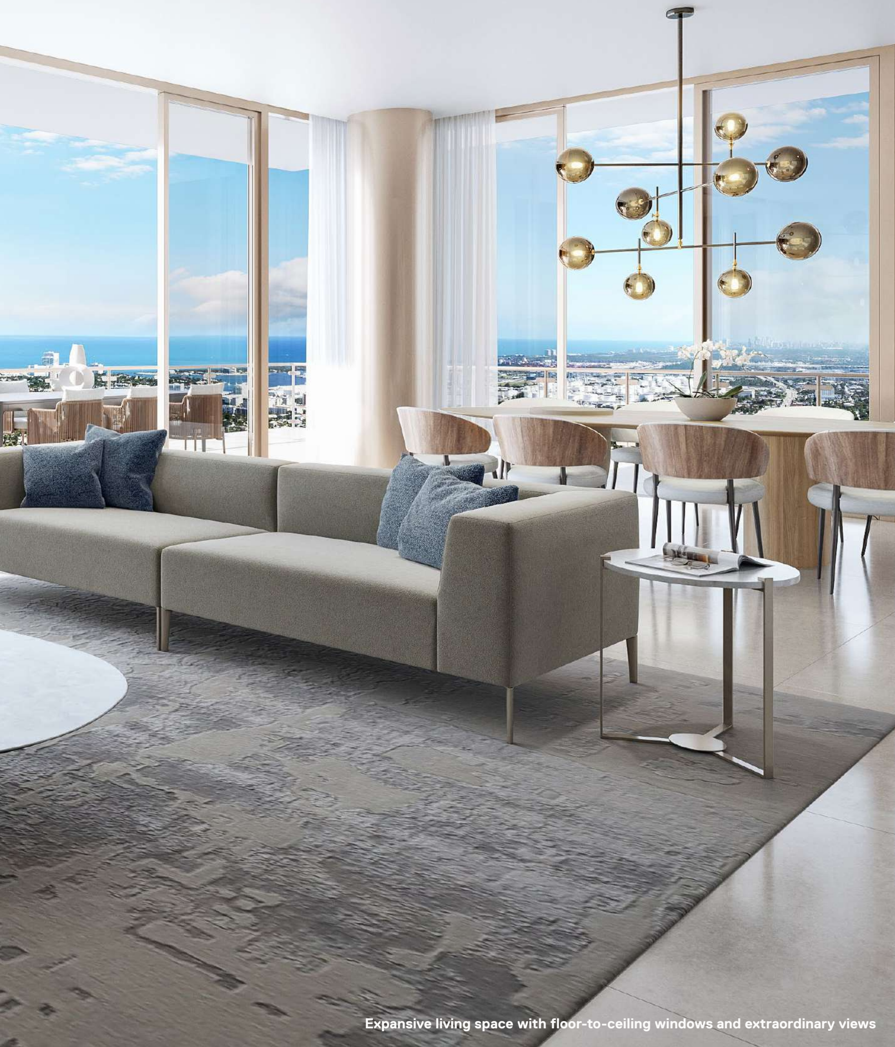
Expansive living space with floor-to-ceiling windows and extraordinary views