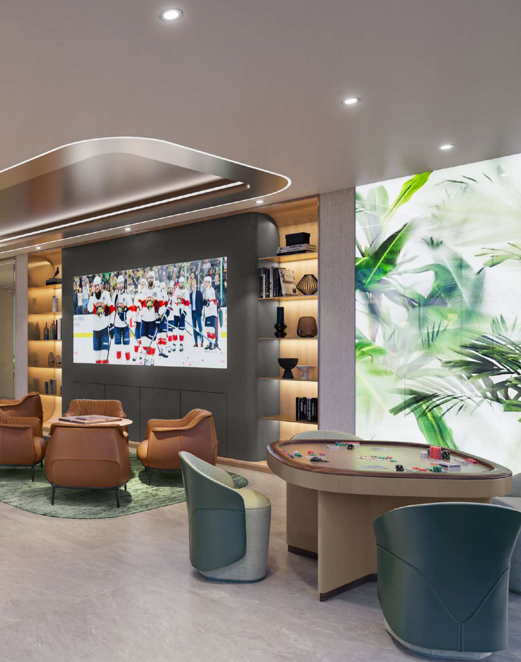
Sports Lounge with five-star entertainment, perfect for hosting game nights