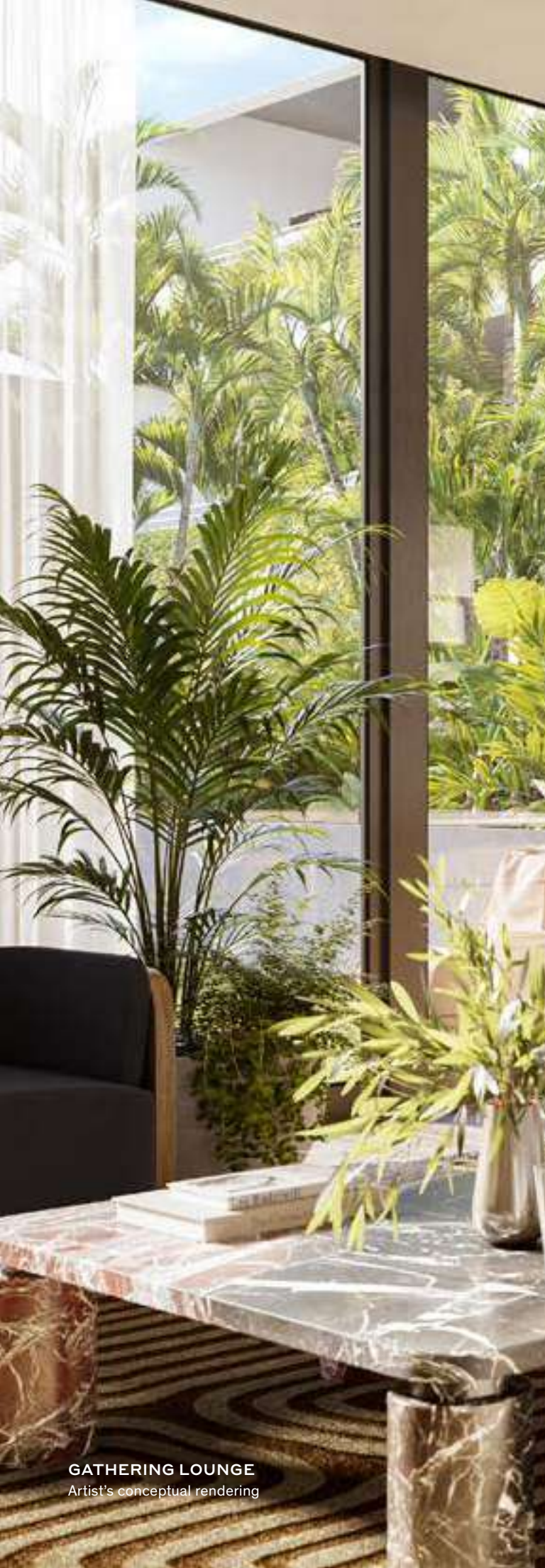
GATHERING LOUNGE Artist's conceptual rendering