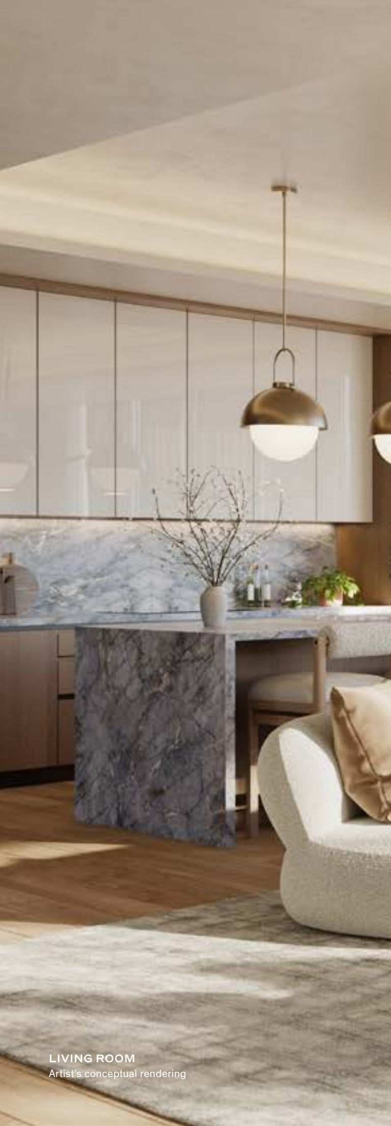
LIVING ROOM Artist's conceptual rendering