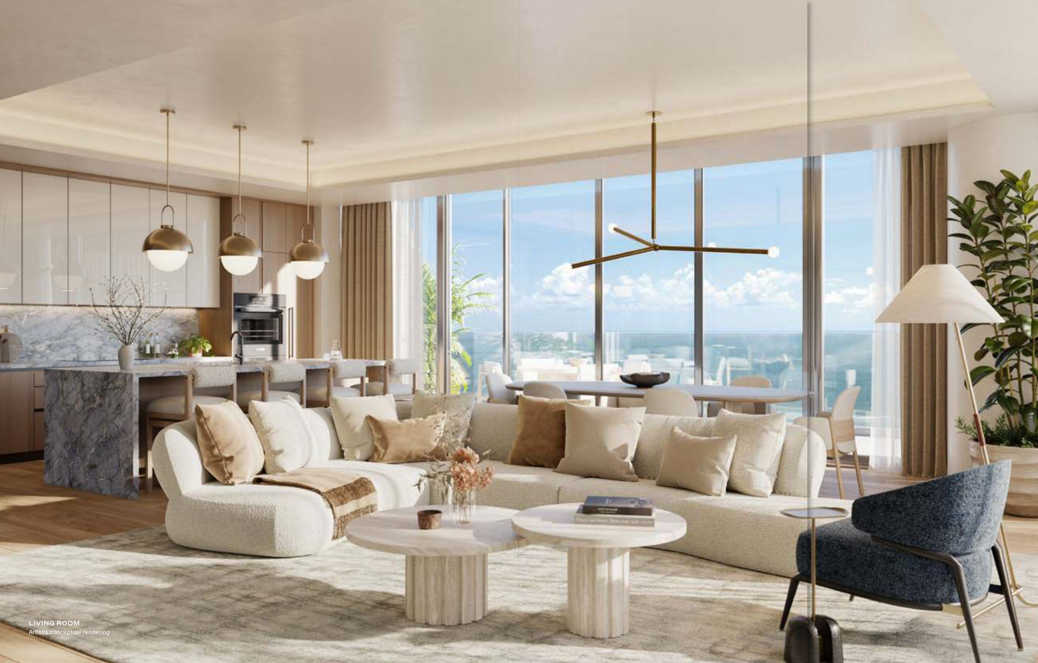
LIVING ROOM Artist's conceptual rendering