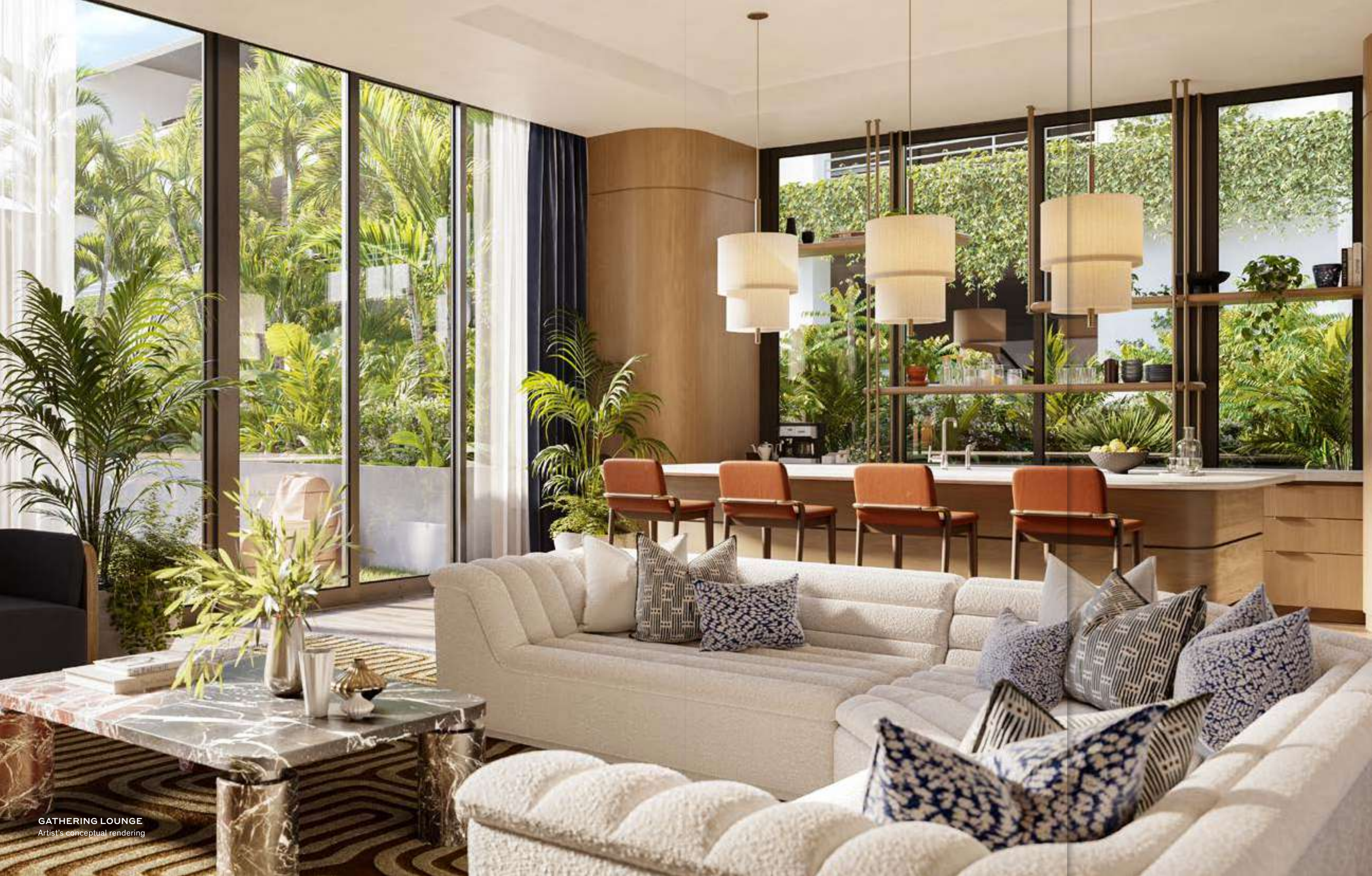
GATHERING LOUNGE Artist's conceptual rendering