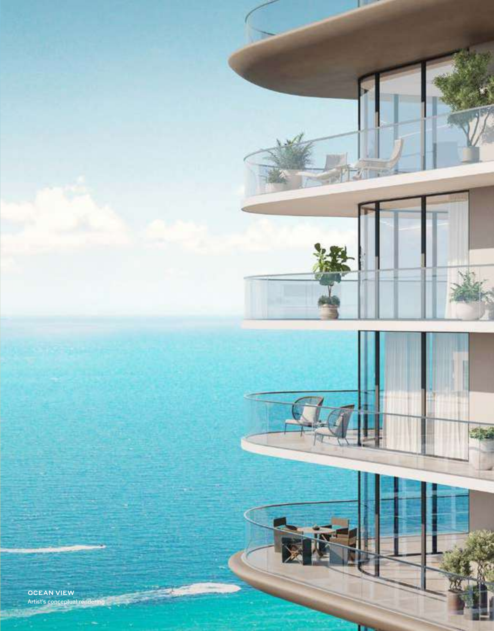
OCEAN VIEW Artist's conceptual rendering