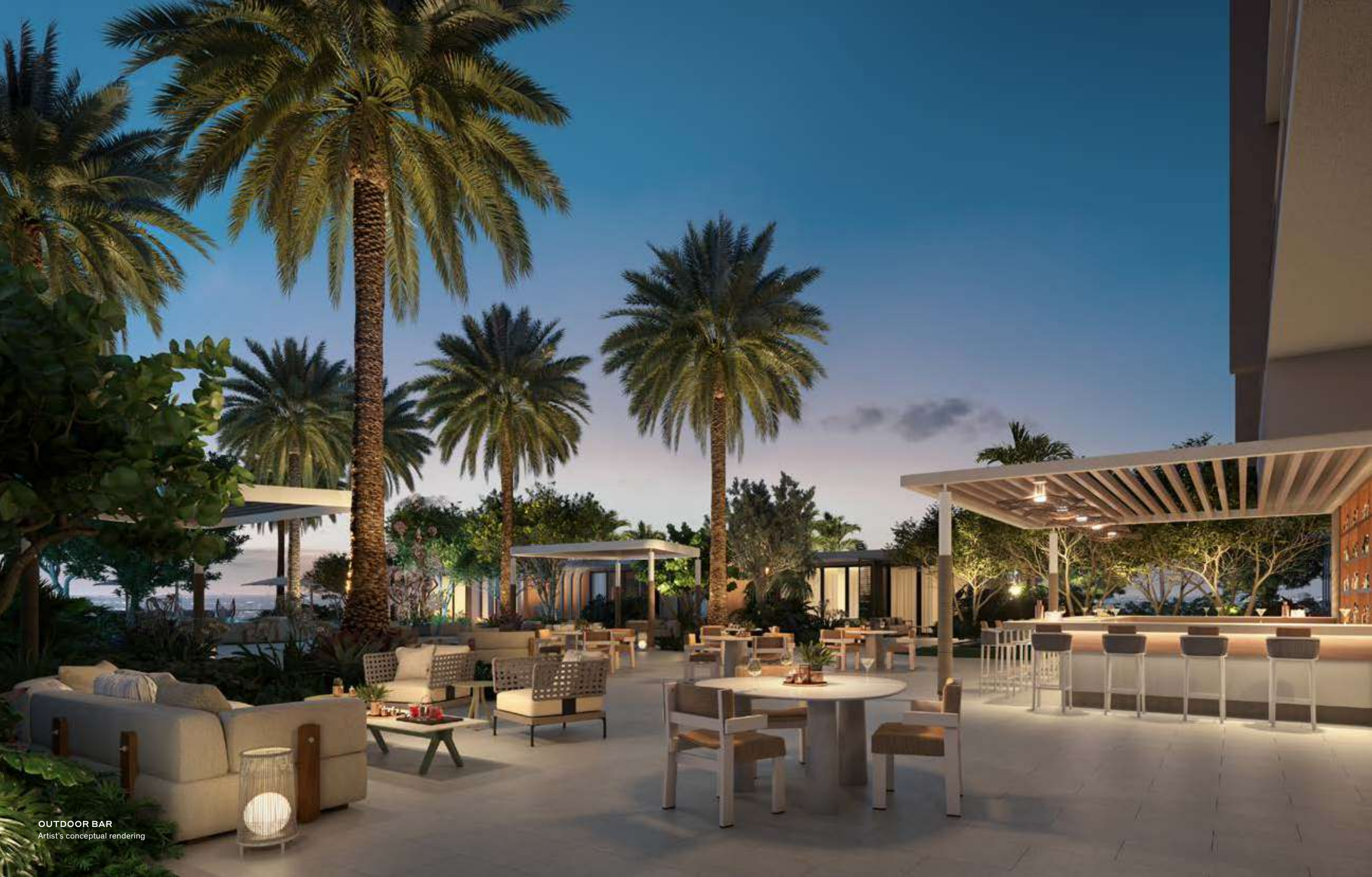
OUTDOOR BAR Artist's conceptual rendering