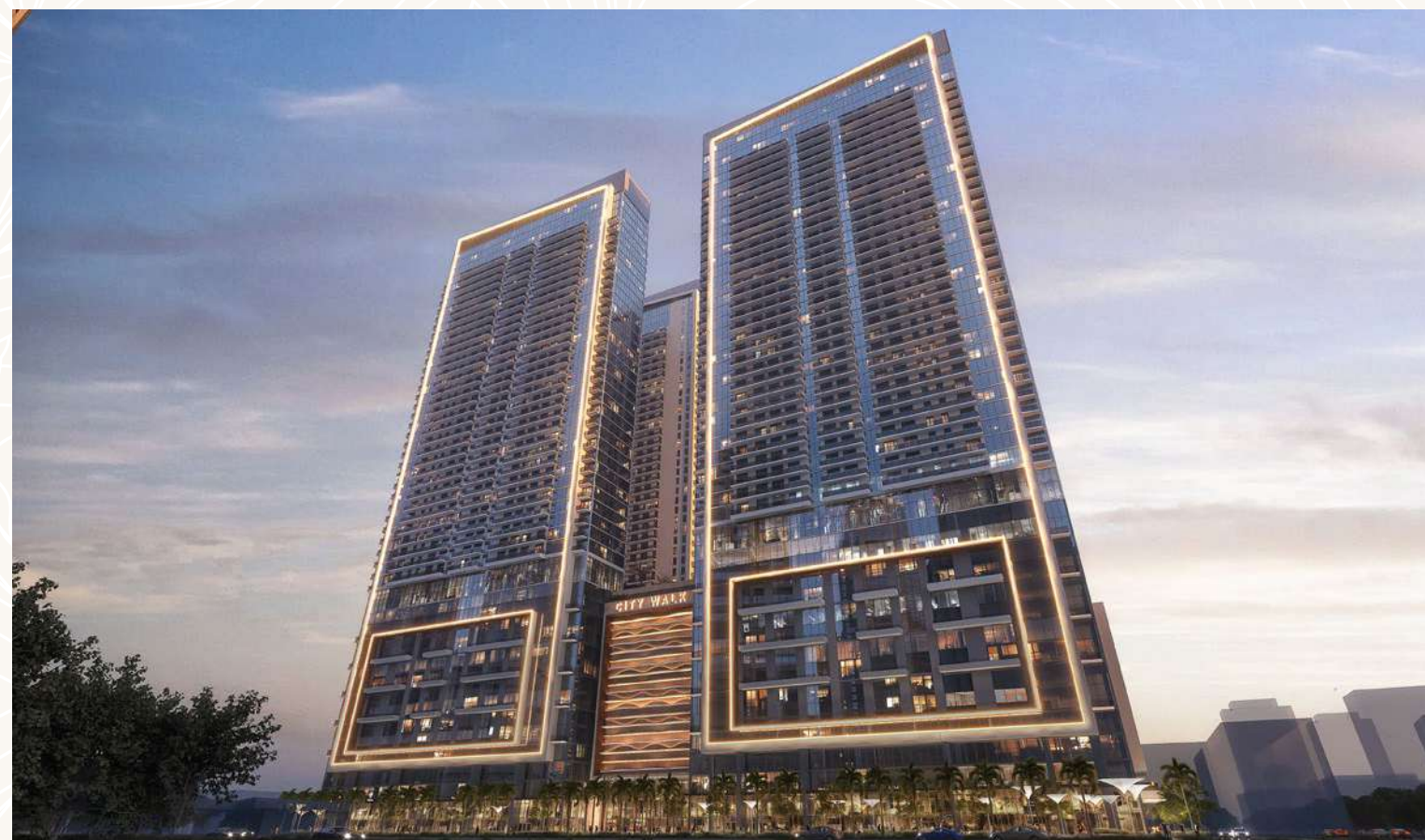
201 WEST BROWARD • FORT LAUDERDALE, FL

FSMY's deep history allows their knowledge base of codes, program, and detail to provide an invaluable level of quality with fewer challenges. FSMY's understanding of how important constant communication and the coordinated efforts of the team is, allows them to anticipate issues and add value to any Project. Their greatest satisfaction comes from providing an enjoyable and profitable experience for profitable for the entire team and establishing lasting relationships. What differentiates them is their 3D Modeling of Designs for coordination and client use as well as their in-house renderings and walkthroughs.