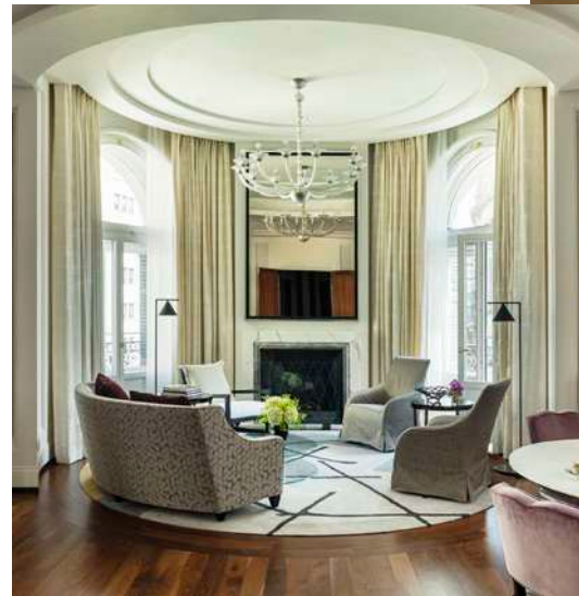
FOUR SEASONS HOTEL MADRID

Drawing inspiration from the coastal locale, BAMO has masterfully crafted interiors that embody understated luxury and serenity. Interiors are meticulously curated with clean lines and tailored details, infused with hints of retro-inspired glamour, resulting in an ambiance of cool, classic elegance, refined comfort, and timeless sophistication.