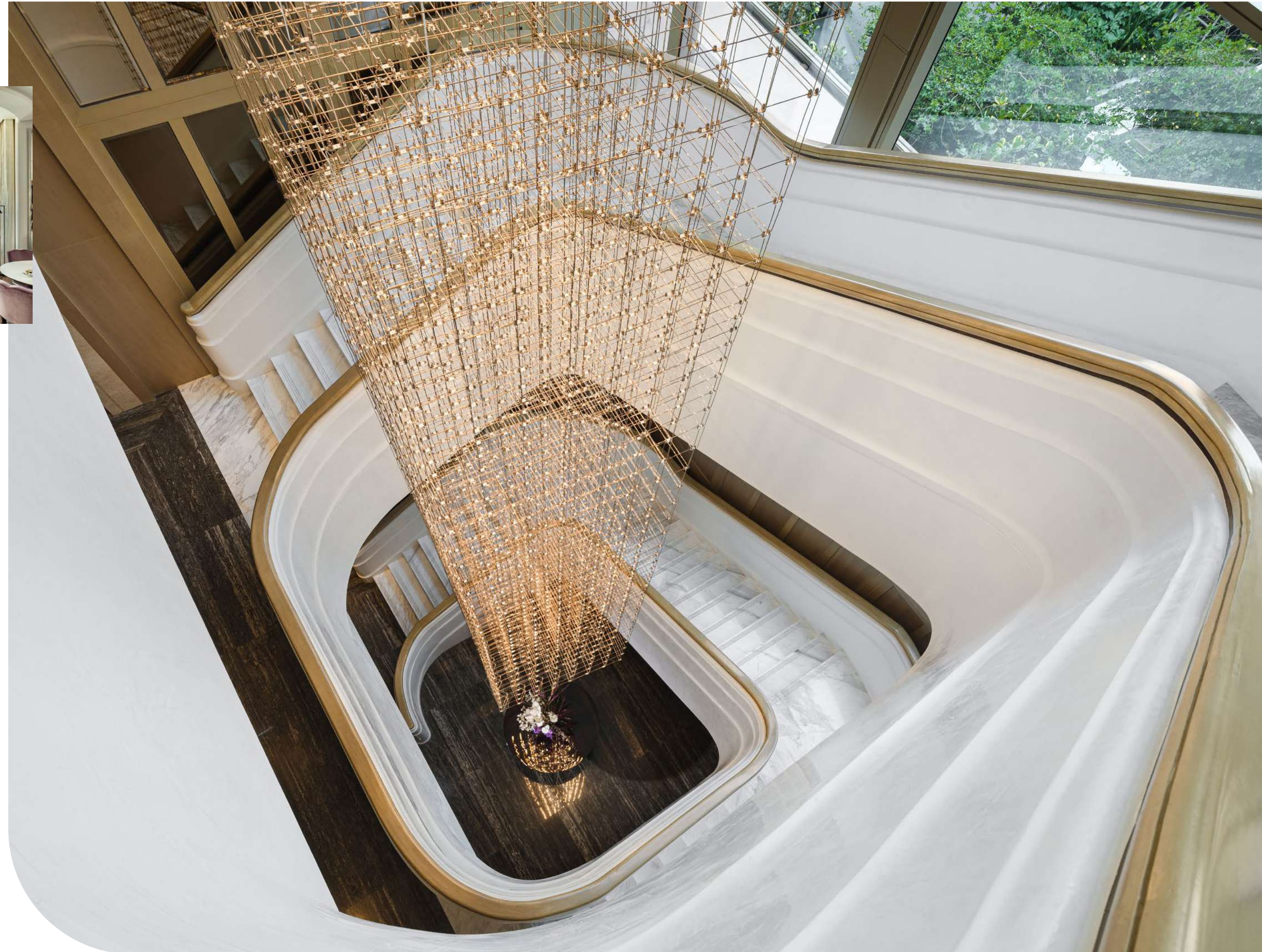
THE CAPELLA HOTEL BANGKOK