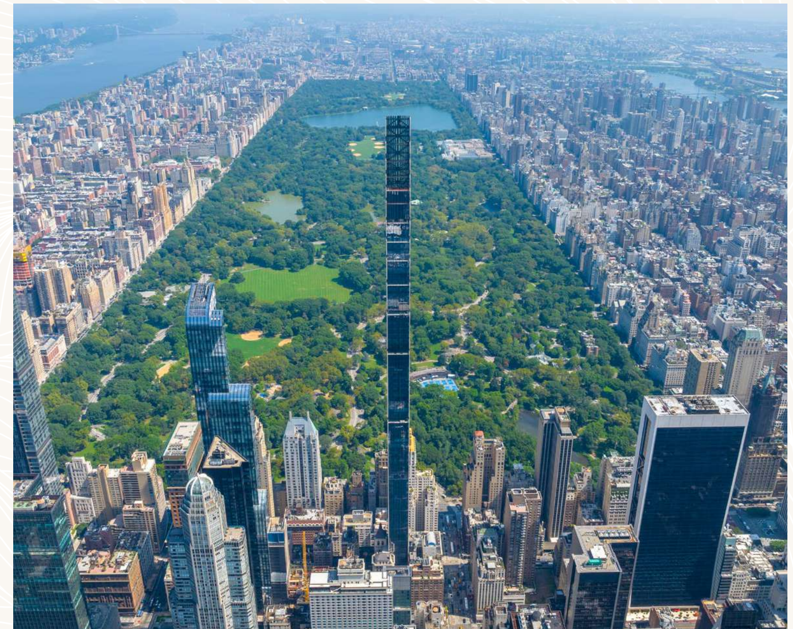
III WEST 57TH STREET • NEW YORK