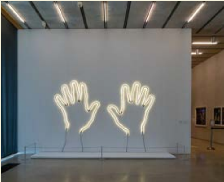
TOP: Wynwood Walls; MIDDLE: Penetrável Macaléia by Hélio Oiticica at Pérez Art Museum Miami; BOTTOM: Notes for a Poem on the Third World, Glenn Ligon, Pérez Art Museum Miami