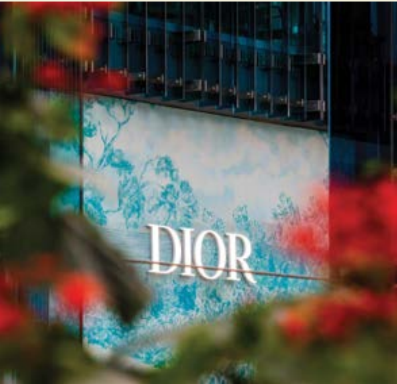
DIOR, DESIGN DISTRICT

From avant-garde boutiques to international designer labels, Miami is a mecca for shopping. There are so many trendy districts to meander through and standalone shops to seek out. In addition to the chic stores throughout Miami Worldcenter, favorites include pedestrian-friendly Lincoln Road, the locally owned shops of Sunset Harbour, the boho concept stores of Wynwood, the global luxury brands and contemporary design stores scattered throughout the Design District, and next-gen department stores The Webster and Faena Bazaar.