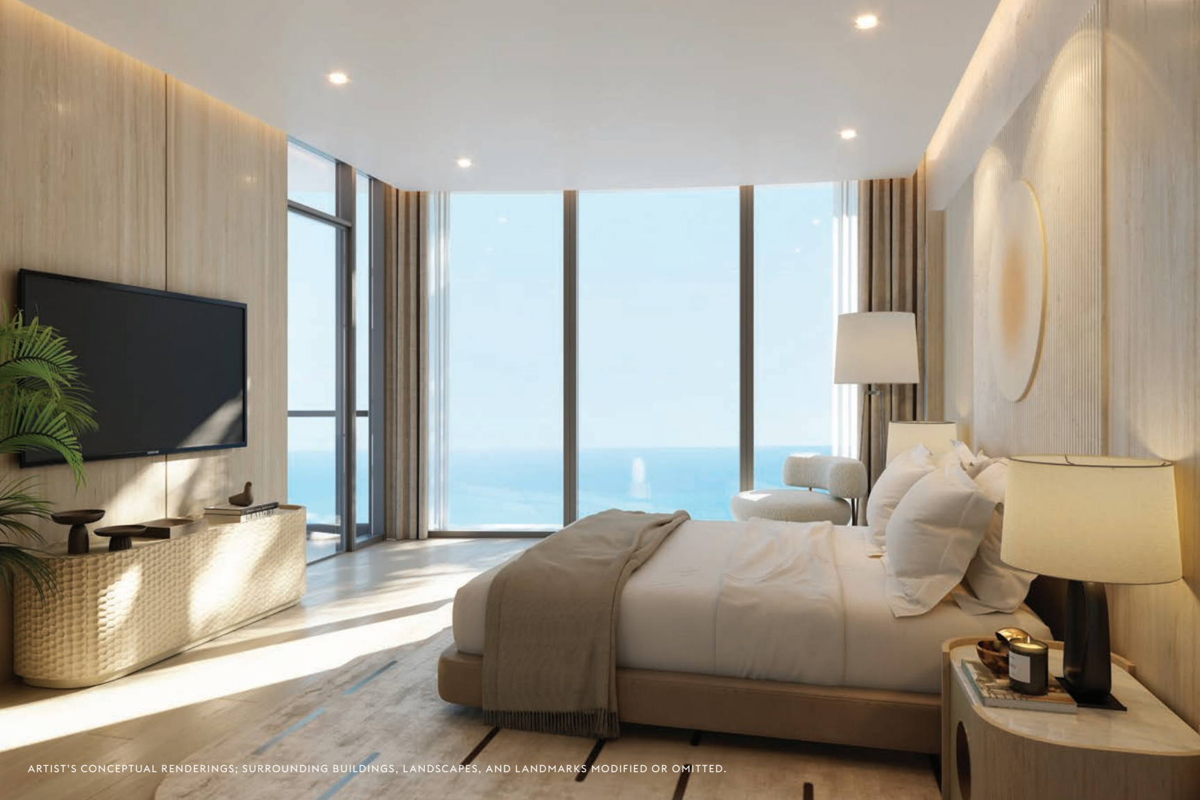
ARTIST'S CONCEPTUAL RENDERINGS; SURROUNDING BUILDINGS, LANDSCAPES, AND LANDMARKS MODIFIED OR OMITTED.